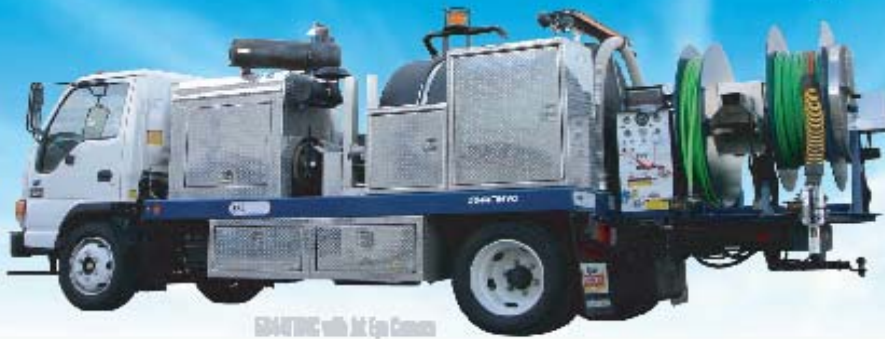
5244TMC with Jet Eye Camera