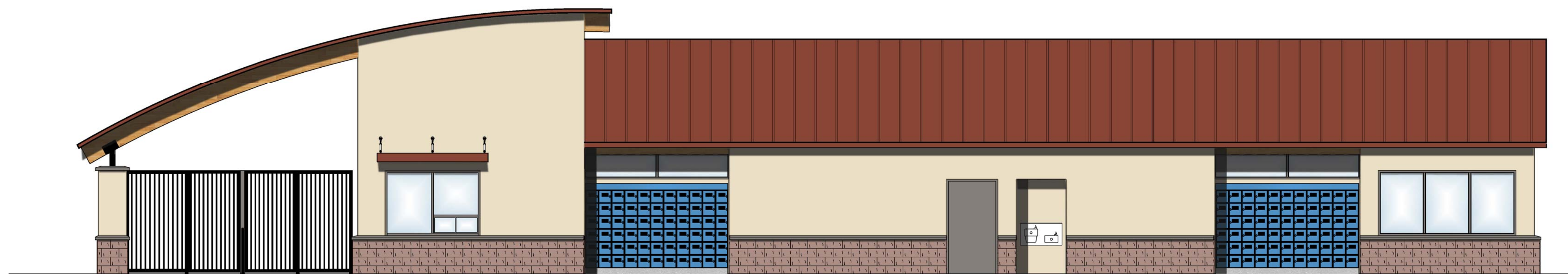
3 EXTERIOR ELEVATION - NESSLER FAMILY AQUATIC CENTER 3/16" = 1'-0"