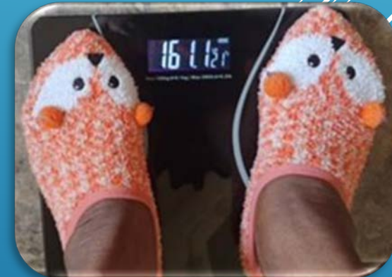
Maintain No Gain Program