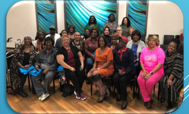
Great Day Houston