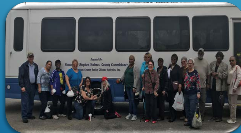
Transportation Enrichment Program

Transportation Enrichment Program: This program aims to enhance outings for groups of older adults 55 and over to enjoy scenic/adventurous day trips within 150 mile radius.