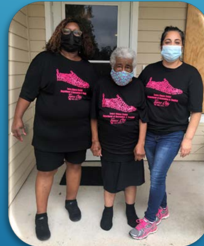
Breast Cancer Awareness Month