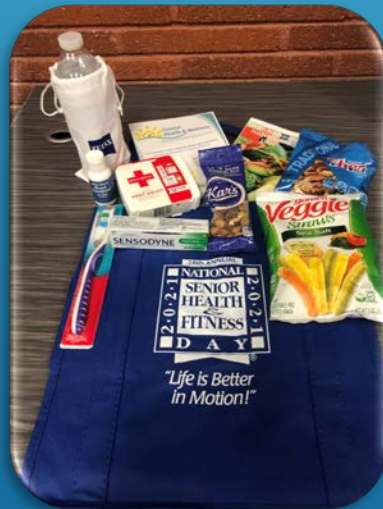
National Senior Health & Fitness Day