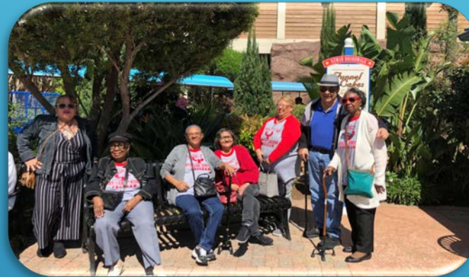
Kemah – Lighthouse Buffet