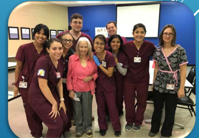
UTMB Nursing Students