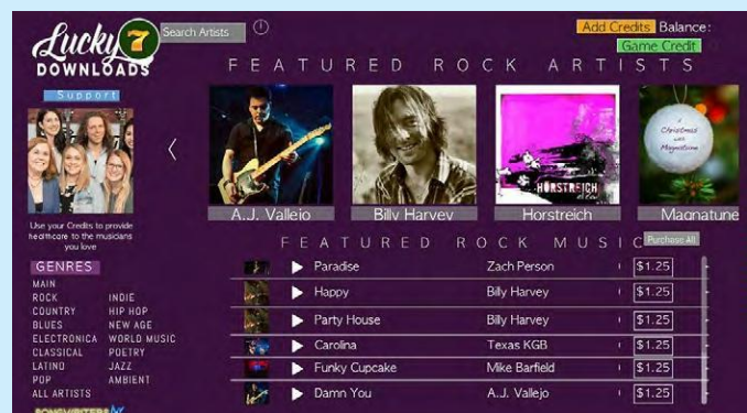
There are more than 21,000 songs to purchase on Lucky7Downloads.com.

Our strategy begins by offering retail merchants (primarily bars, pool halls, and arcades) an opportunity to share our business initiatives and sell their customers original songs available on our website, each priced at $1.00 + sales tax. Customers can either purchase Music Packs of pre-selected songs or a Music Download Gift Certificate that can be redeemed at the Lucky 7 Downloads website for the full value of their purchase. Customers select from more than 21,000 songs (and growing) to download and play on their computers and mobile devices, similar to the way the iTunes ® application works.