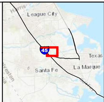
VICINITY MAP 1 INCH = 10 MILES