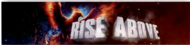
Here is the graphic itself.