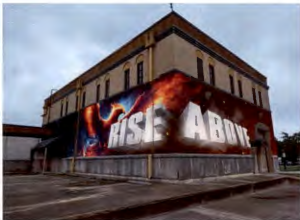
This is what the design would look like wrapped around the building.