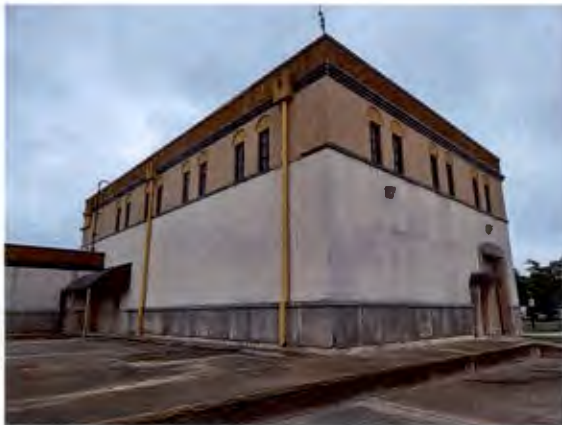
The building before the Mural.

This is originally the wall space that I was contacted about. Which is where I would love to do the Phoenix Mural for you guys. Below is the graphic that has been designed for this space.