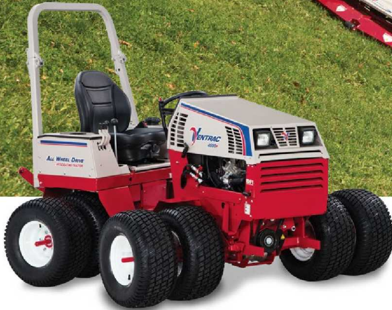
Shown with Turf Tires