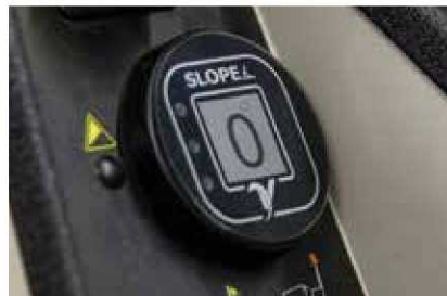
Digital Slope Gauge Recommended for operation on slopes.