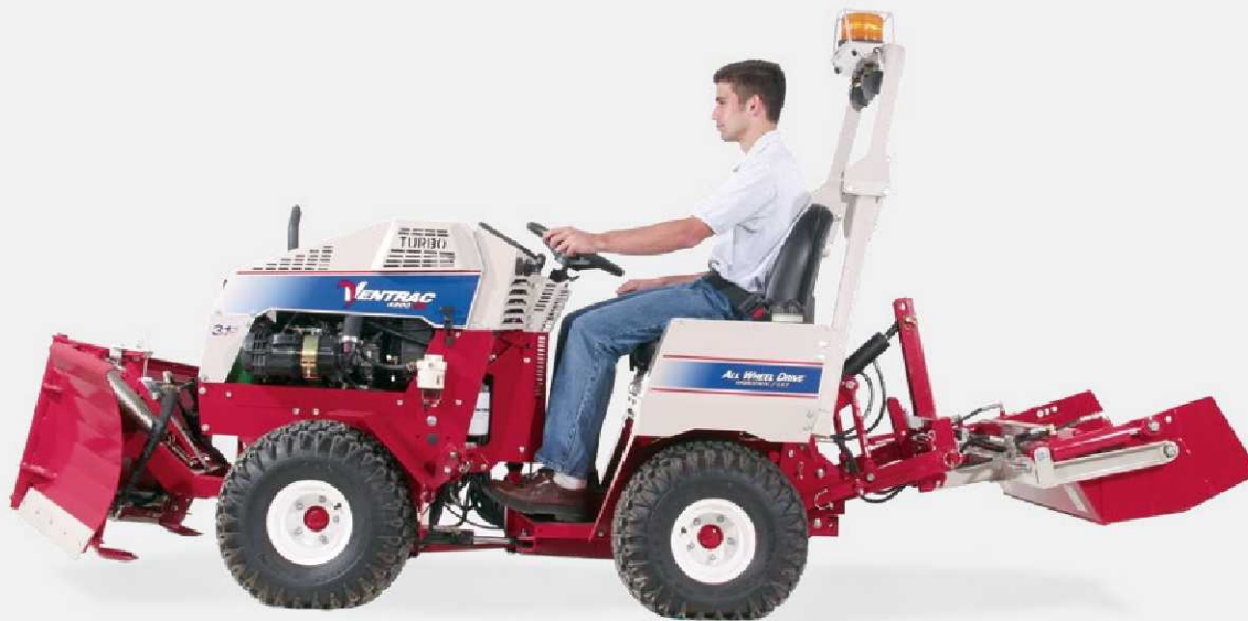
Rear mounted attachment on 3-N-1 Adapter shown with optional Hydraulic Top Link