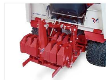
Optional Weights (up to six 42lb weights)

The 3-N-1 Adapter has a lock-in lever for locking on attachments and is able to operate non-PTO-powered attachments. This enables you to mount two attachments for use on the front and rear of the tractor at the same time.