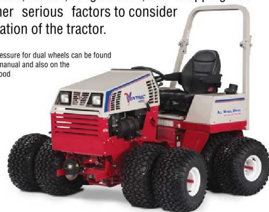
Shown with Standard Tires

*Recommended tire pressure for dual wheels can be found in the 4500 operator manual and also on the sticker inside of the hood