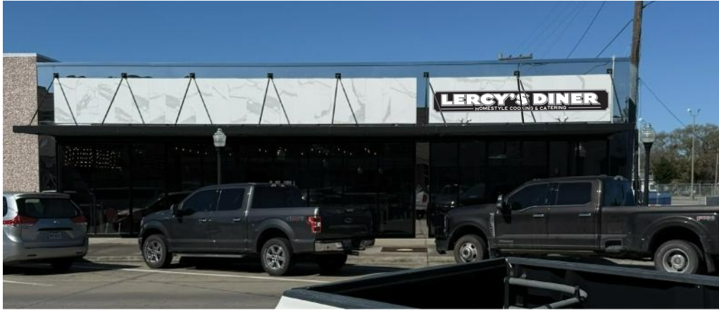
2'x 16' non lit sign panel