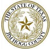
Jim Hogg County