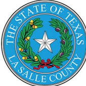
La Salle County