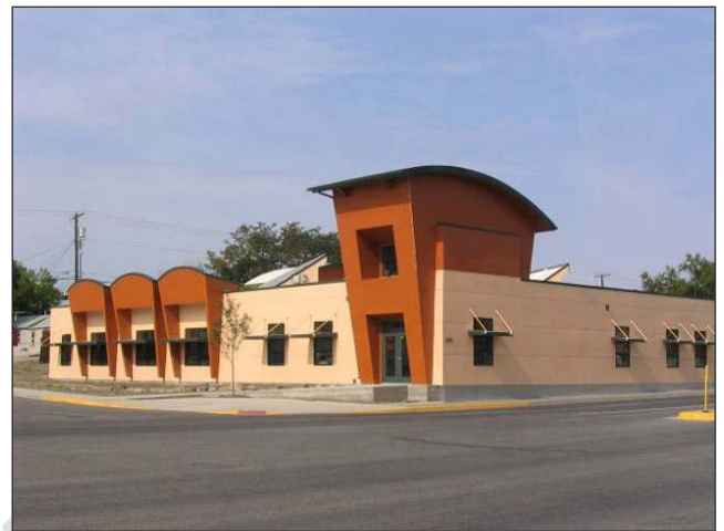
After – NPRC Building