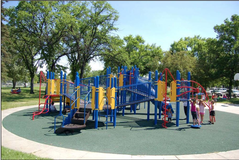
Central Park Playground

Recent neighborhood projects include: resurfacing of the tennis courts in Central, Pioneer, and North parks; the addition of spray features at the North Park spray pad; the purchase and installation of a new pool heater and pool cover for the South Park neighborhood pool; the installation of fencing, backstops and dugout roofing for South Park Ball Field. This fiscal year, the playground equipment at Central Park was purchased utilizing CDBG funding and was installed by Park employees.