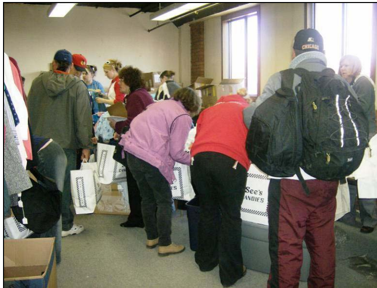
Project Homeless Connect