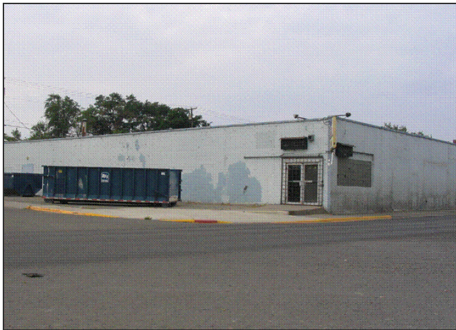
Before - Food Bank Grocery Building