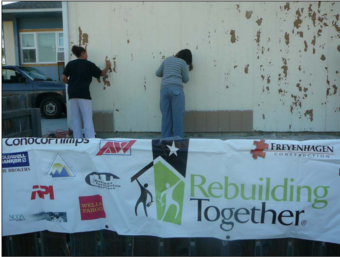
Rebuilding Together September 2009