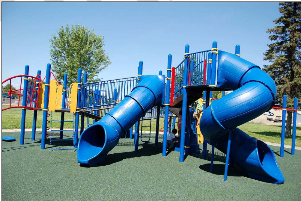
Central Park Playground