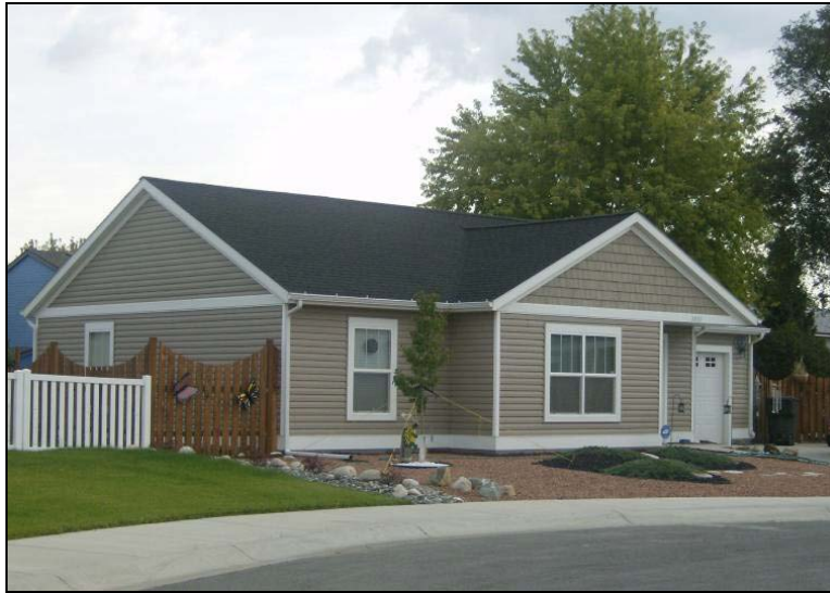
Kings Green Subdivision