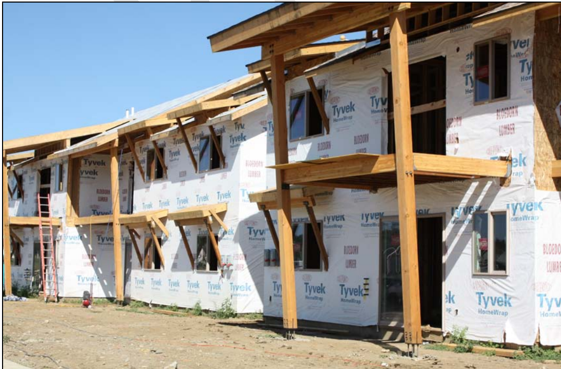
Whitetail Run - In Progress