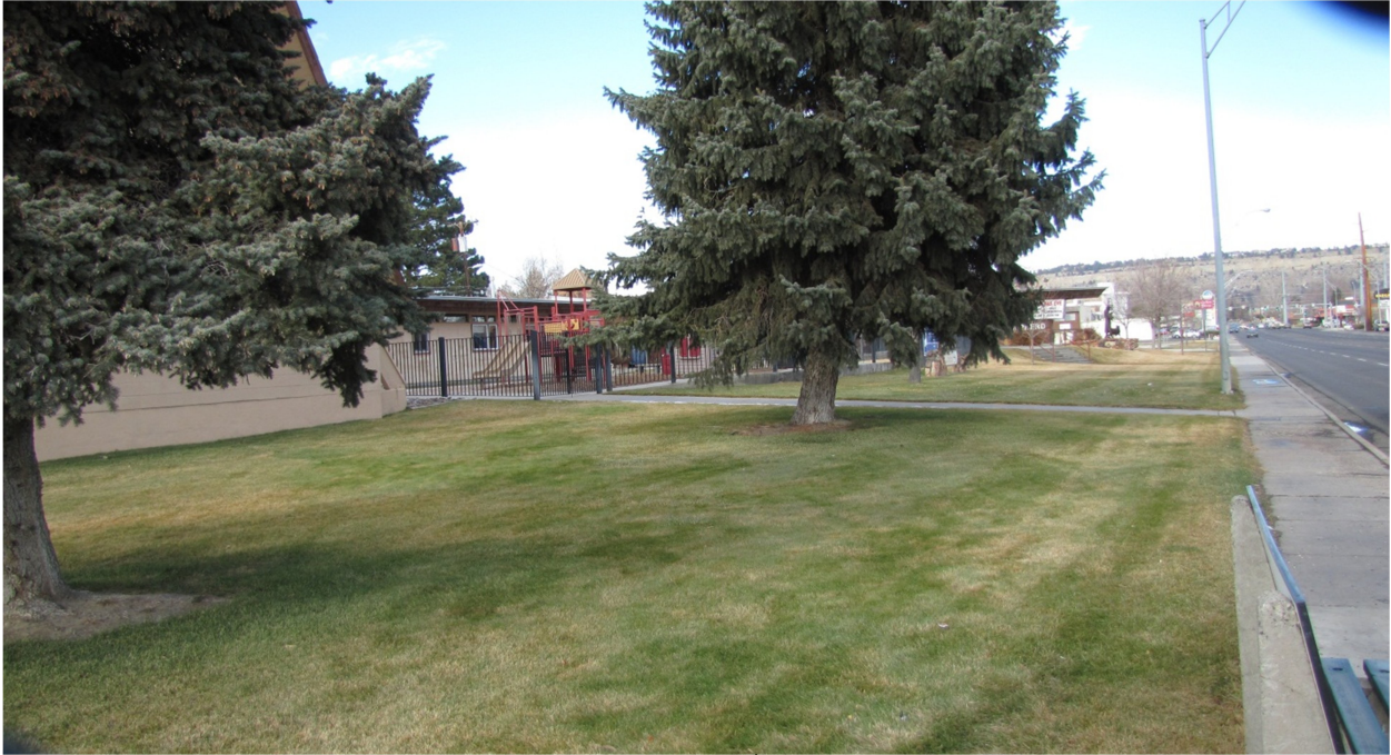
View north along 24 th Street West