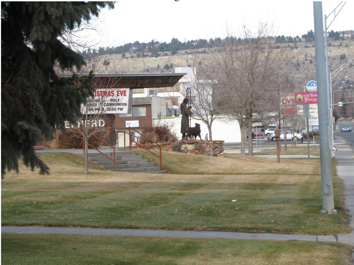
View north at existing church entrance on 24 th Street West