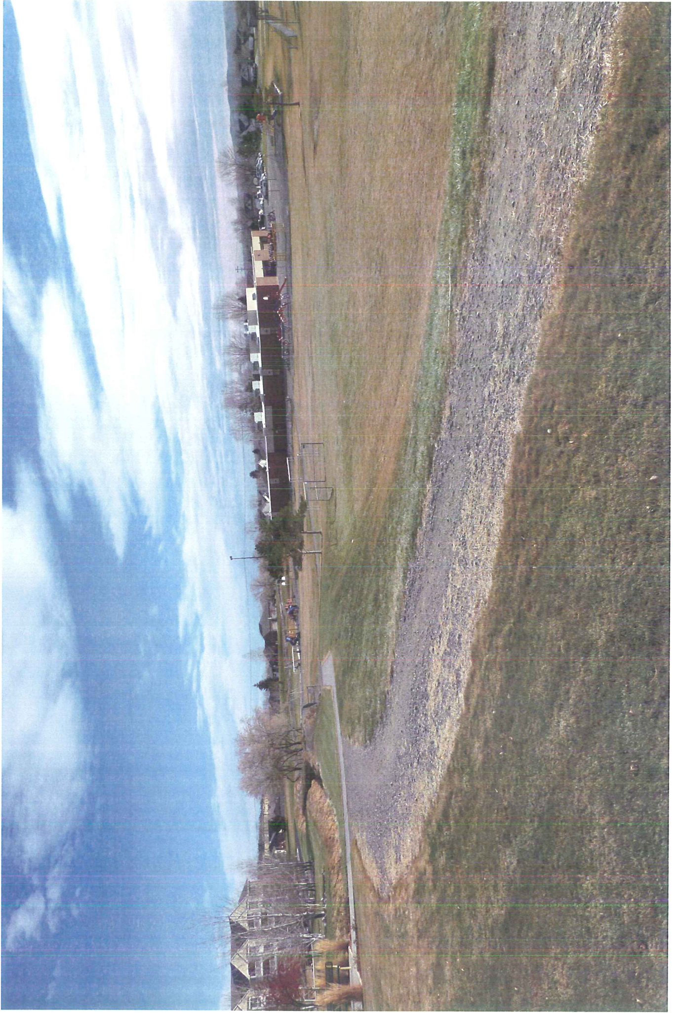
Continuing from St. John's to school,