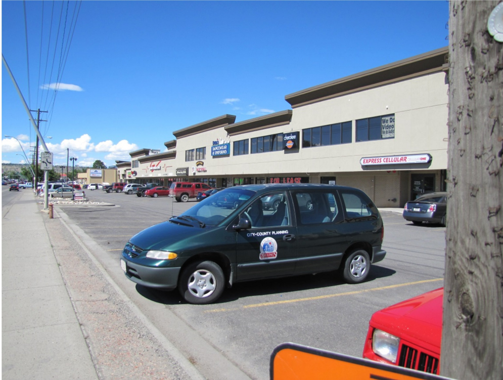
View north on S 24 th Street West