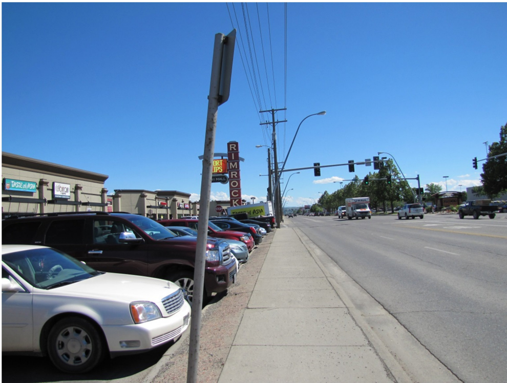
View south on S 24 th Street West