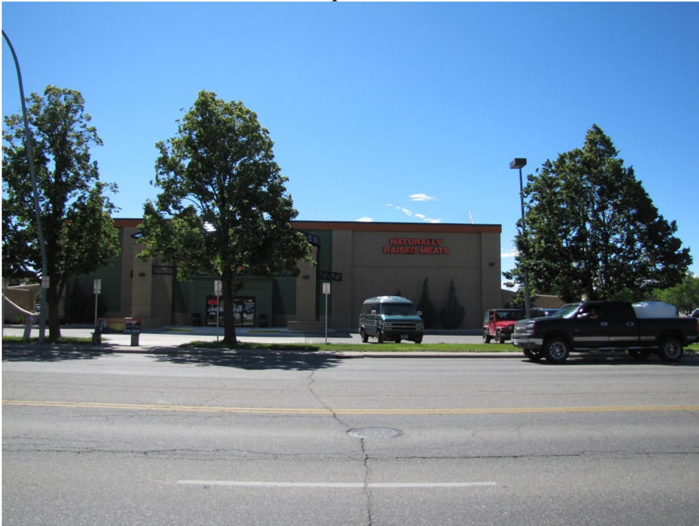
View west across S 24 th Street West