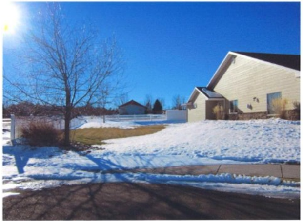
Looking SW from Lily Valley Circle