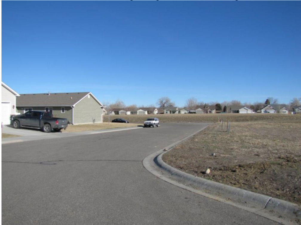
View north east along Lily Valley Circle