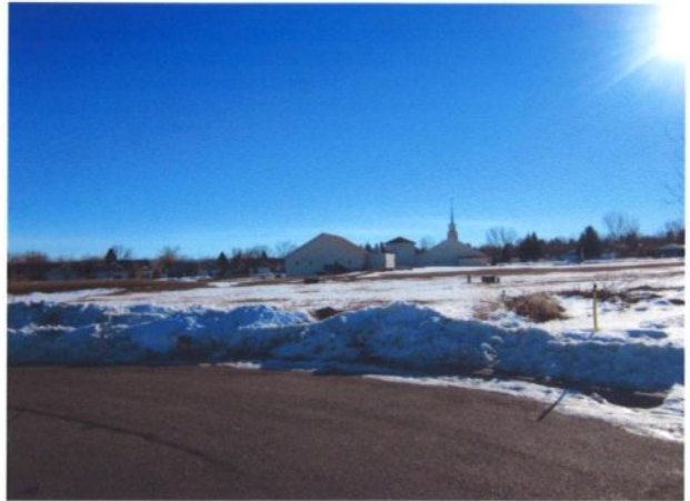
Looking ESE from Lily Valley Circle