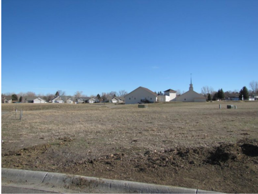
View east looking at Baptist Church Building