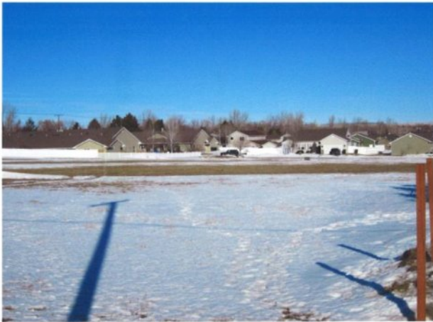
Looking NW from Hilltop toward Butterfly Homes