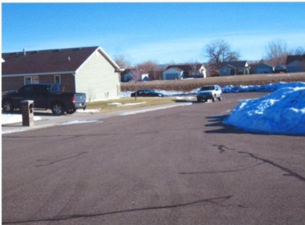
Looking E from Lily Valley Circle