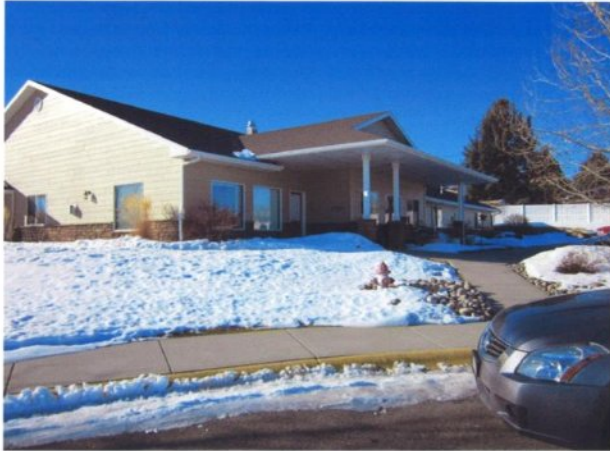
Looking WSW from Lily Circle at Butterfly Homes