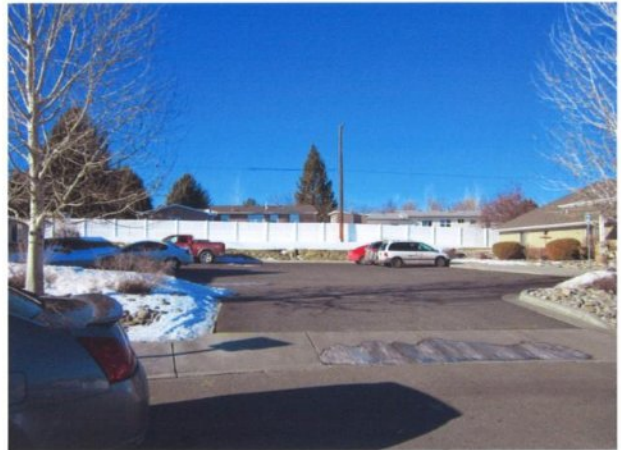
Looking W from Lily Valley Circle