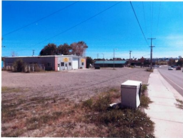
LOOK EAST FROM SOUTHWEST