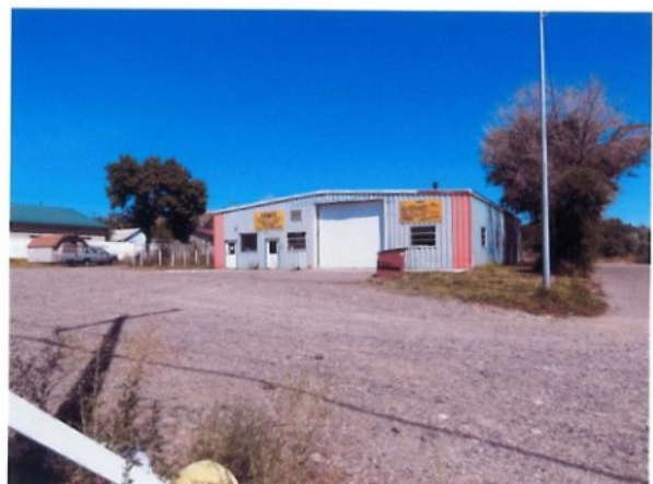
LOOKING NORTH FROM SE