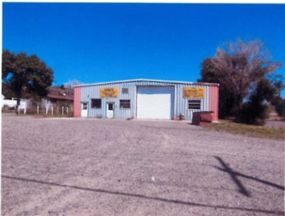
LOOKING FROM SOUTH