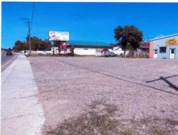
LOOKING WEST FROM SE