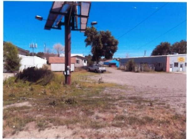
LOOK NORTH FROM SW