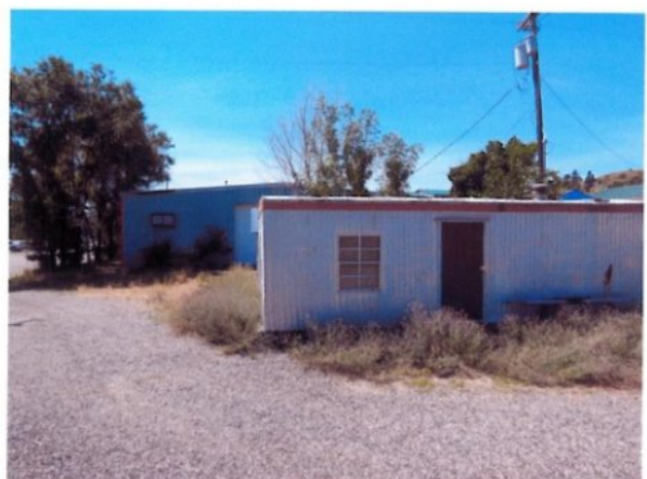
LOOKING S FROM N