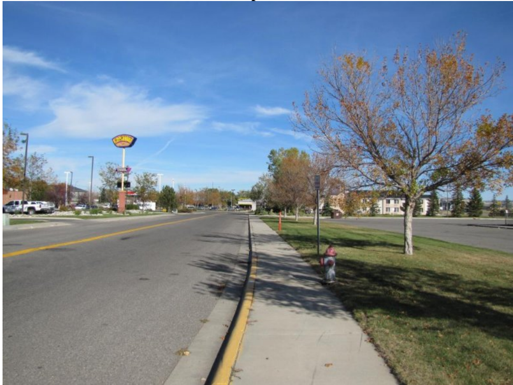
View east along Southgate Drive