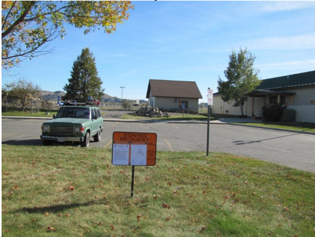
Subject Property – View south from Southgate Drive