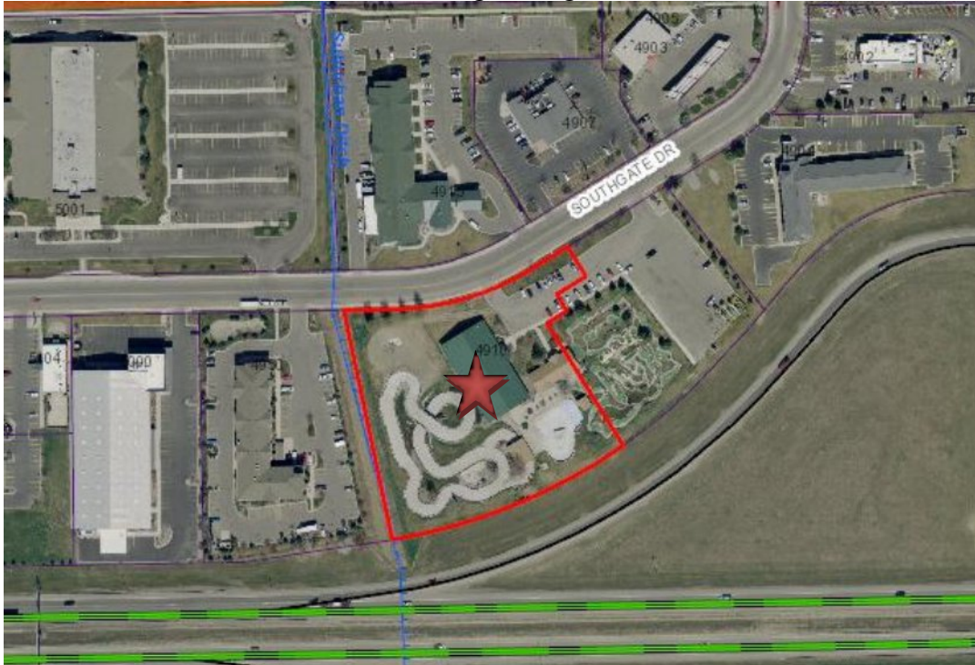
Subject Property ★