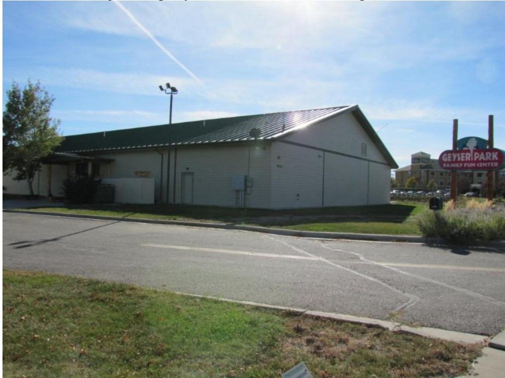
View west of subject property