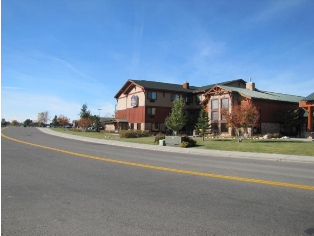
View west across Southgate Drive