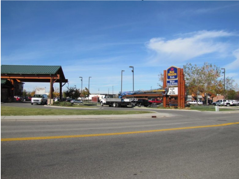
View north across Southgate Drive from subject property