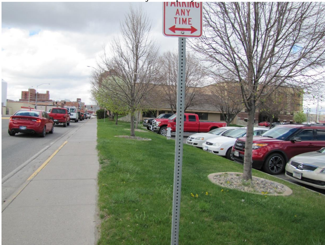
View north on S 27 th Street