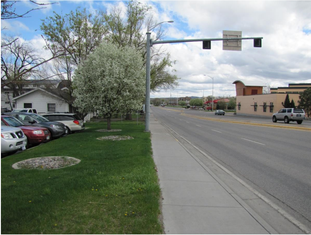
View south on S 27 th Street