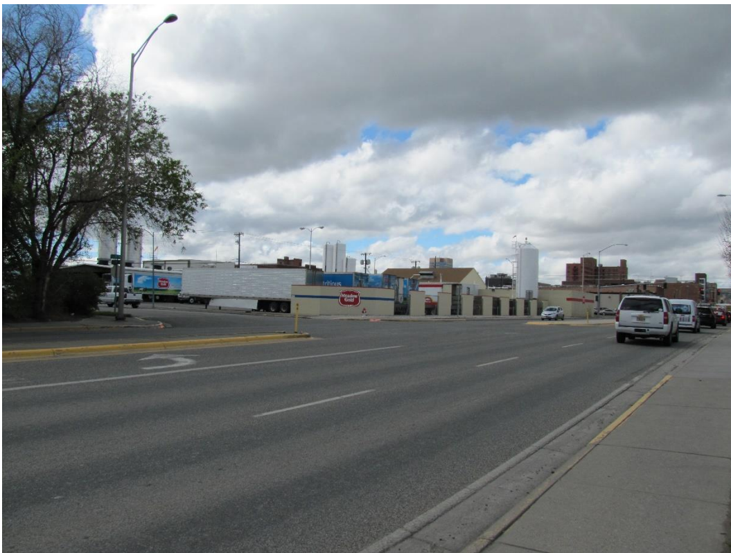
View north west across S 27 th Street