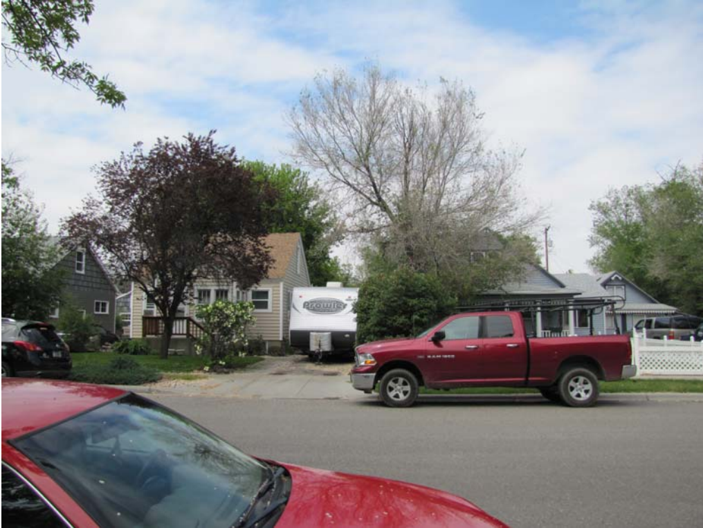
Looking across Miles Ave