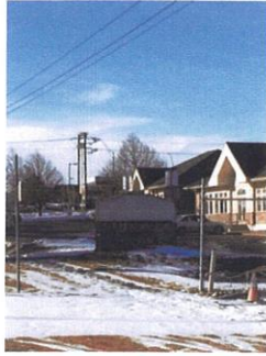
EXISTING MONUMENT SIGN