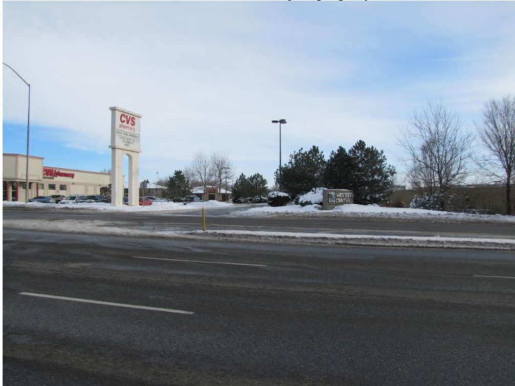
View east across Main Street from subject property