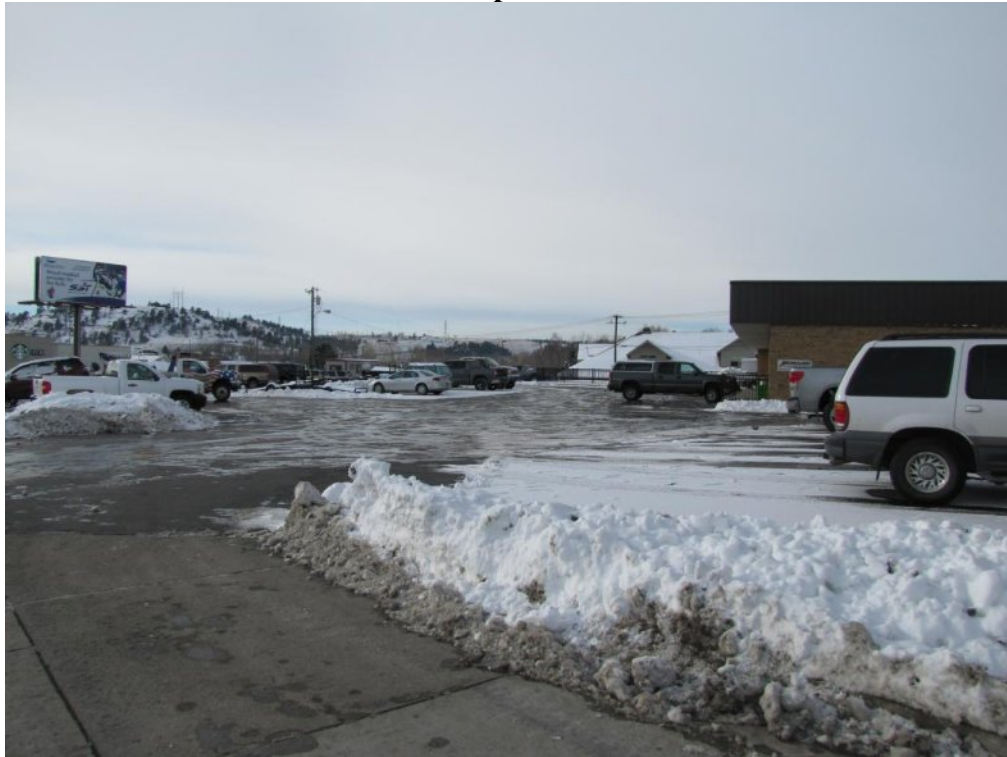
View west across subject property