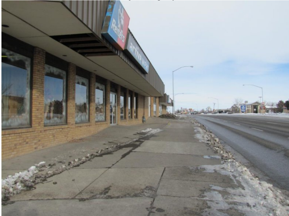
View looking north of subject property