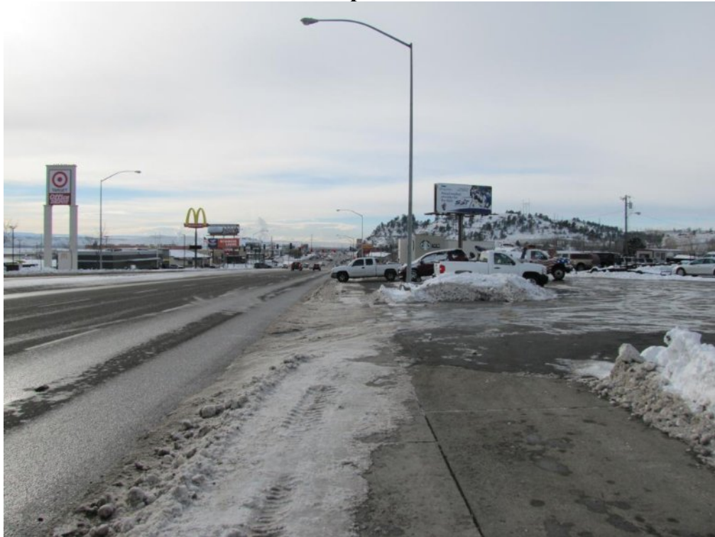
View south along Main Street