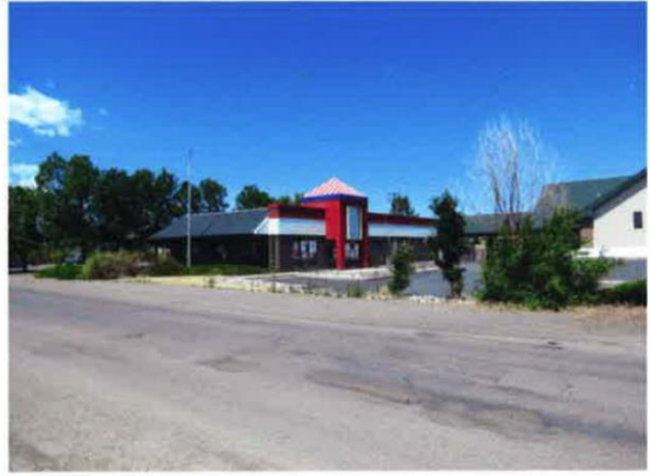
LOOK NORTHWEST FROM SE