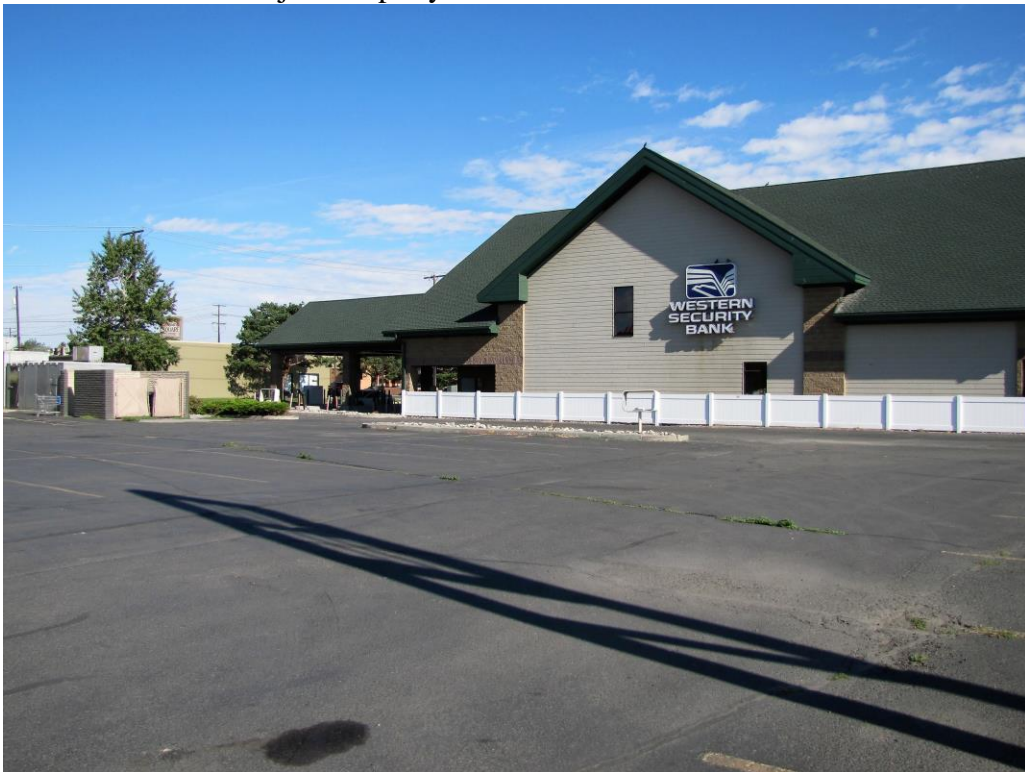
View north from subject property