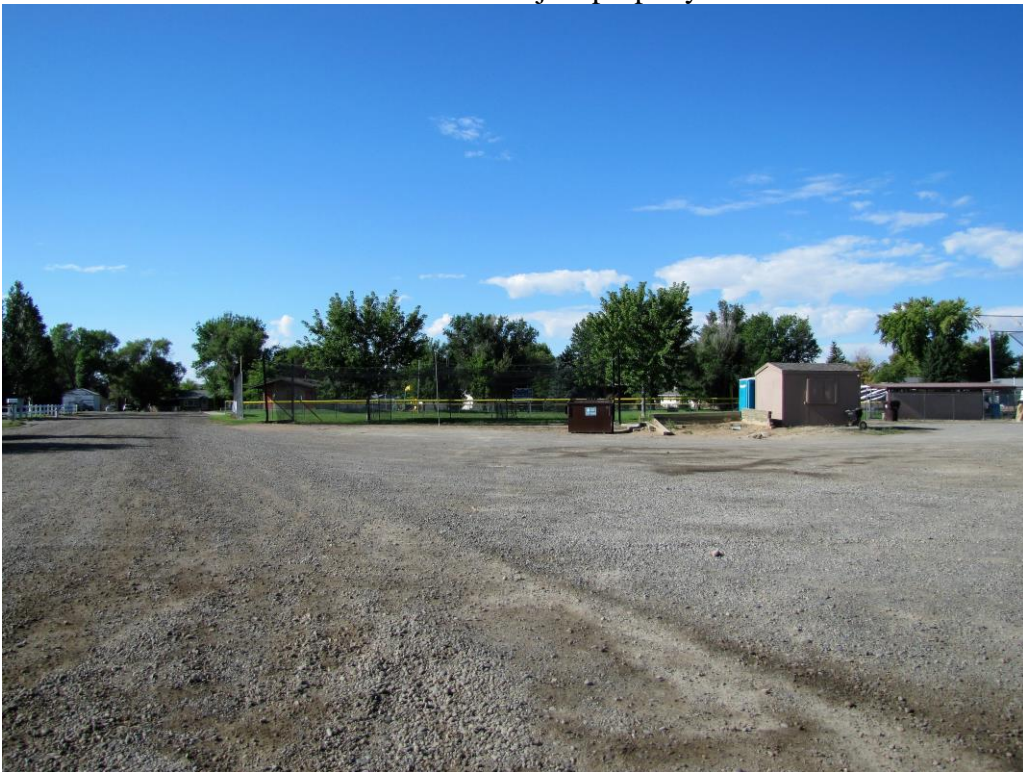
View of Arrowhead park from the intersection of Flathead Street and Crow Lane