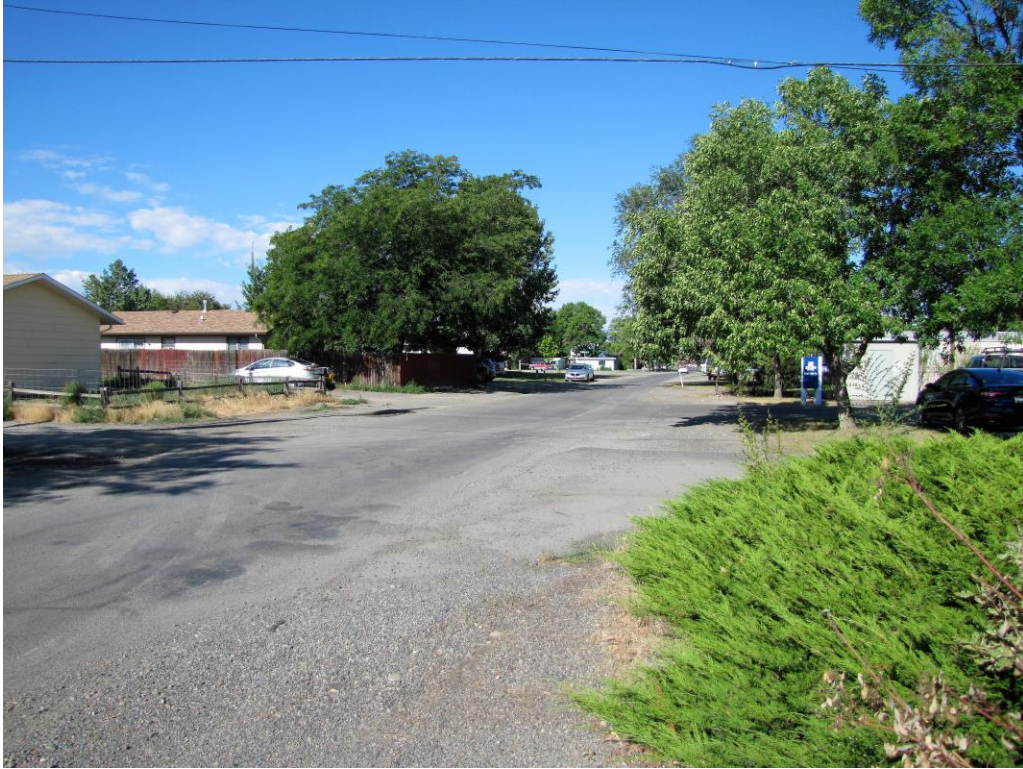
View from south west corner of subject property to Arrowhead Park