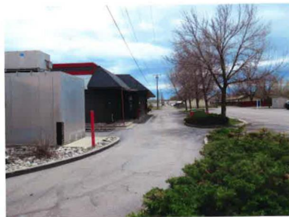
LOOKING SOUTH FROM NW