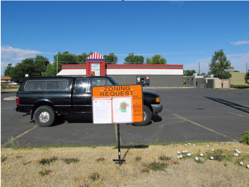
Subject Property – Viewed from Main Street