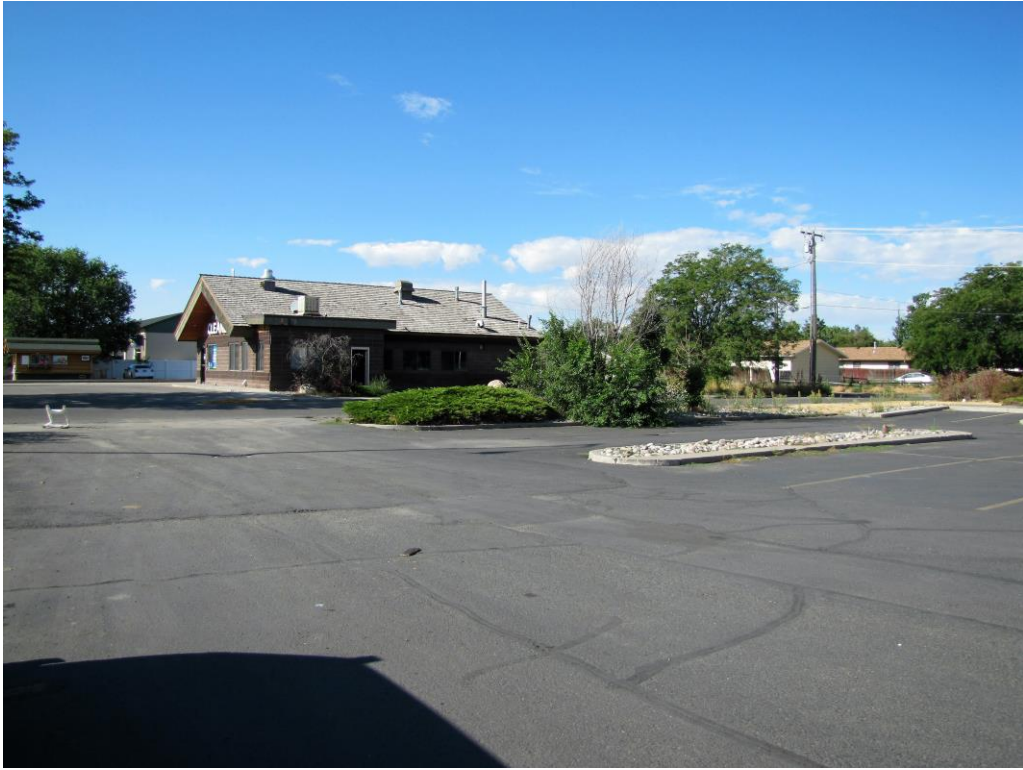
View south from subject property