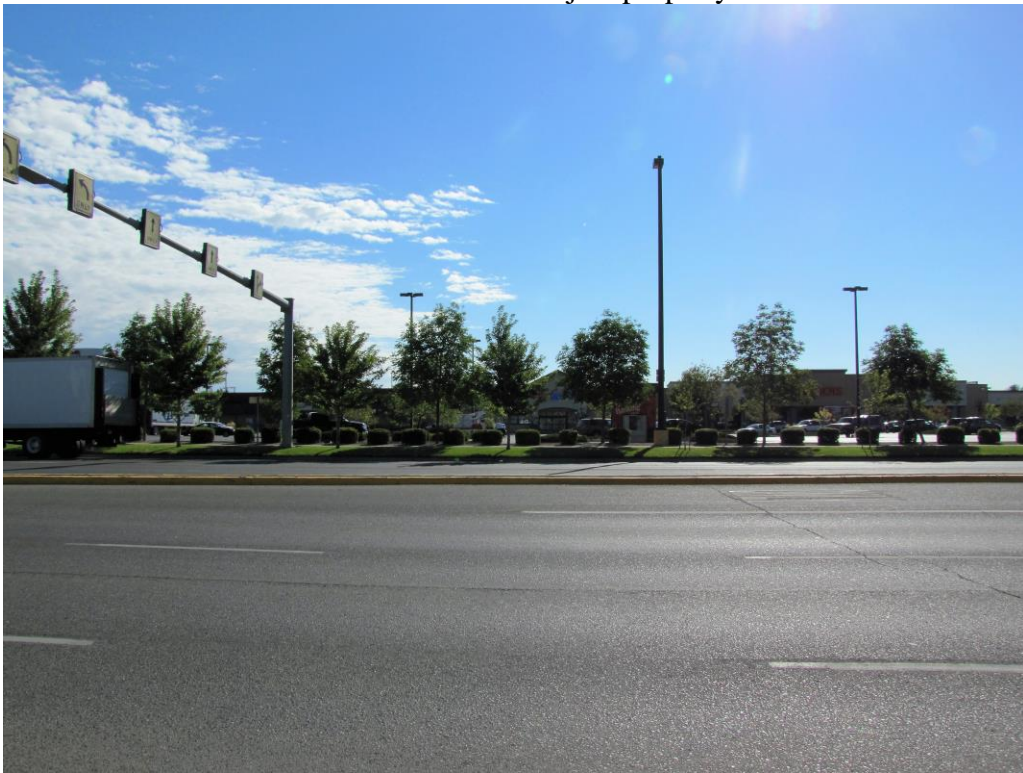
View west across Main Street from subject property