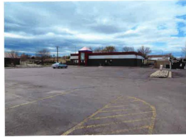
LOOKING SW FROM NE