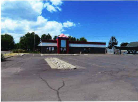
LOOK WEST FROM EAST