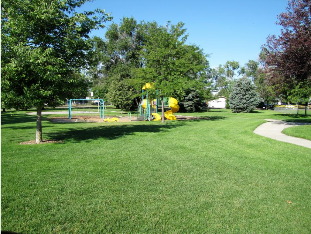
Picture of play structure on the south end of Arrowhead Park