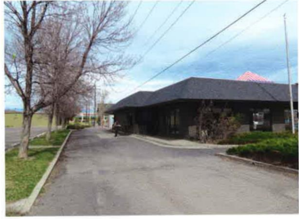
LOOKING NORTH FROM SW