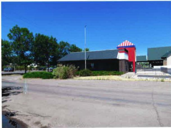
LOOKING FROM SOUTH