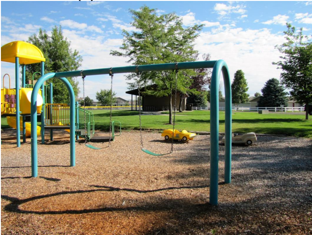
View north from play structure in Arrowhead park in the direction of proposed casino.