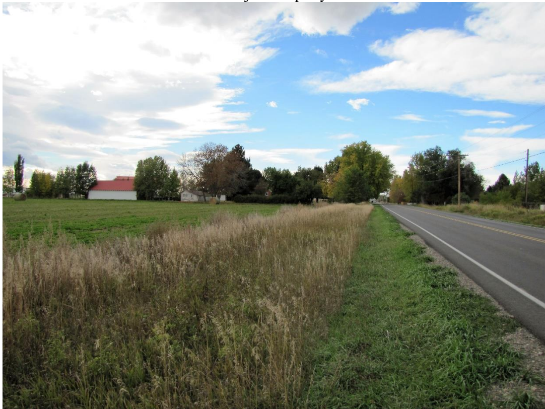
View west along Central Avenue