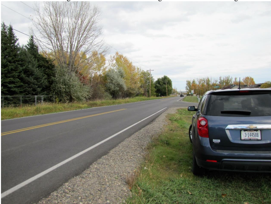
View east along Central Avenue