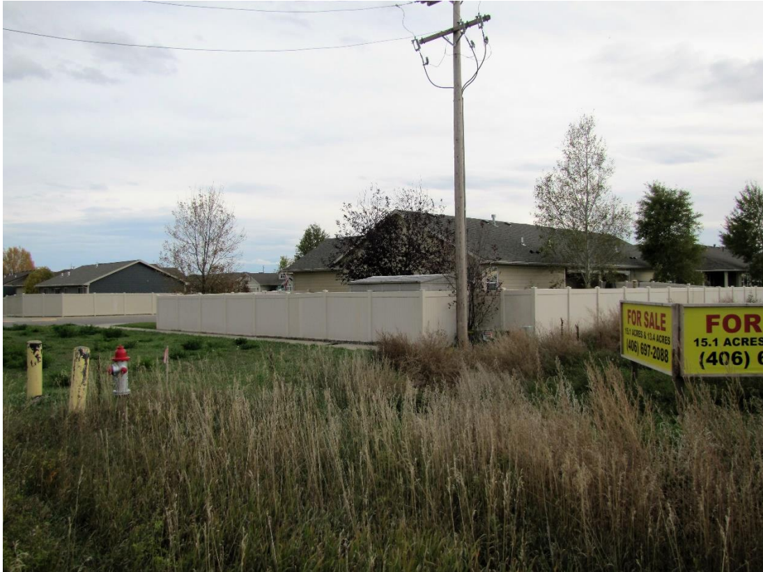
View of Legends West Subdivision along Central Avenue frontage