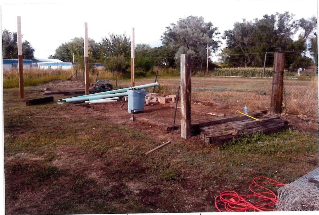
Shed taken down replacement garage