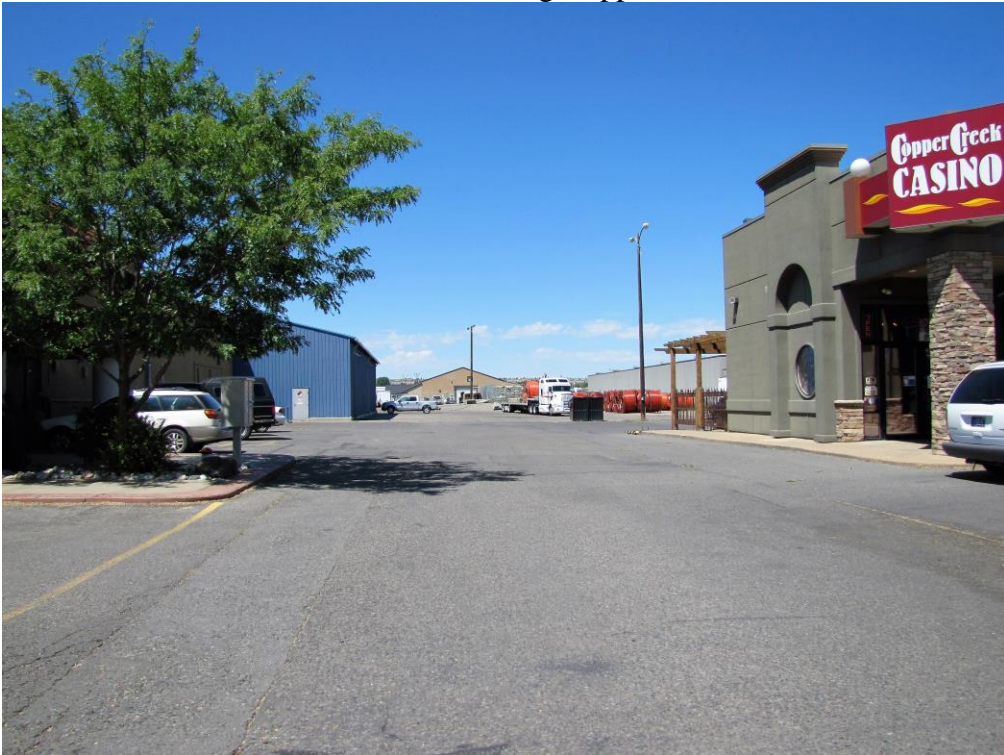
View North between existing casino and church looking at CEI Electrical building.