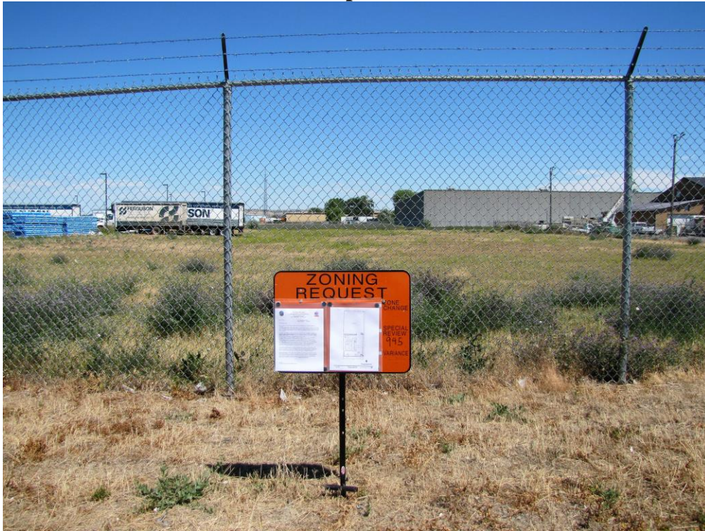
Subject Property – Viewed from South 18 th Street West