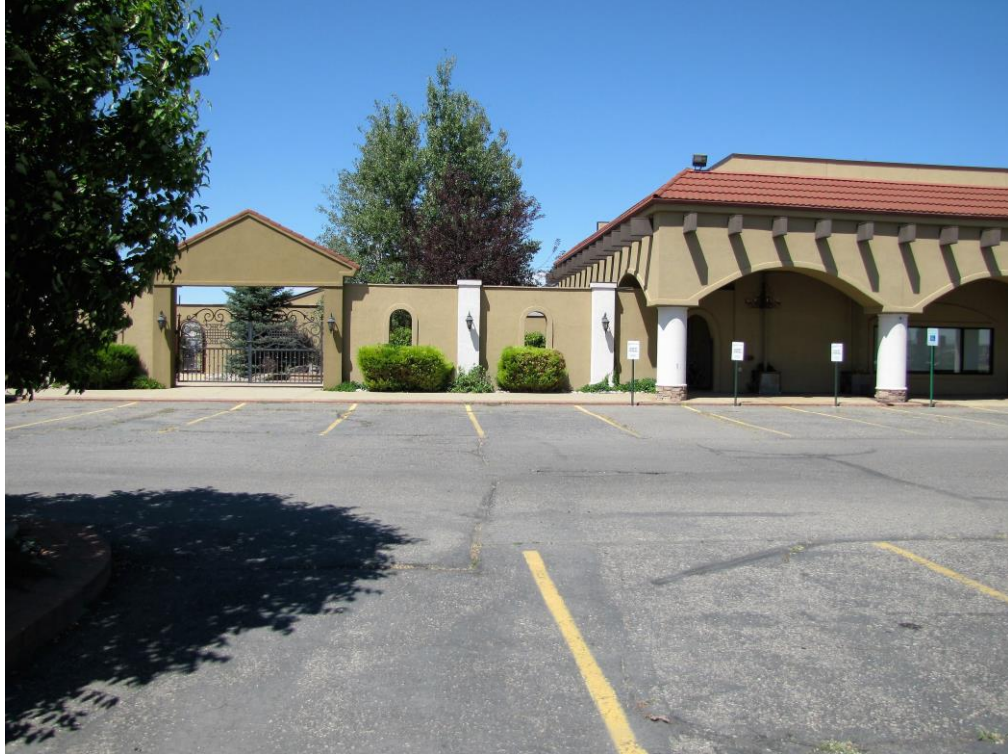
View north from parking lot of Church