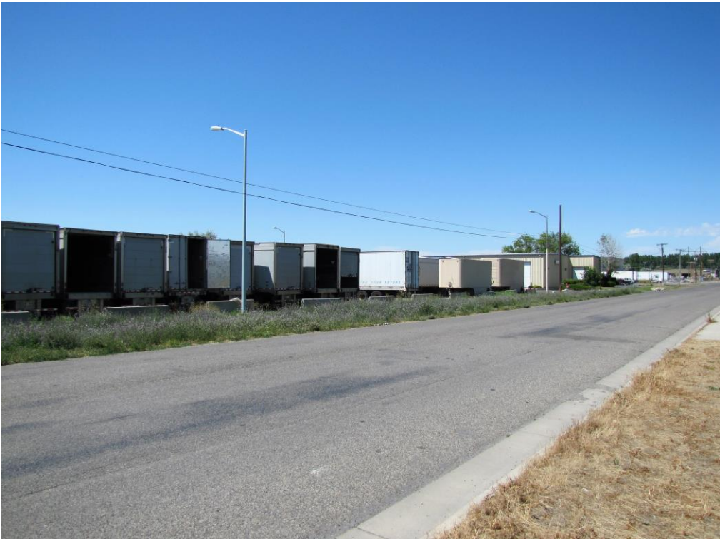
View across South 18 th Street West looking north west from subject property