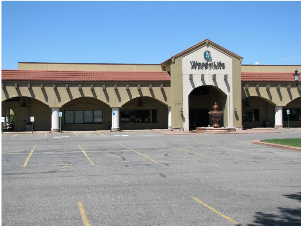
View North from Church parking lot