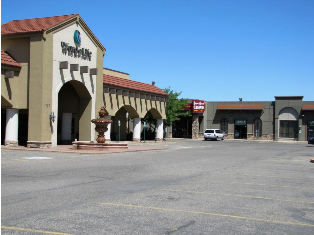
Picture of church and existing Copper Creek Casino