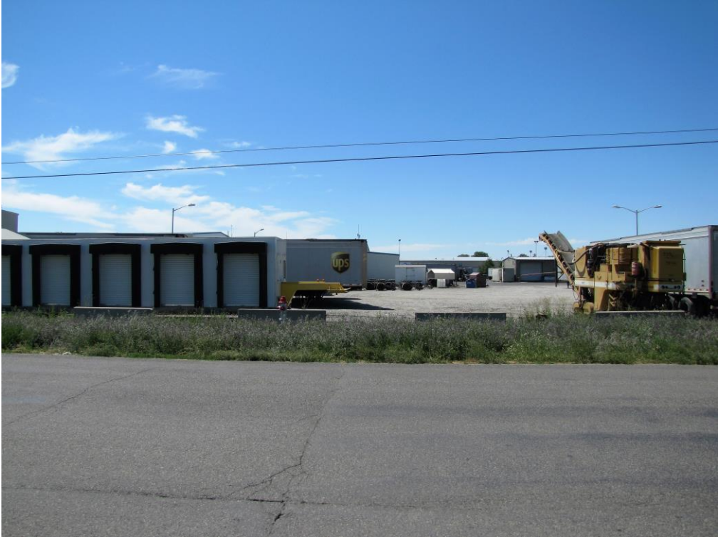
View west across South 18 th Street West