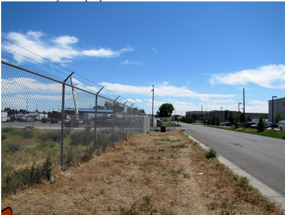
View south from subject property toward King Avenue West