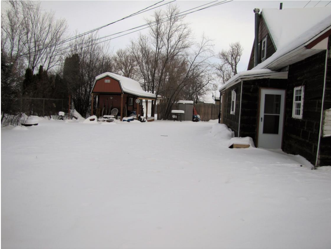
Looking East (toward the property from the street frontage)