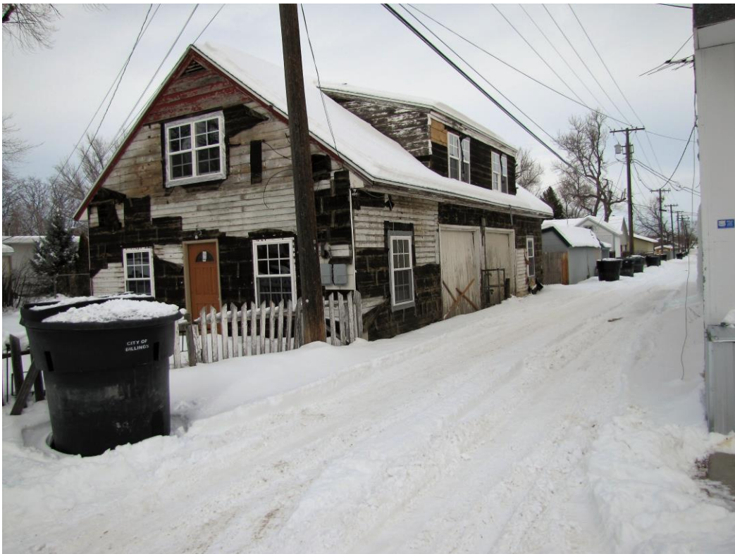
Looking East down the alley