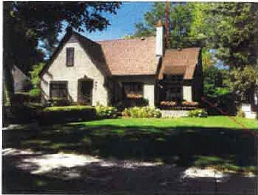
PROPOSED ADDITION - RENDERING