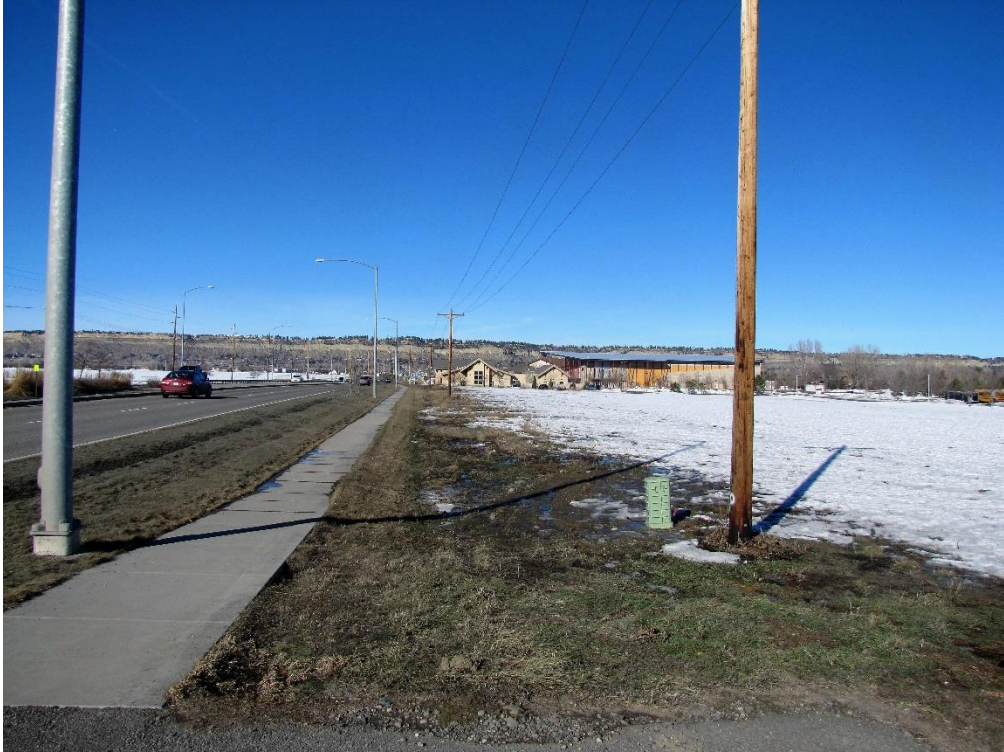
View north along Shiloh Road towards Faith Chapel