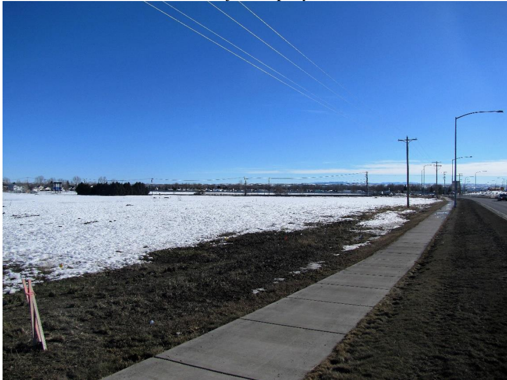
View south along Shiloh Road to Central Ave round-about