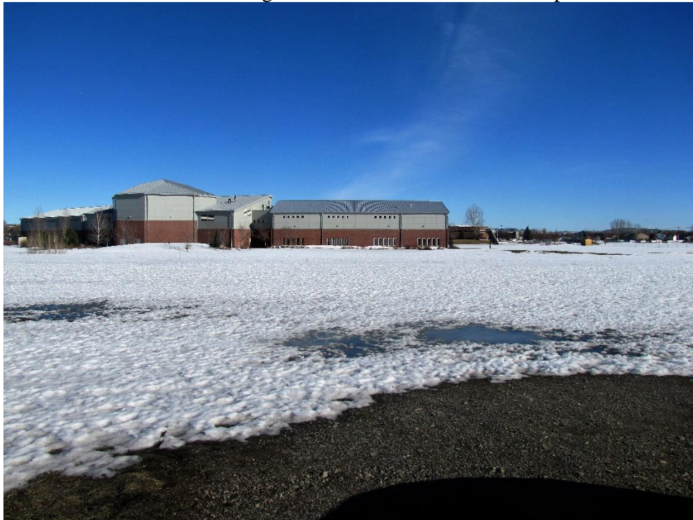
View east to Health Sciences Building @ MSUB