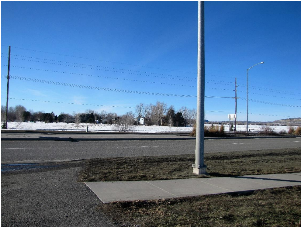
View north west across Shiloh Road