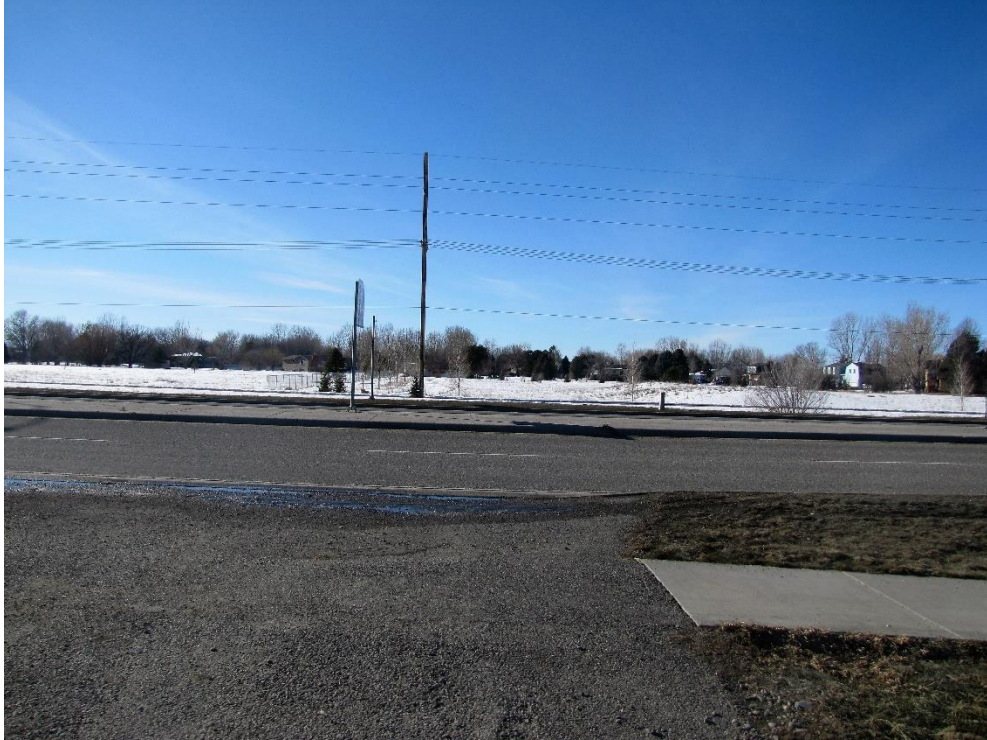
View west across Shiloh Road