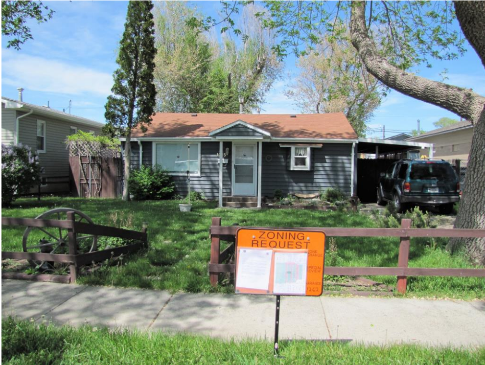
Subject Property- facing North