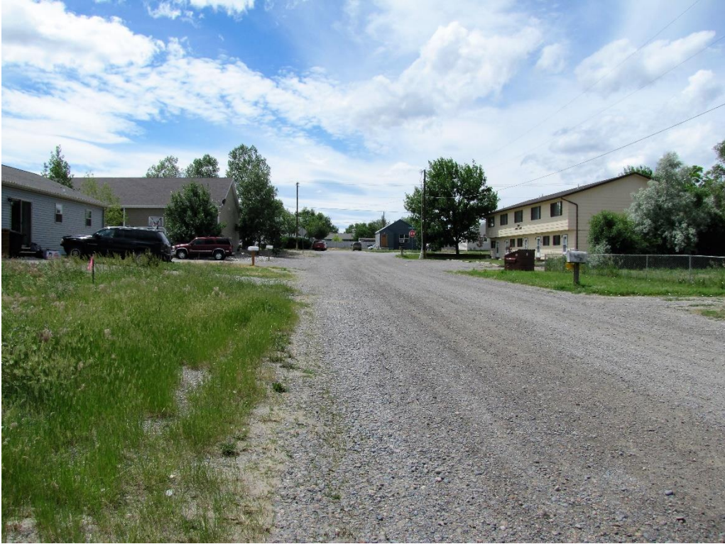
View west along Roxy Lane