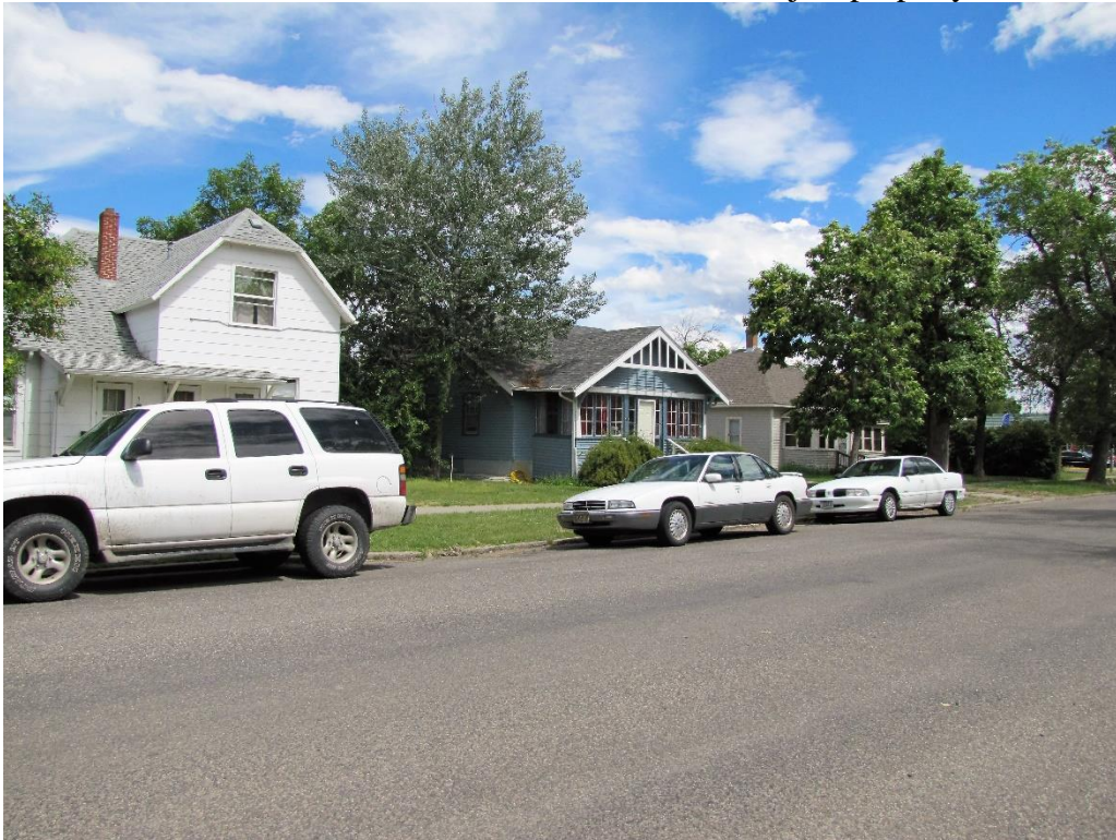
View south east across N 25 th St. from subject property