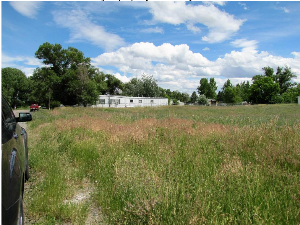
View east along Roxy Lane