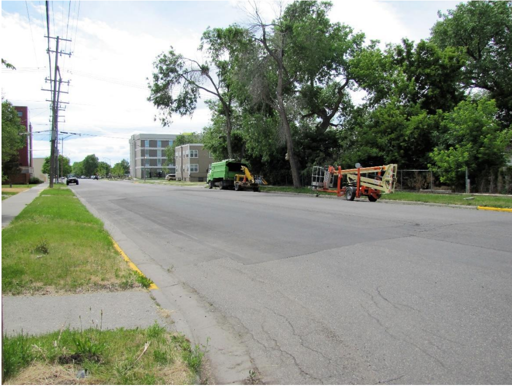
View west from the corner of 7 th Ave. N and N 25 th St.