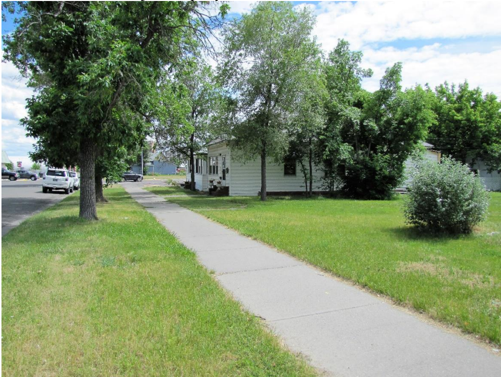
View east from N 25 th Street looking south