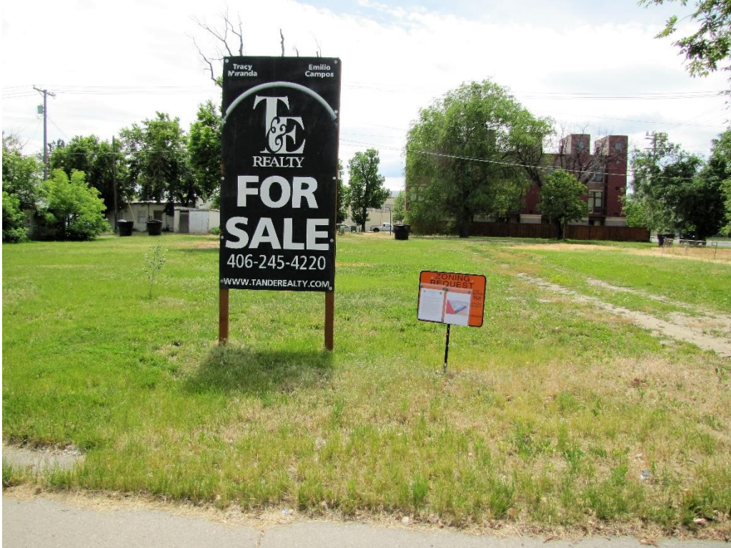
Subject Property – view from N 25 th Street