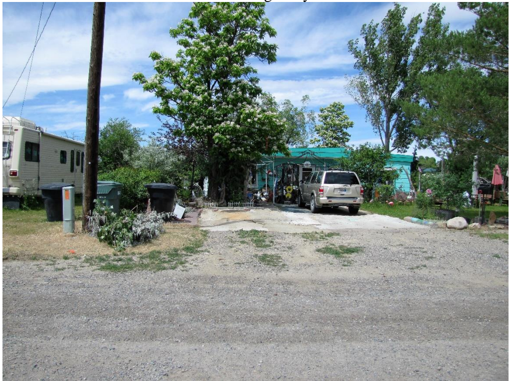
View north across Roxy Lane