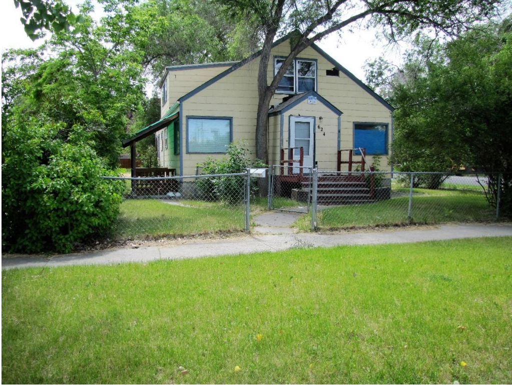
View of house on the north east corner of subject property