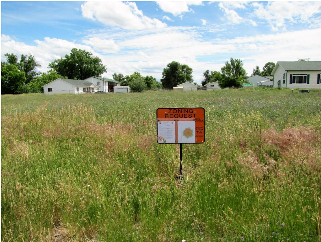
Subject property from Roxy Lane