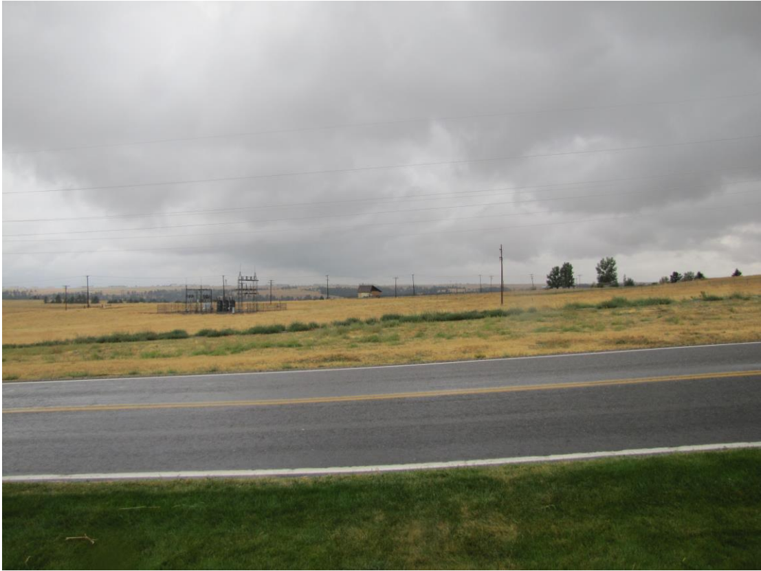
West (across Wicks)