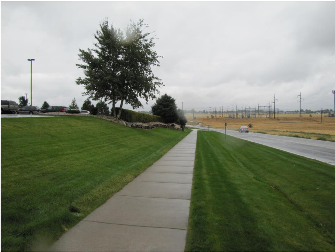
Facing Southeast (Wicks Lane)