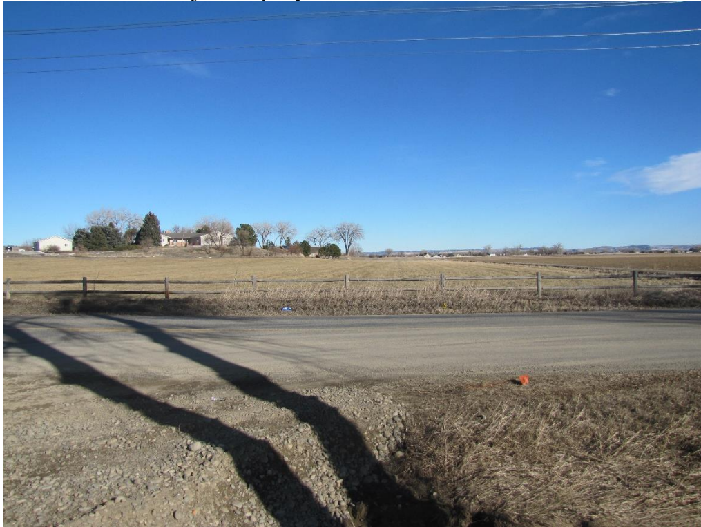
View east across 64 th St West