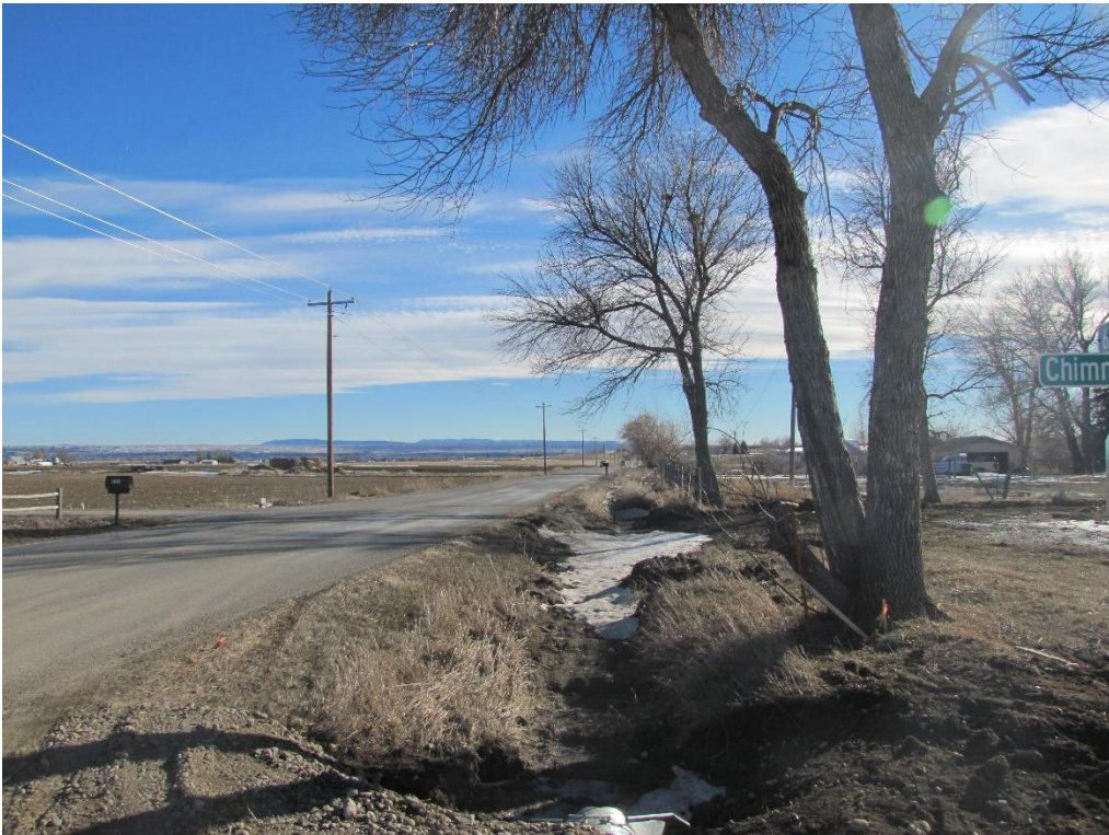
View south east