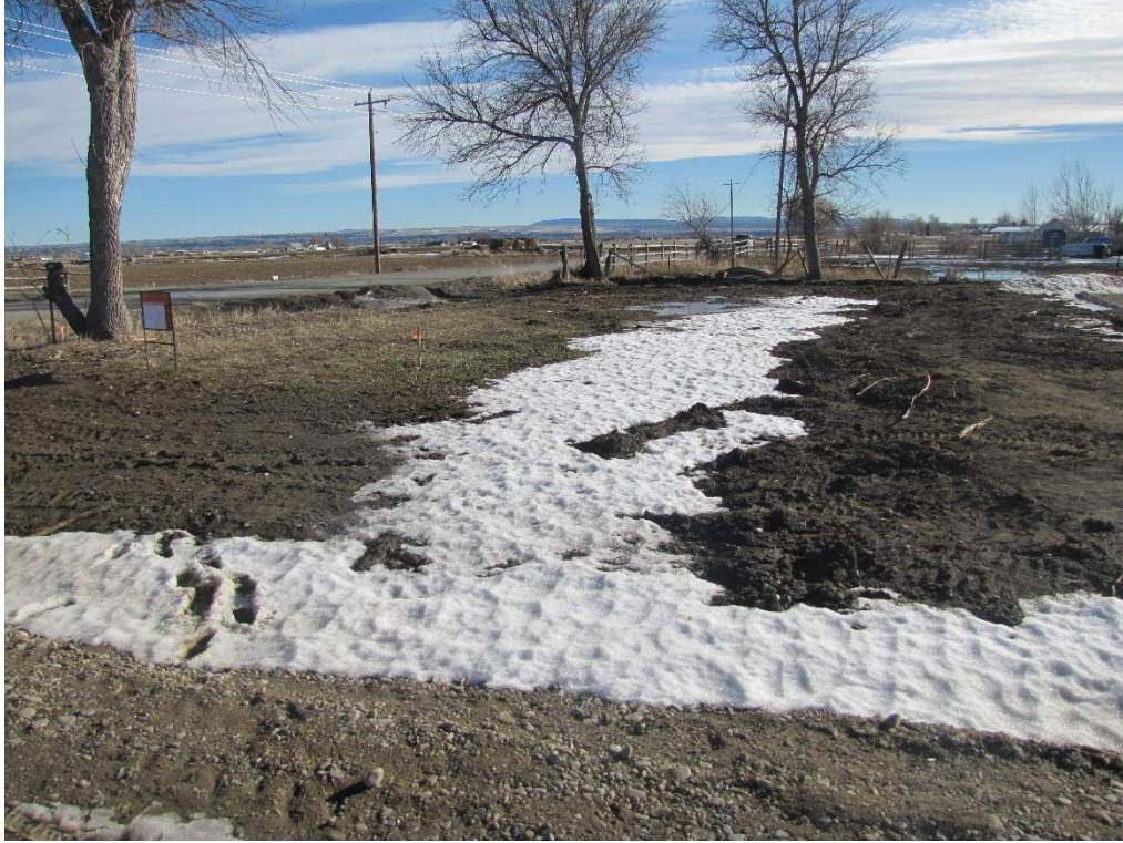
Common Facilities lot – view south