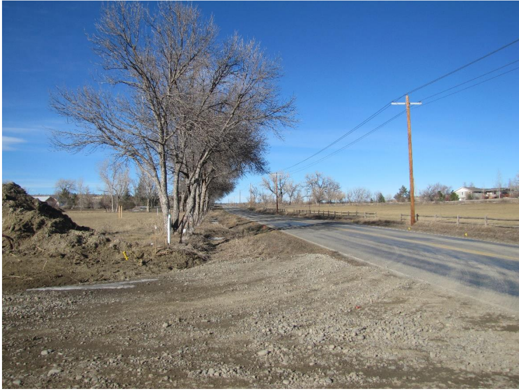
View north east