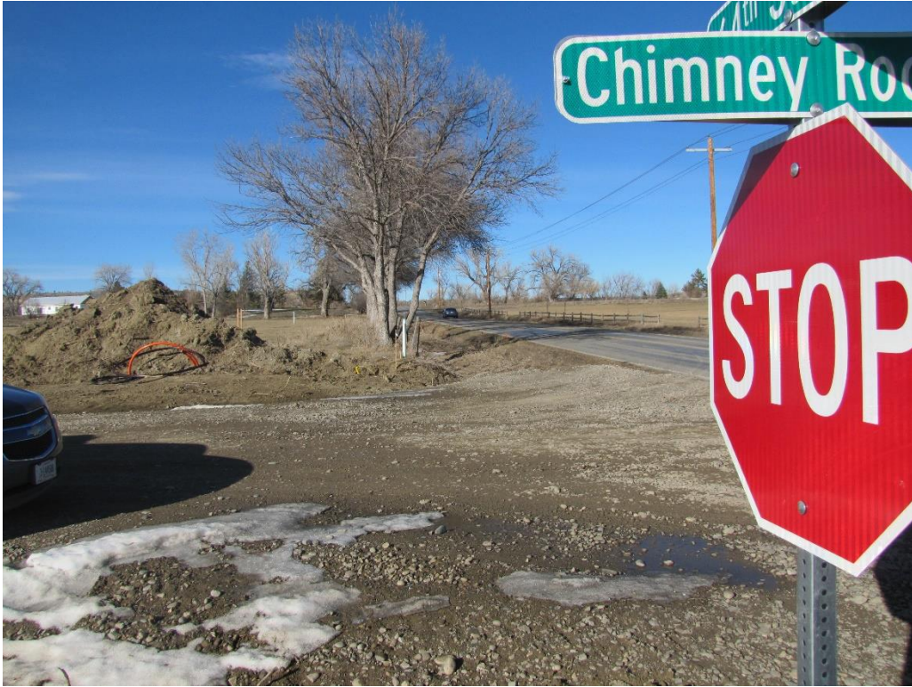
Subject Property – at new street intersection