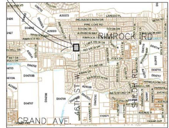
VICINITY MAP: NOT TO SCALE

Boyer Land LLC 2810 Central Ave. Billings, MT 59102 Lot 2, Bk 5 Silver Creek Estates Subdivision