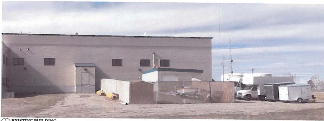
1 EXISTING BUILDING PB-7 LOOKING SOUTHWEST SCALE: 1/4" = 1'-0"