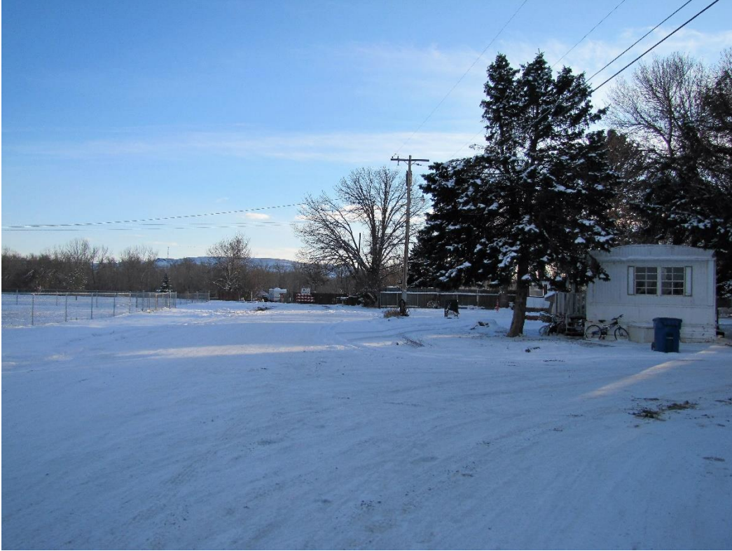
View south to the dead end of Mallowney Lane