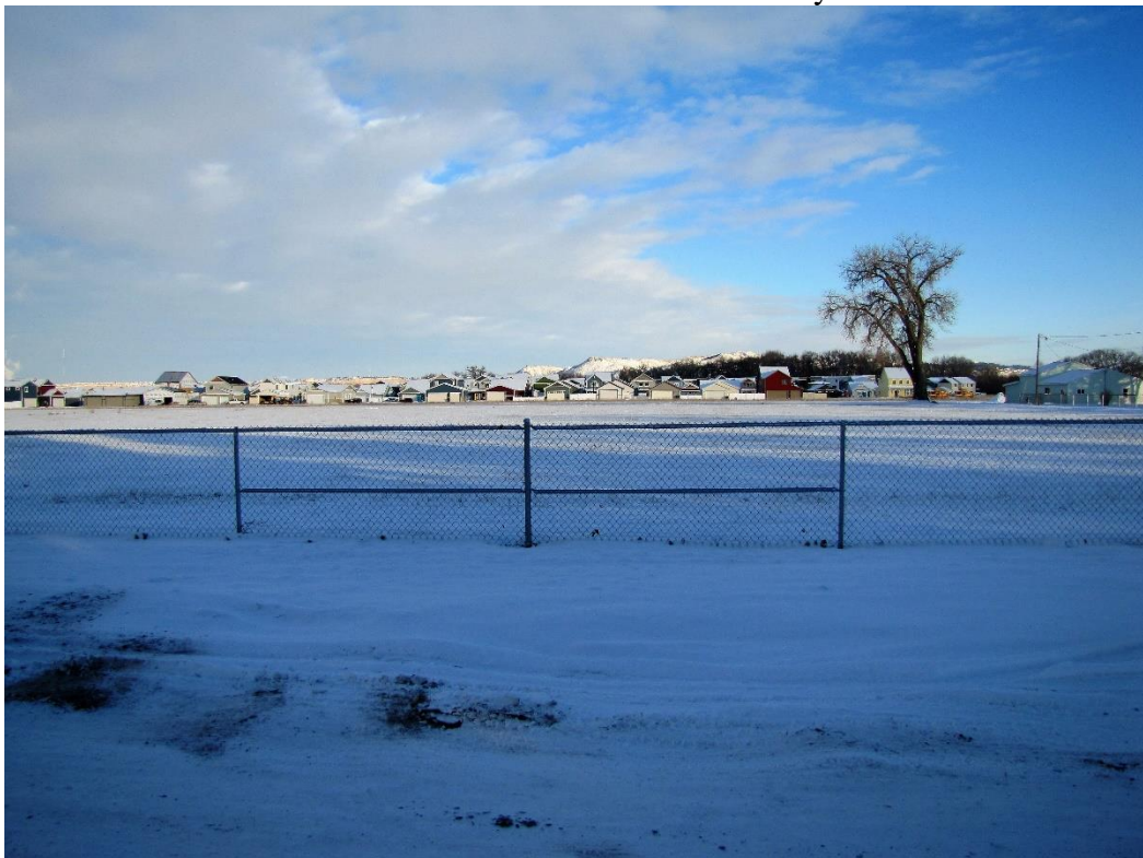
View east across Holy Cross Cemetery to Josephine Crossing neighborhood