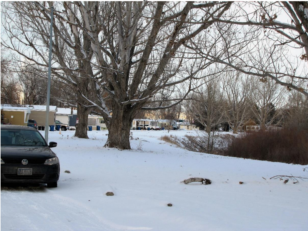
View east along internal access road