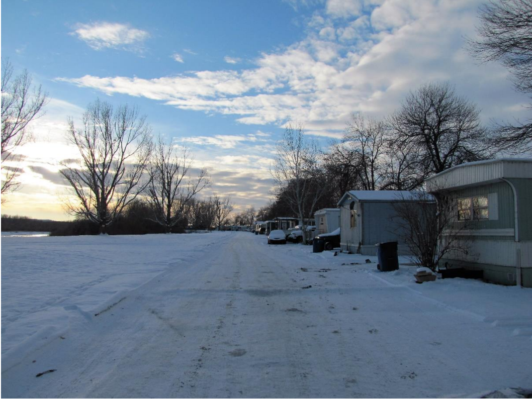
View west along internal access road