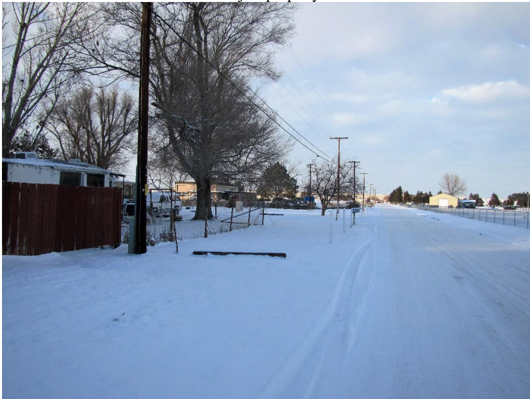
View north on Mallowney Lane