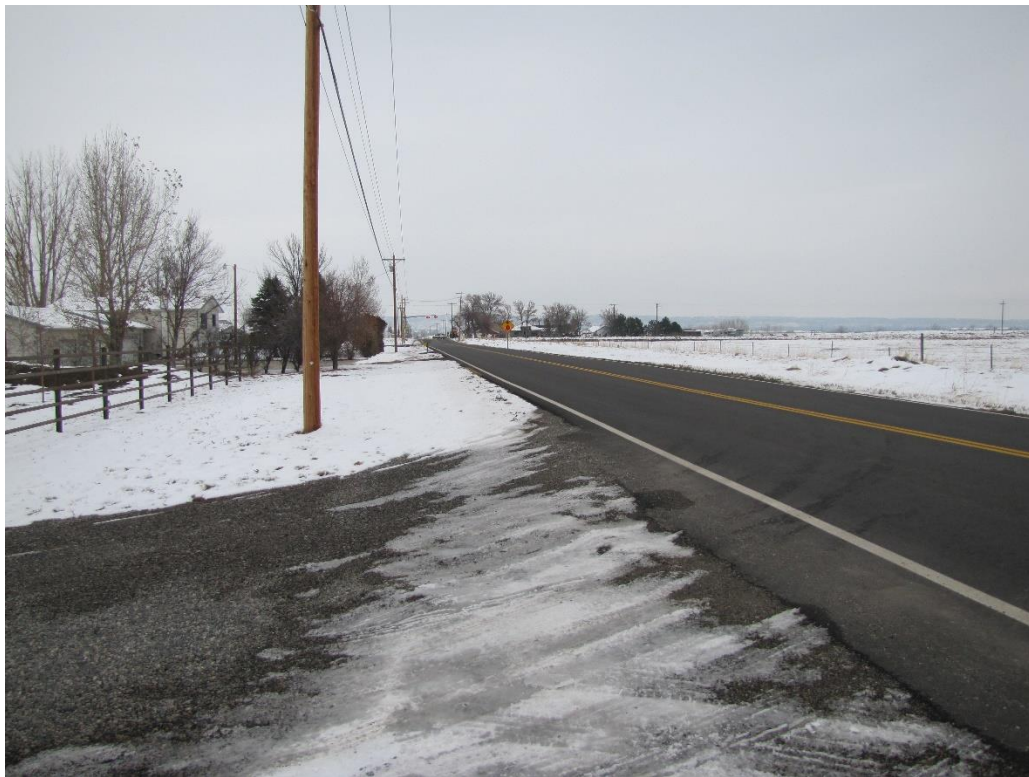
View north along S 48 th St West