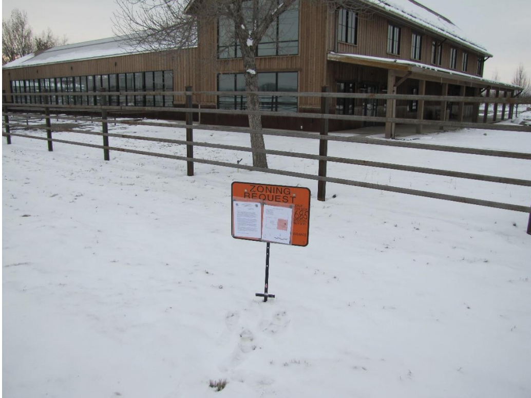
Subject property from S 48 th Street West – Greenhouse & Office building