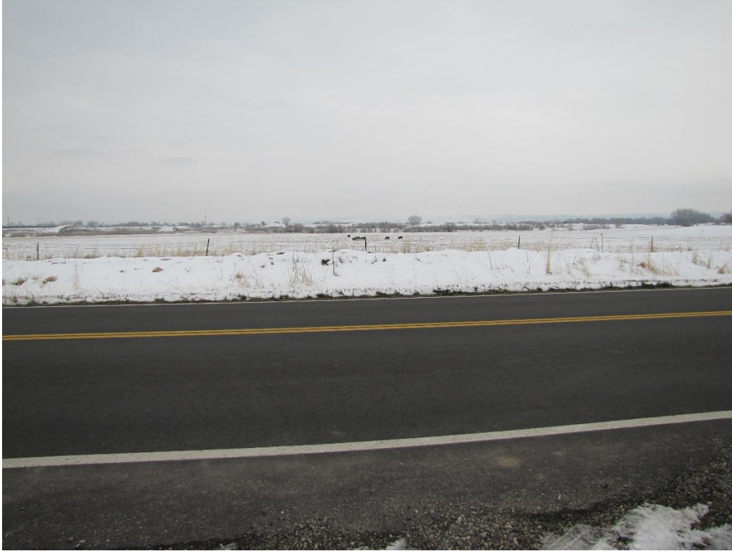
View east across S 48 th St West