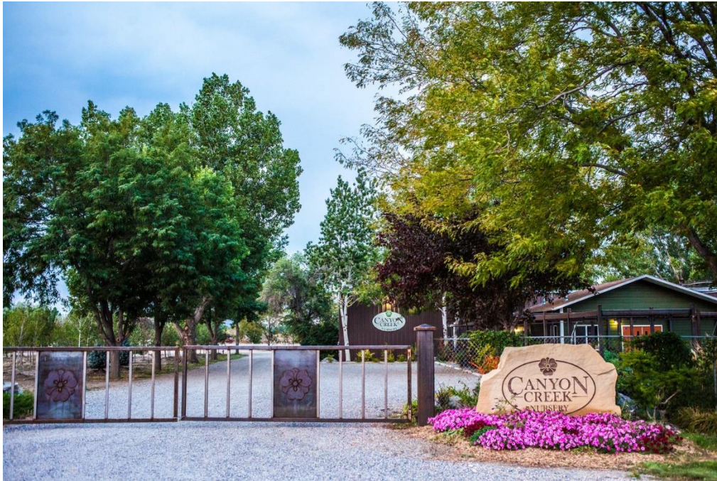
Nursery main entrance further south on S 48 th St West