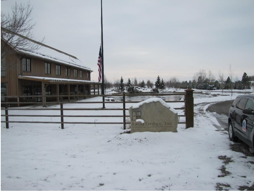
North entrance road