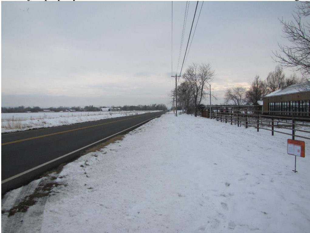
View south along S 48 th St West