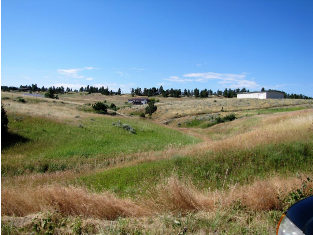
Looking west across subject property farther south along Old Hardin Road