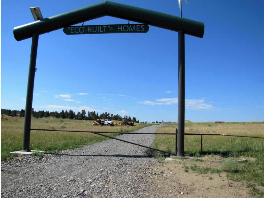
Entry off of Old Hardin Road