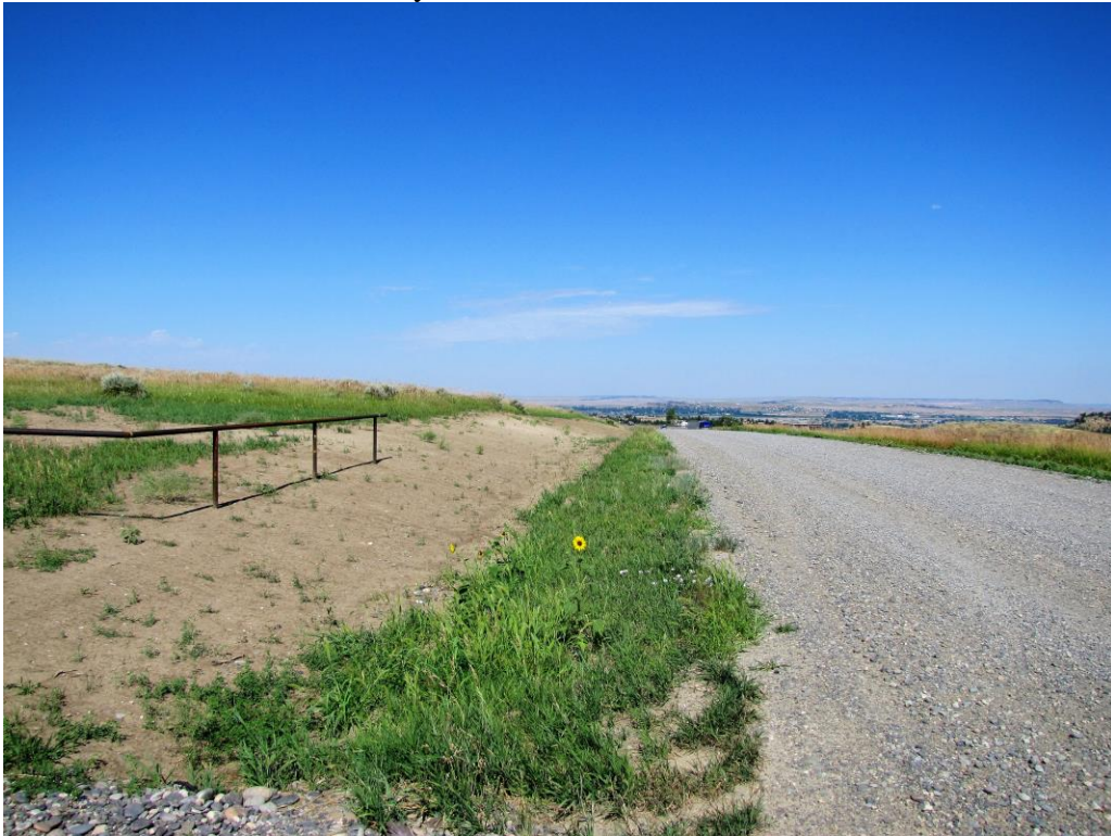
Looking North from Eco Built Entry Gate