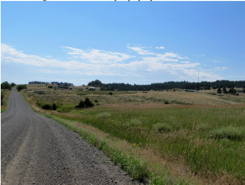
Looking south across subject property farther south on Old Hardin Road