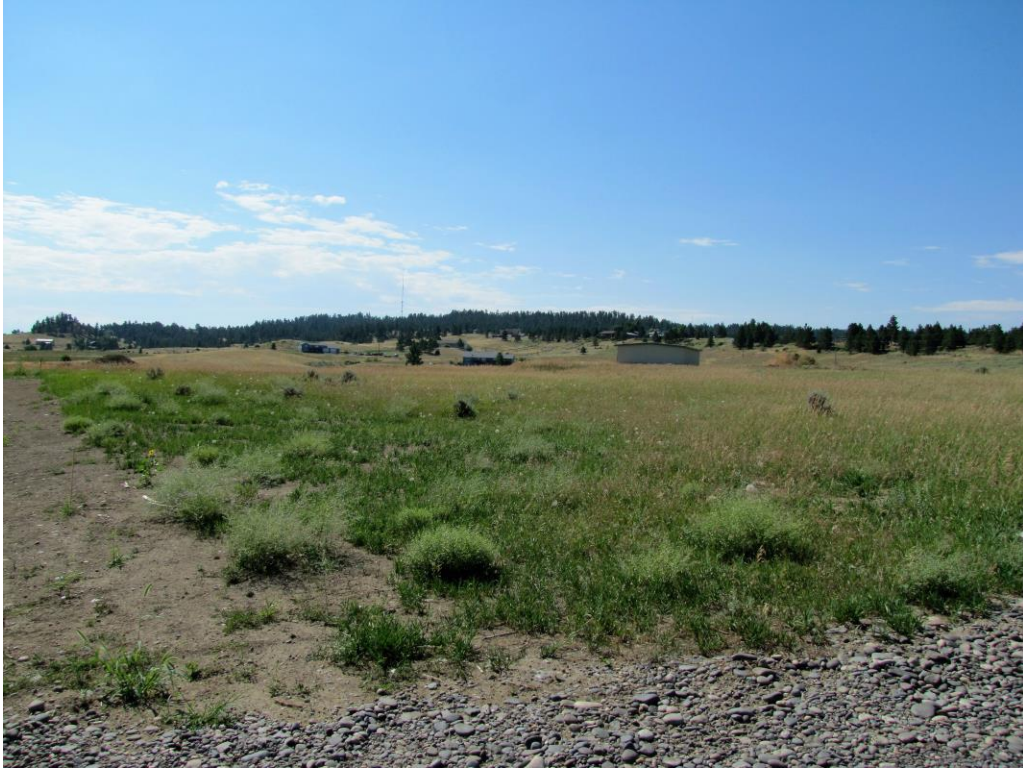
Looking south west across subject property from Old Hardin Road