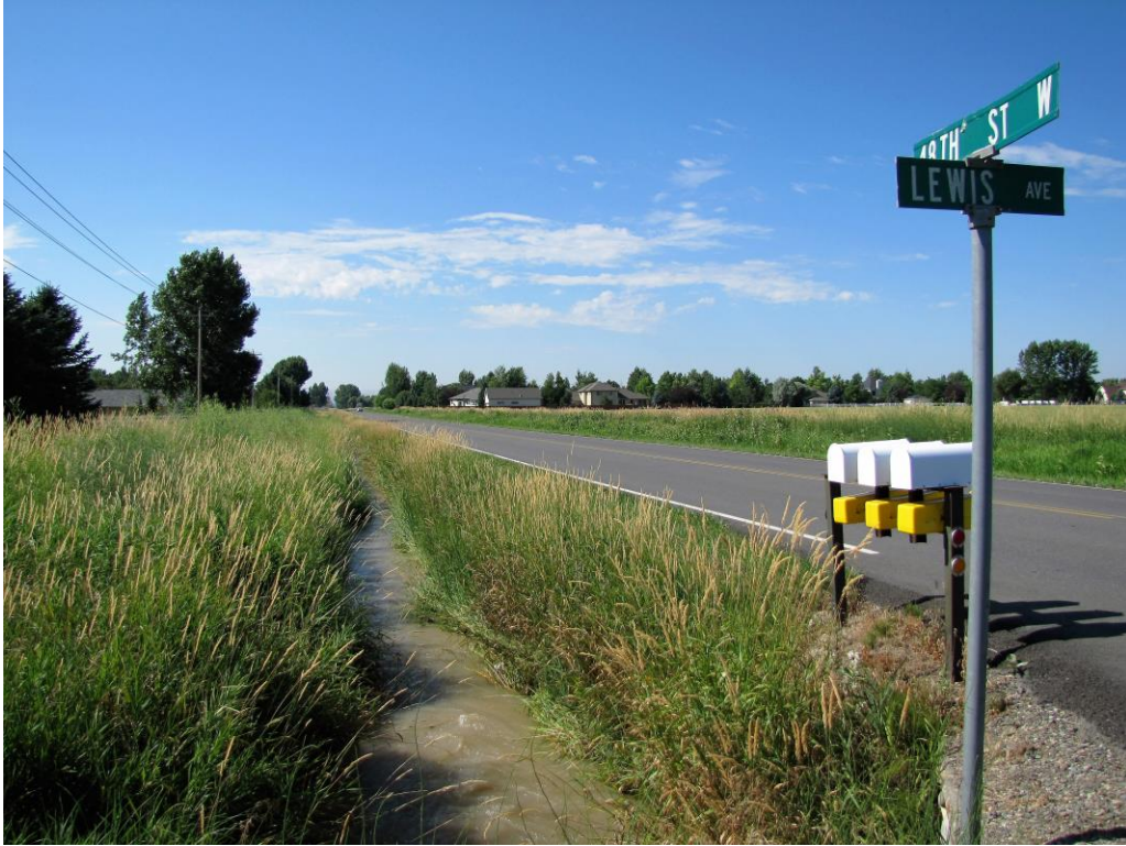
Lewis Avenue looking south along 48 th Street West