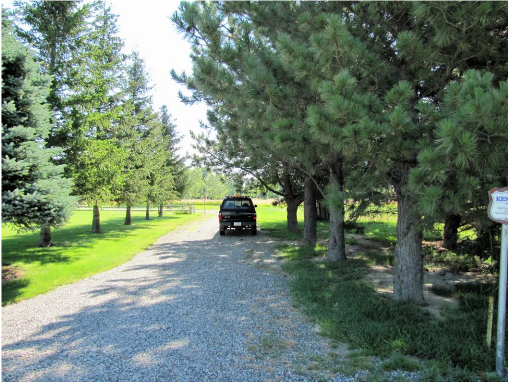
Lewis Avenue looking east