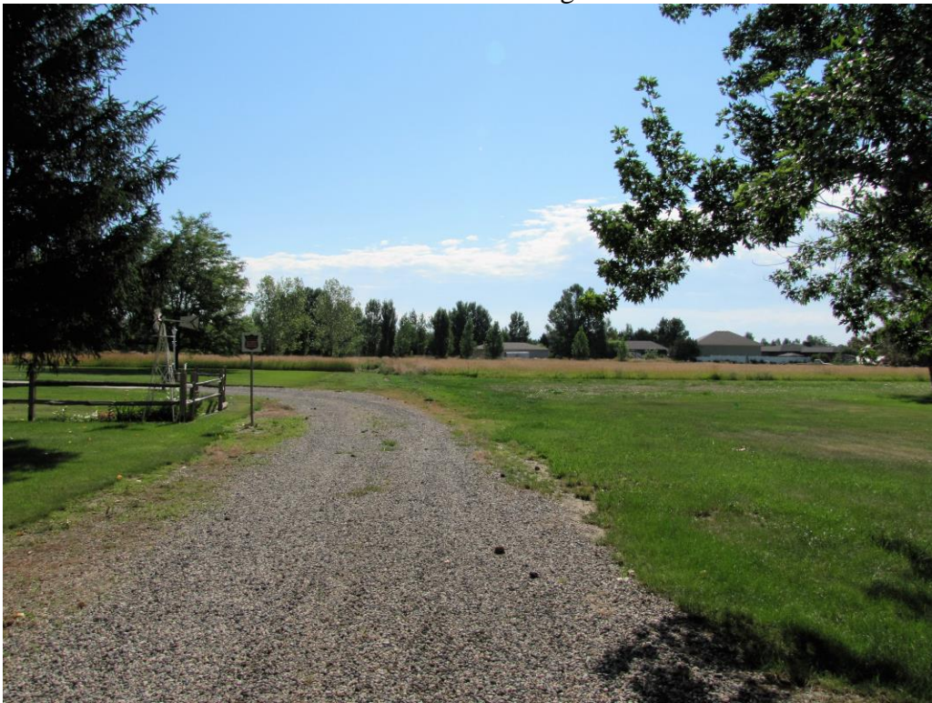
Lewis Avenue looking East subject property on the right.