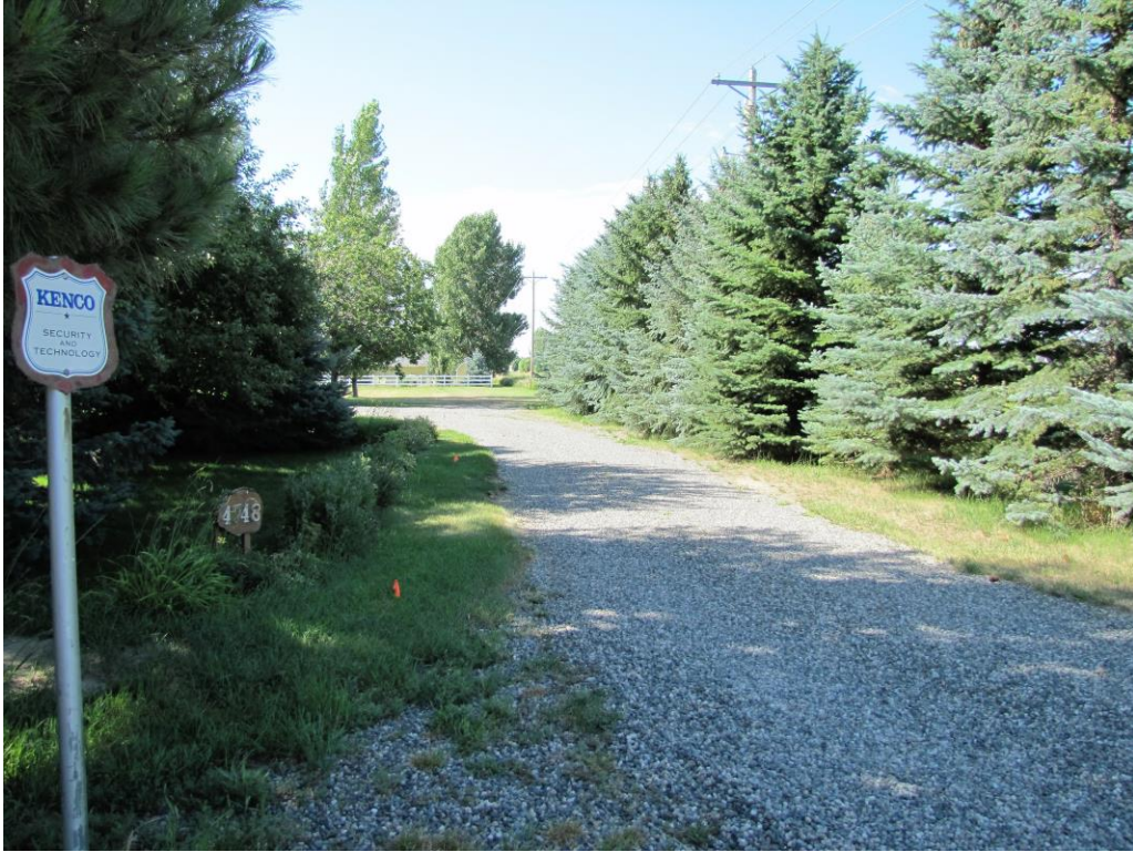
Location of 20 wide access to lot 9