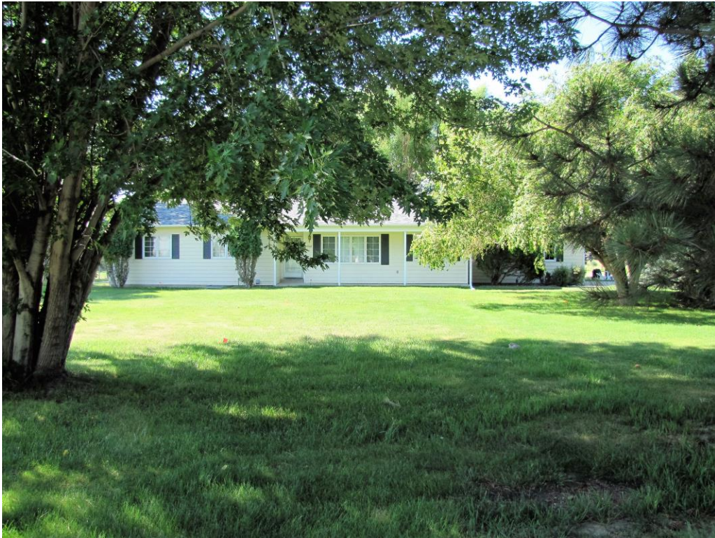
Existing home on subject property