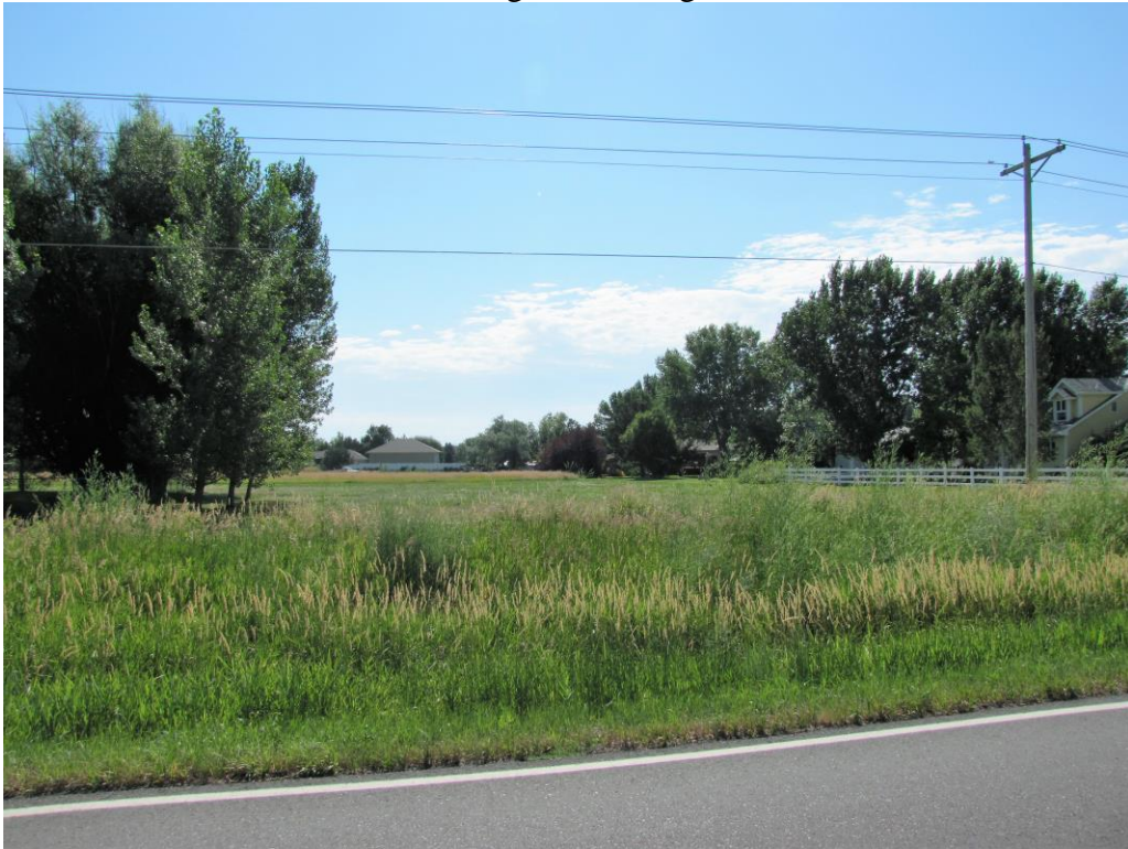
Looking east from 48 th Street West across subject property