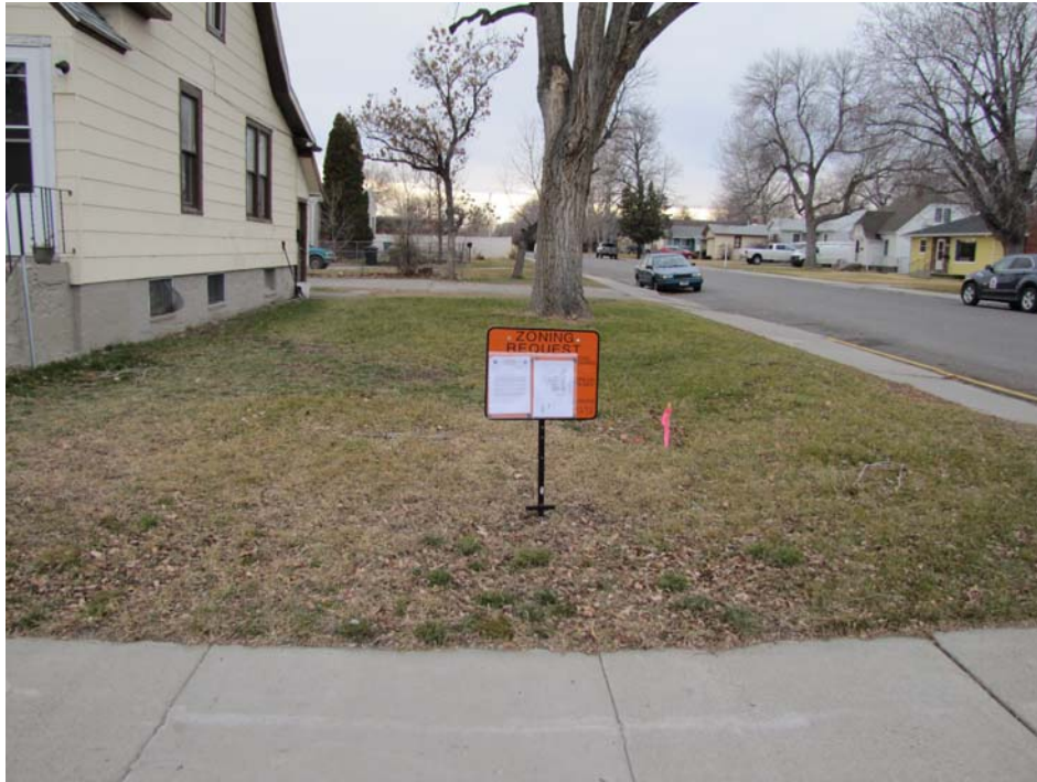
Corner of 8 th Ave & Avenue B