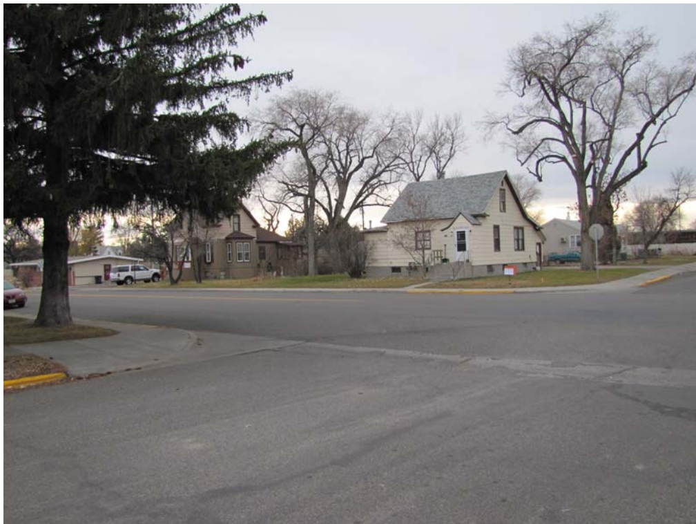
Looking South East toward the subject property