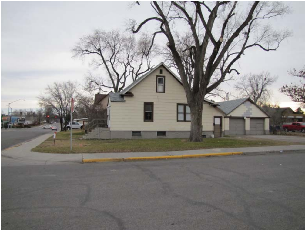
Looking South Toward the North house