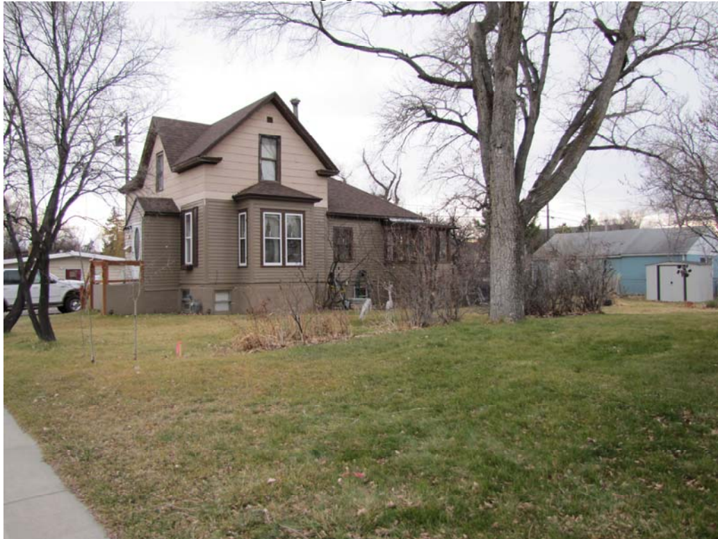
Looking south toward the duplex requesting the variance for lot size