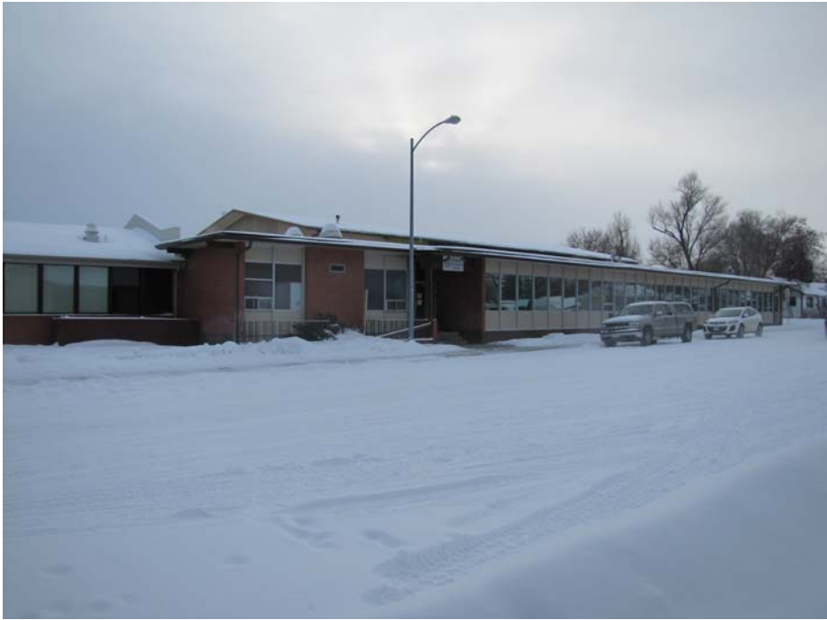
South Across Yellowstone