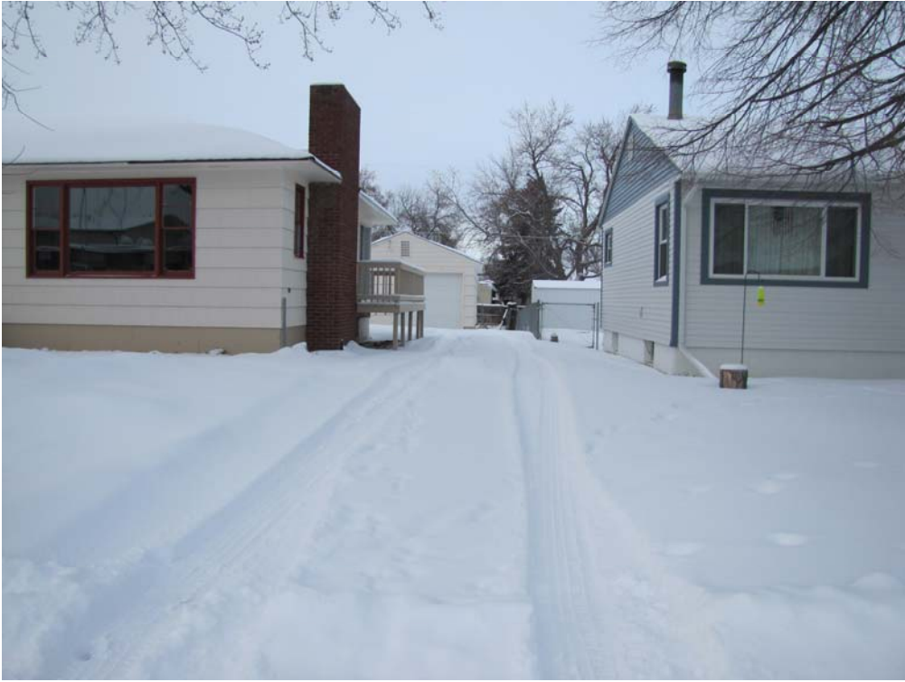
North toward rear of property