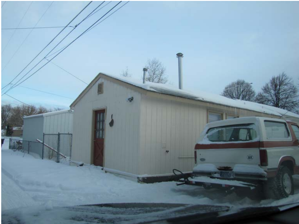
House #2 at alley