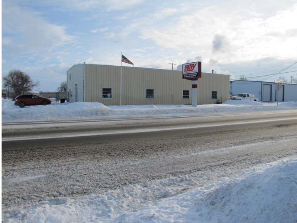
South Across 1 st Ave S