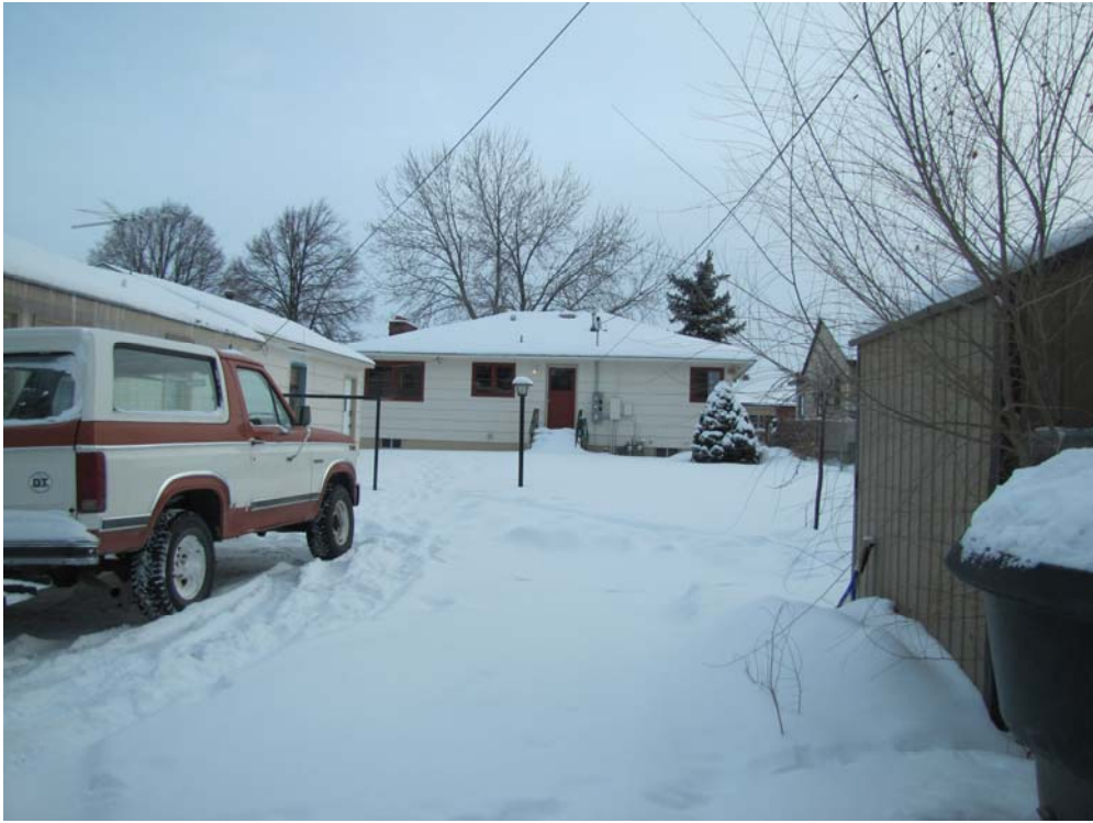
Looking from Alley to front house