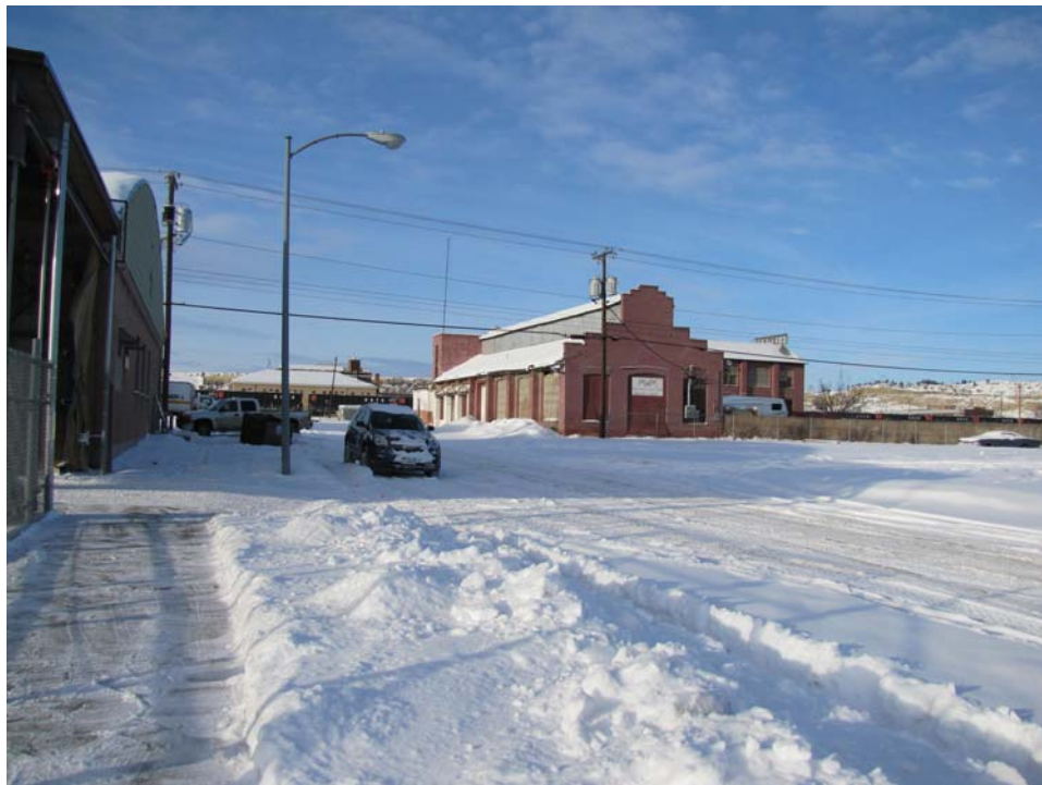
Looking NW on S 23 rd