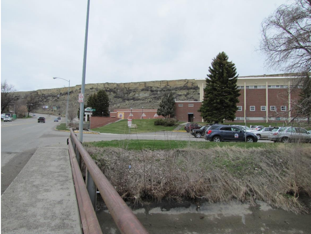
View north on N 27 th Street from BBWA bridge