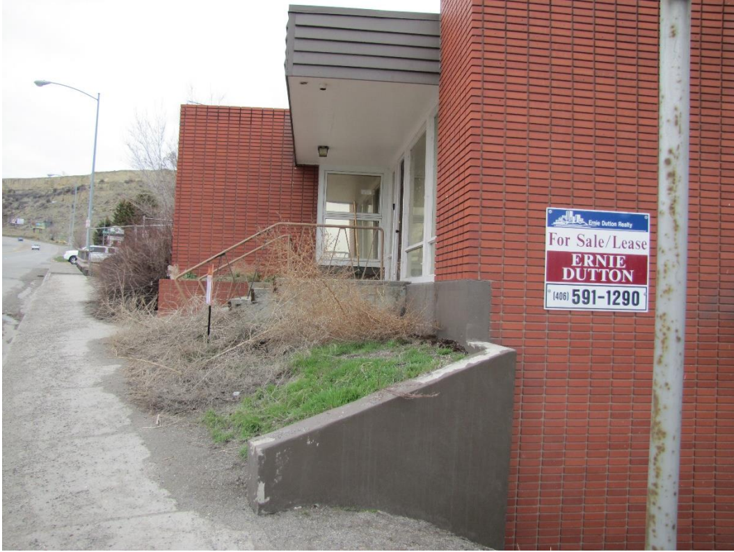
View north along N 27 th Street