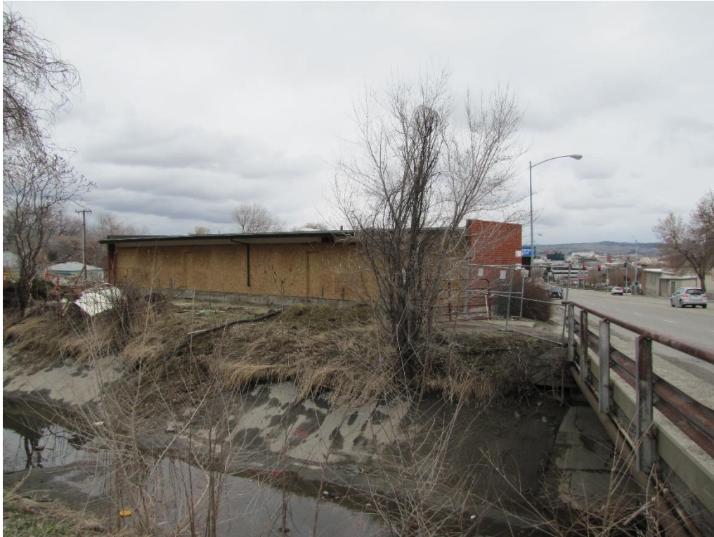
View south at north elevation of existing building