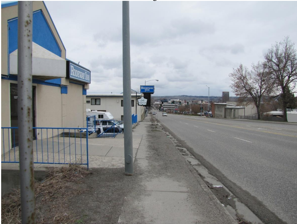
View south along N 27 th Street