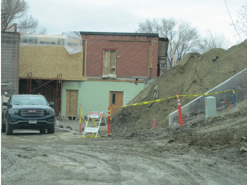
View at east elevation of building from alley access East half of the building already demolished