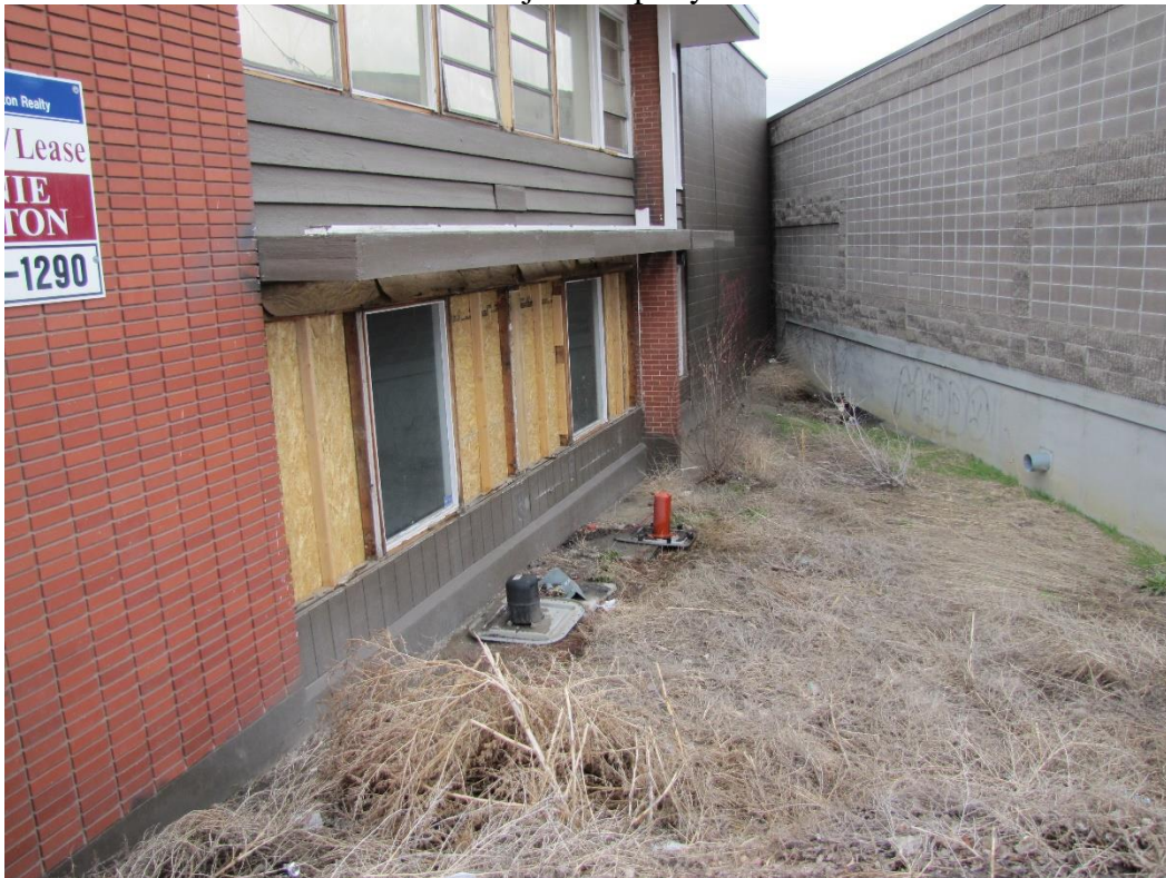
View of south elevation of building