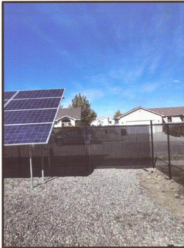
PHOTO 4: NORTHERN PHOTOVOLTAIC ARRAY, STANDING AT EASTERN PERIMETER OF FENCED AREA, LOOKING NORTH.