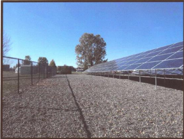
PHOTO 6: SOUTHERN PHOTOVOLTAIC ARRAY, STANDING AT EASTERN PERIMETER OF FENCED AREA, LOOKING WEST.

06/29/17 11:00 PM | M:\IORS\SD2_Electrical\SD2_PVA\Arch\CAD\SD2R11_SKVPU_SITE.dwg