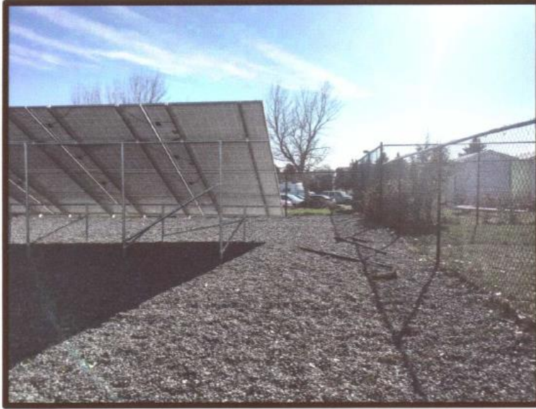
PHOTO 5: SOUTHERN PHOTOVOLTAIC ARRAY, STANDING AT WESTERN PERIMETER OF FENCED AREA, LOOKING SOUTH.