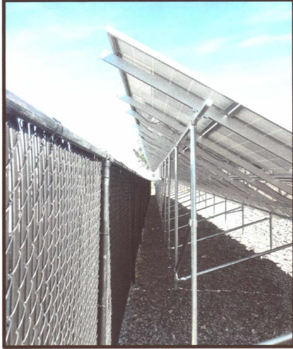
PHOTO 3: NORTHERN PHOTOVOLTAIC ARRAY, STANDING WITHIN FENCED AREA, LOOKING EAST.