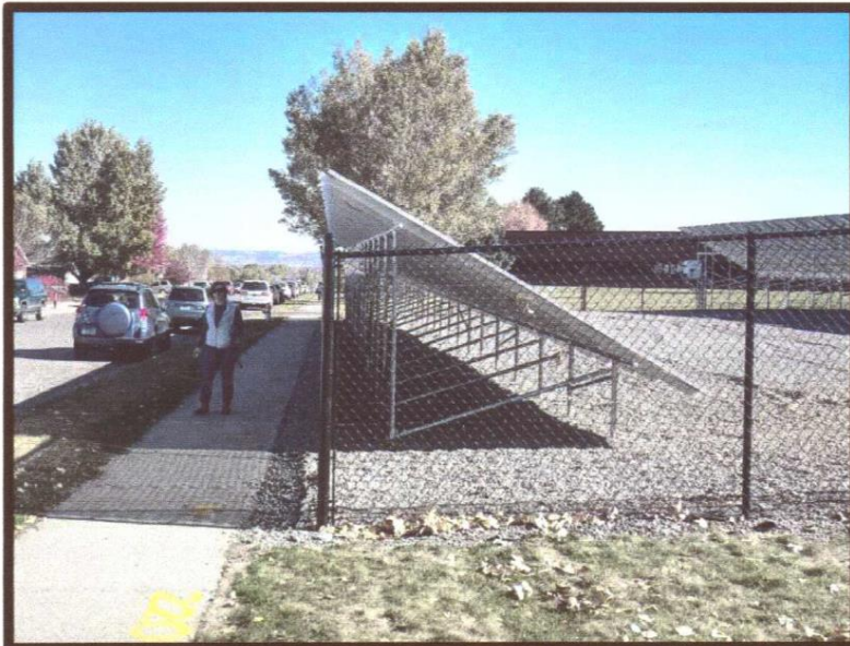
PHOTO 2: NORTHERN PHOTOVOLTAIC ARRAY, STANDING WITHIN ROW AT SIESTA AVE, LOOKING EAST