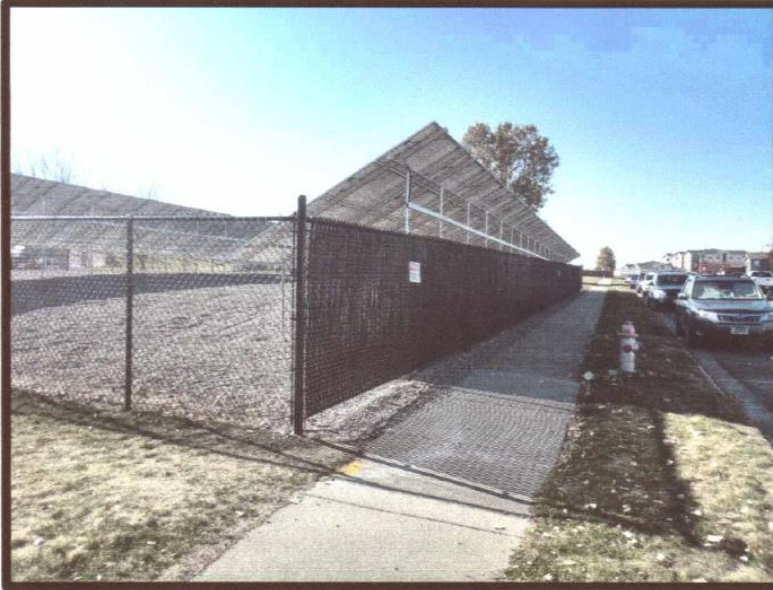
PHOTO 1: NORTHERN PHOTOVOLTAIC ARRAY, STANDING WITHIN ROW AT INTERSECTION OF SIESTA AVE AND DRIVEWAY, LOOKING WEST