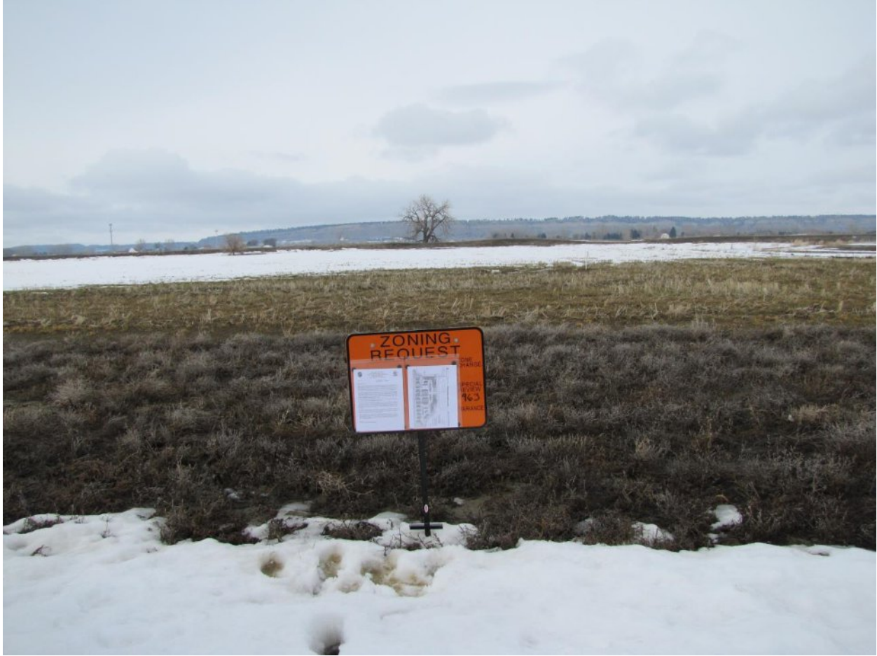
Looking North from Georgina