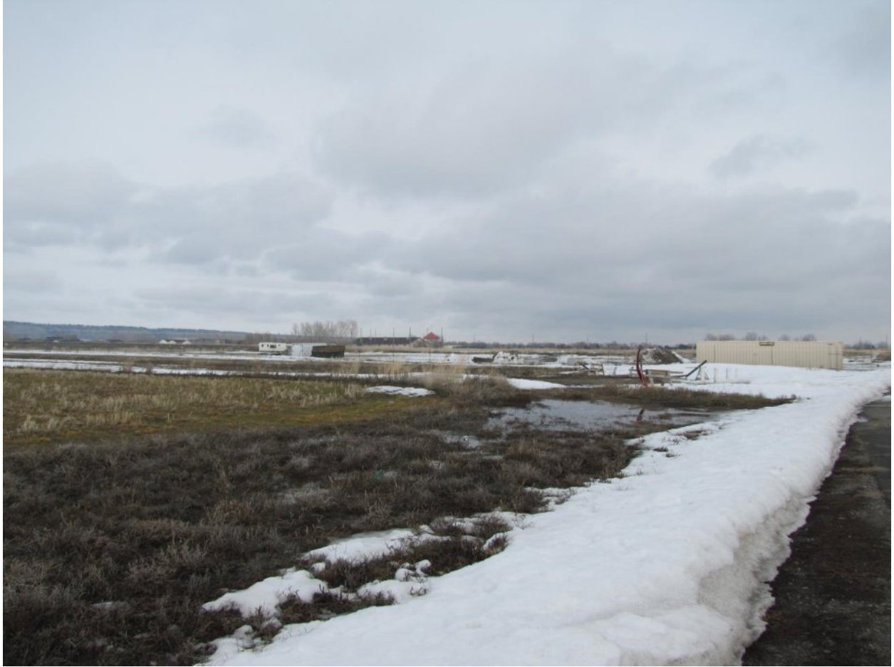
Looking East from Georgina