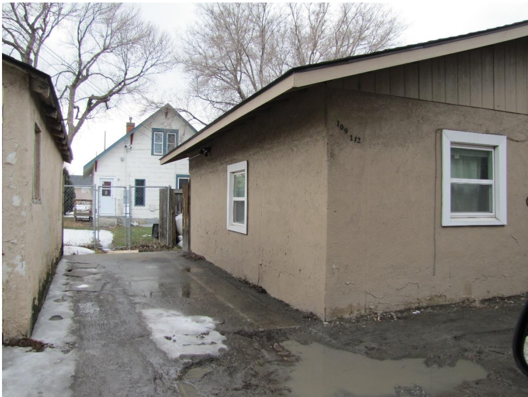
Alley looking Southwest