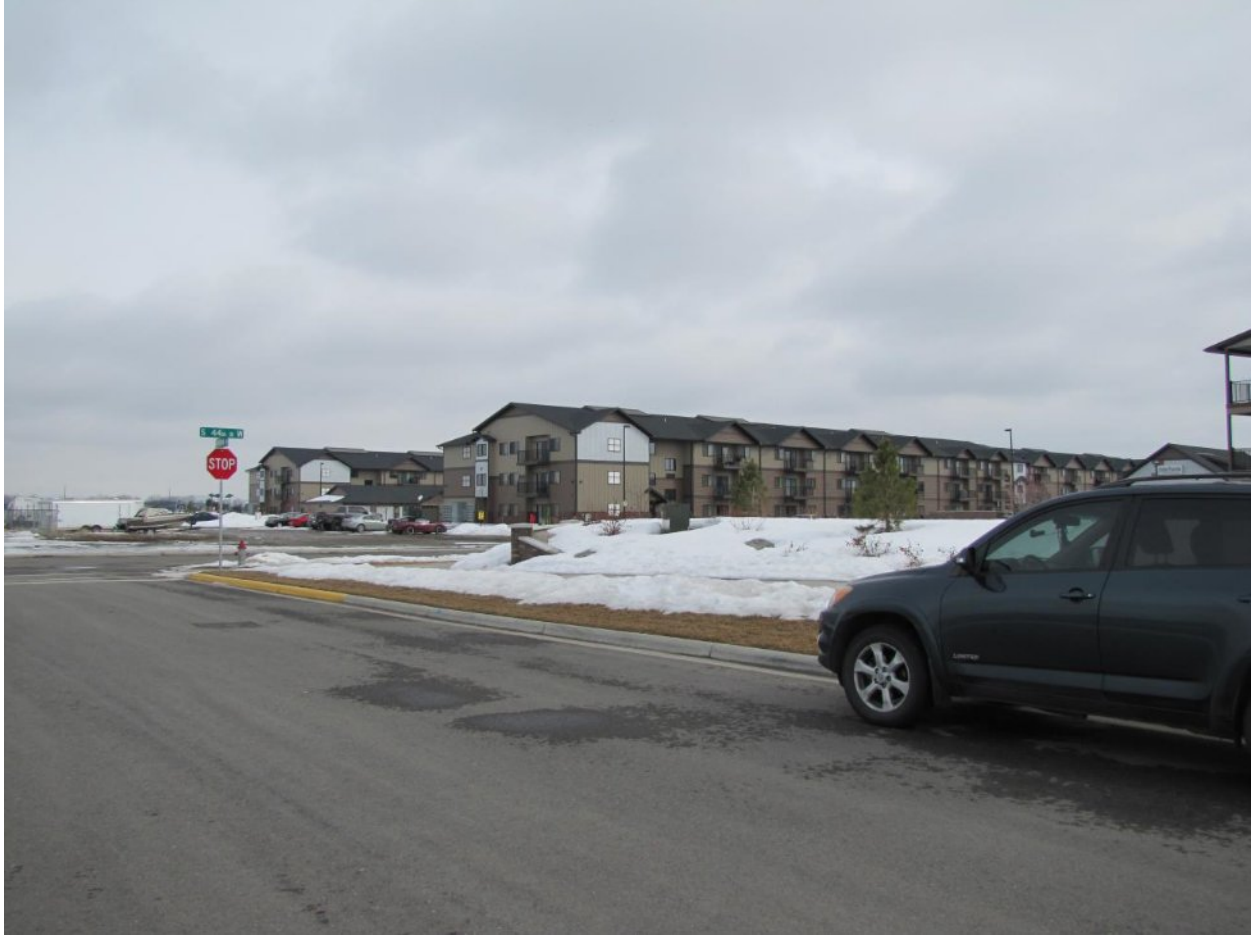
East towards intersection of Georgina and South 44th Street West