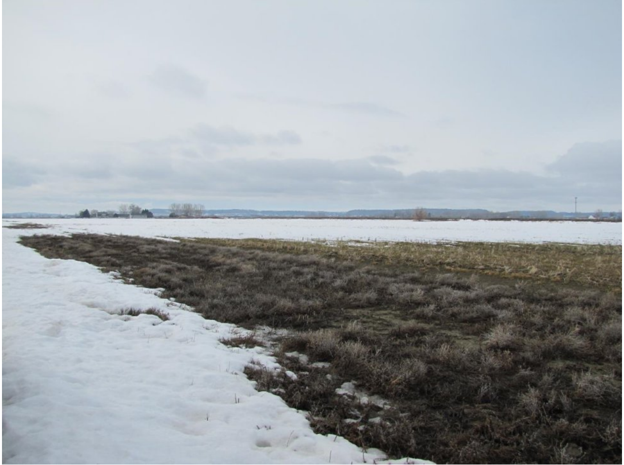
Looking East from Georgina