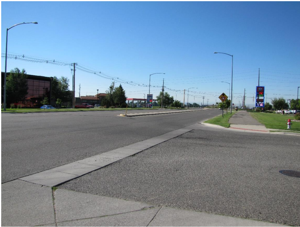
View south along Shiloh Road