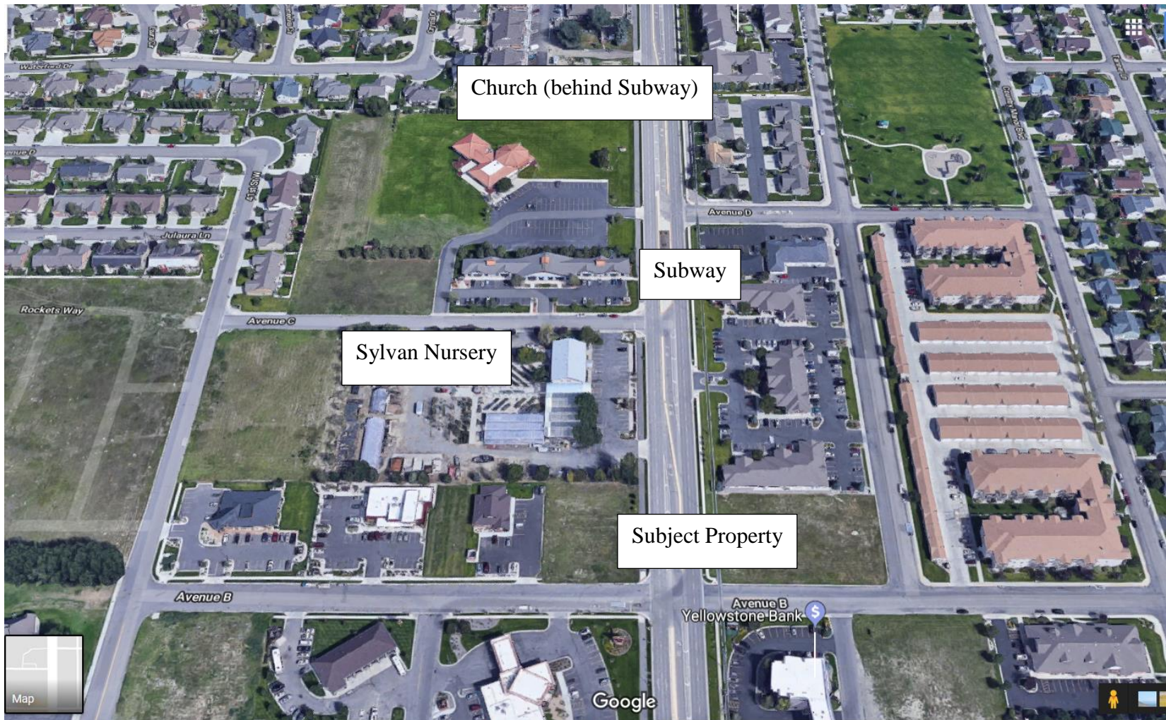
View-shed between subject property and church property