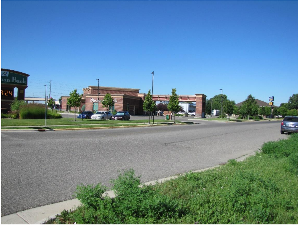
View south west across Avenue B