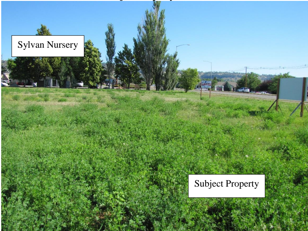
View north across property