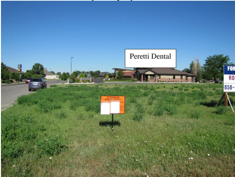
Subject Property – view west along Avenue B