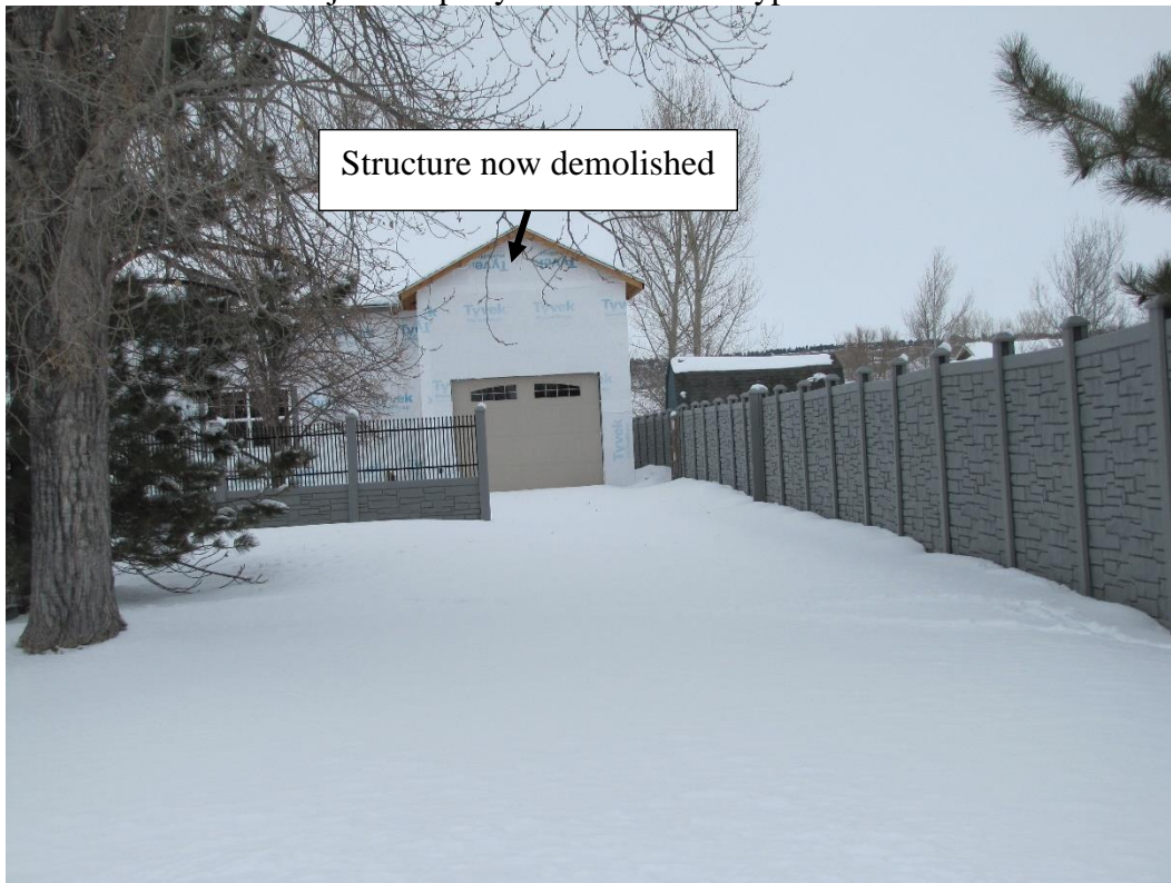
Subject Property – view from Hazelnut