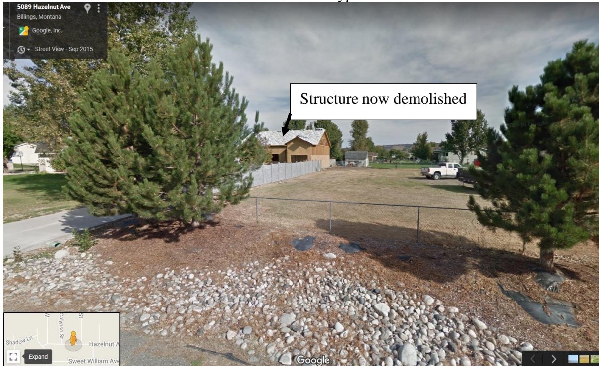
View from Hazelnut