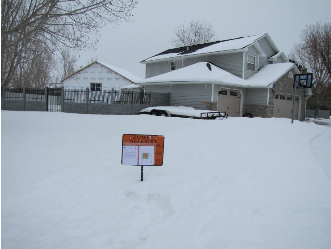
Subject Property – view from Calypso Street