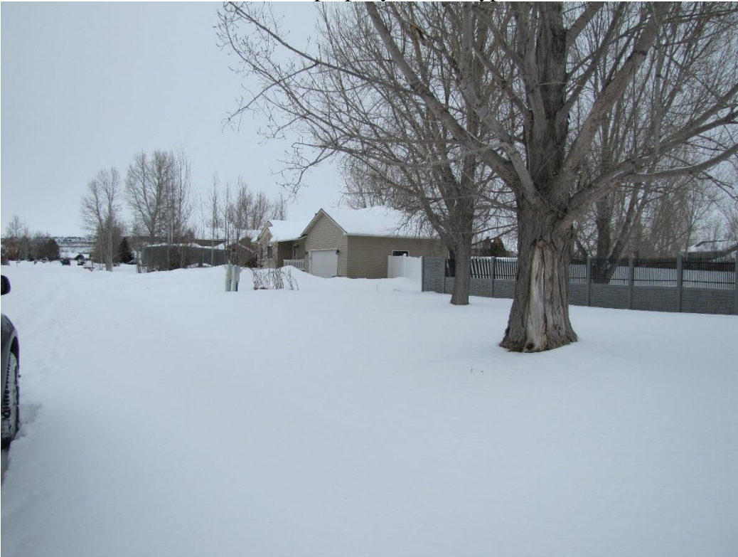
View north along Calypso Street