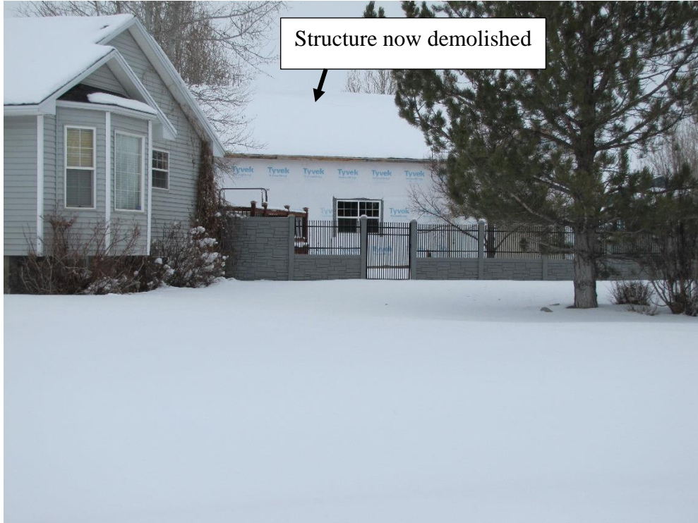
View from intersection of Calypso and Hazelnut