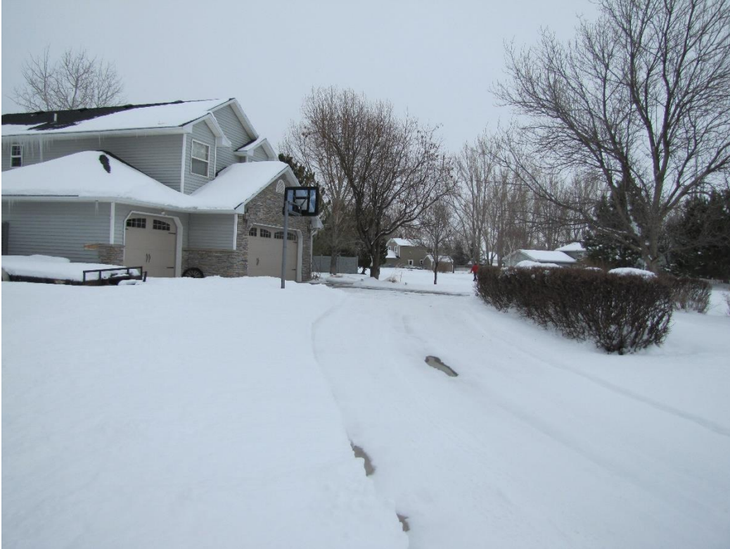
View south across the property from Calypso to Hazelnut