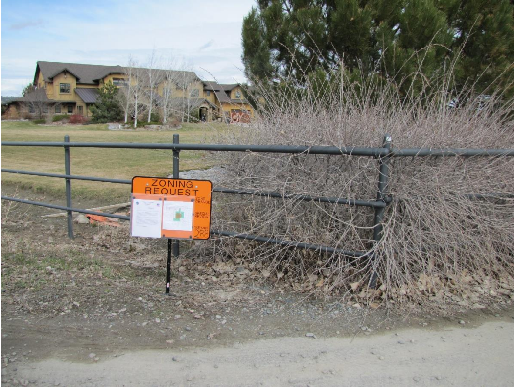
Subject Property – view from 66 th St West