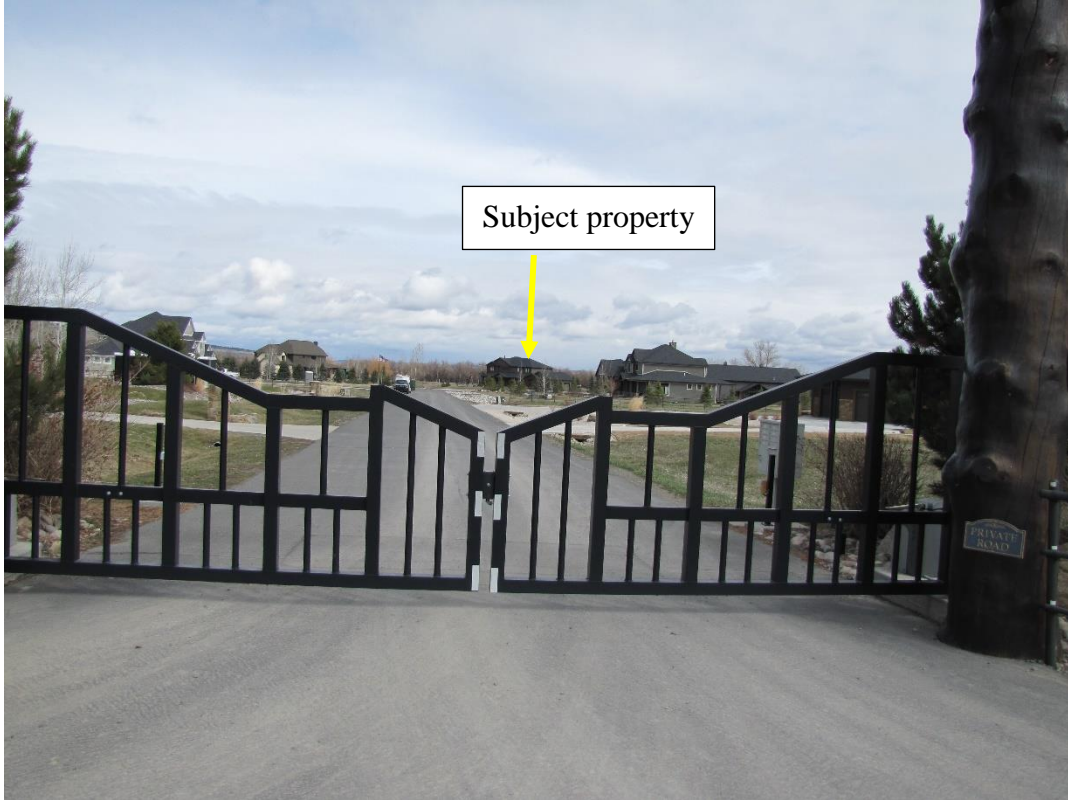
View from gated entrance