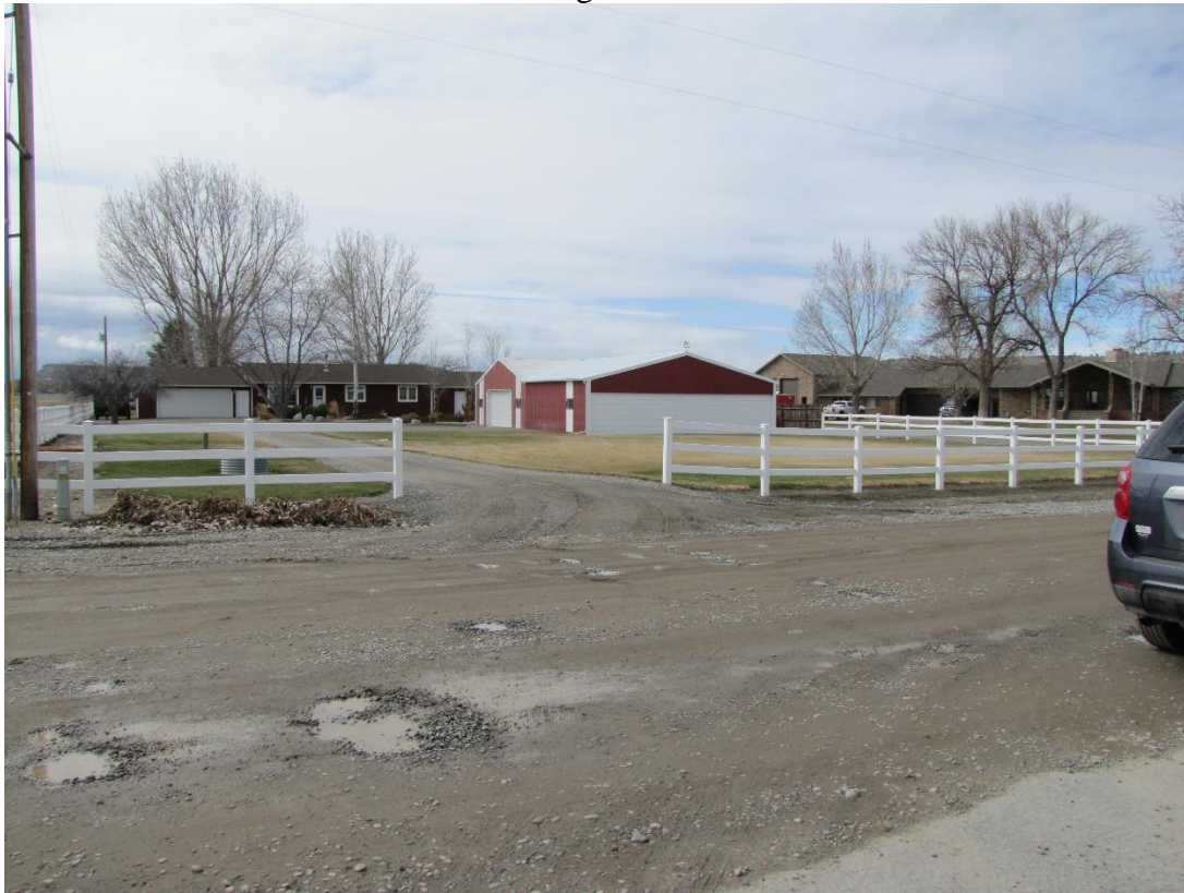
West across 66 th St West – 1724 66 th St West