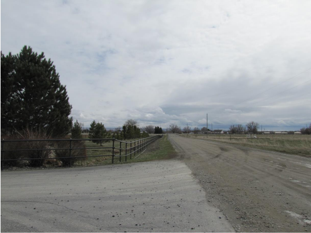
View south along 66 th St West