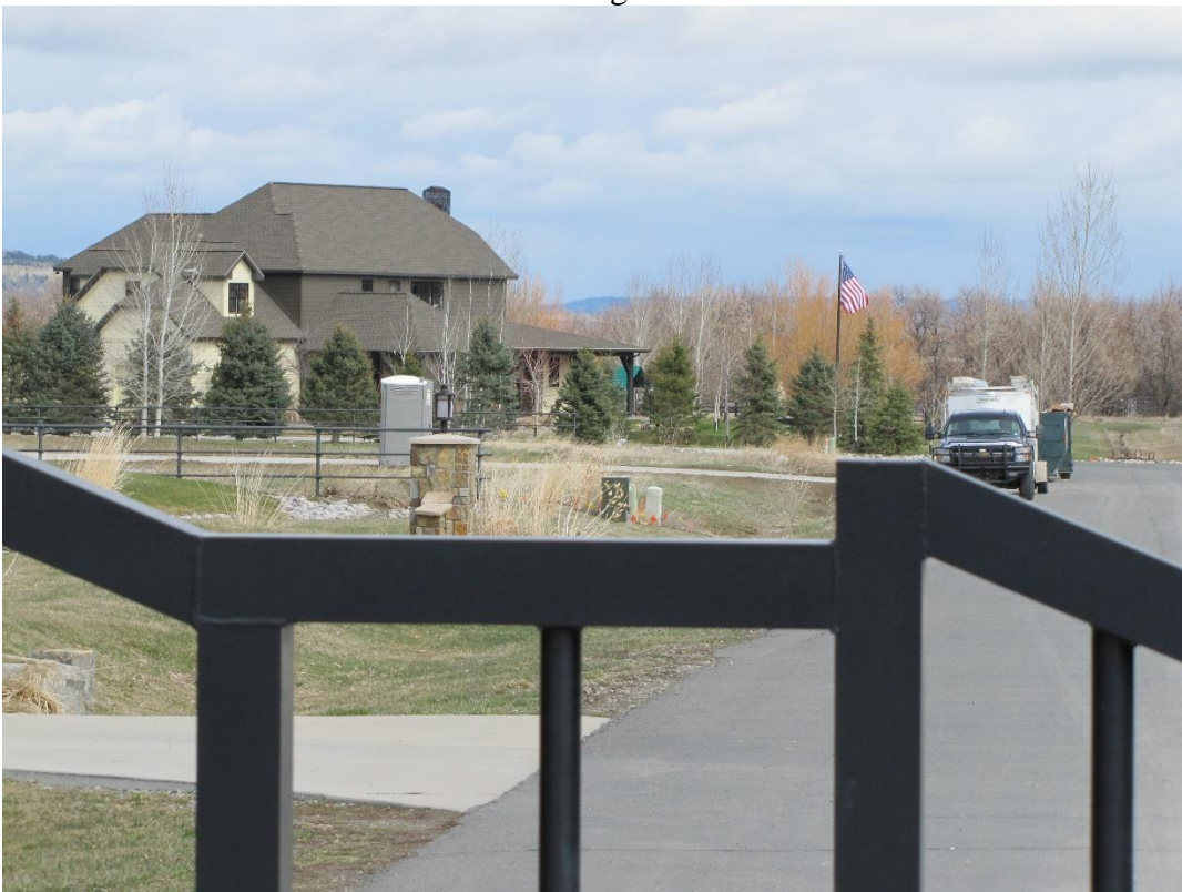
View east from gate to property north of 6500 Cold Stone Lane