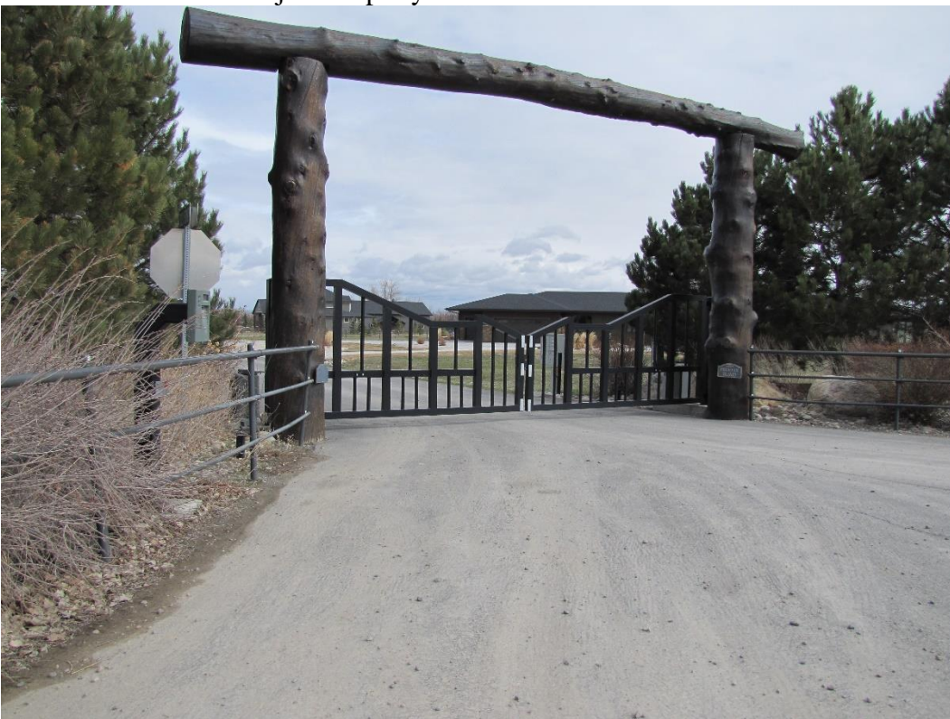
Cold Stone Estates – entrance (locked gate)