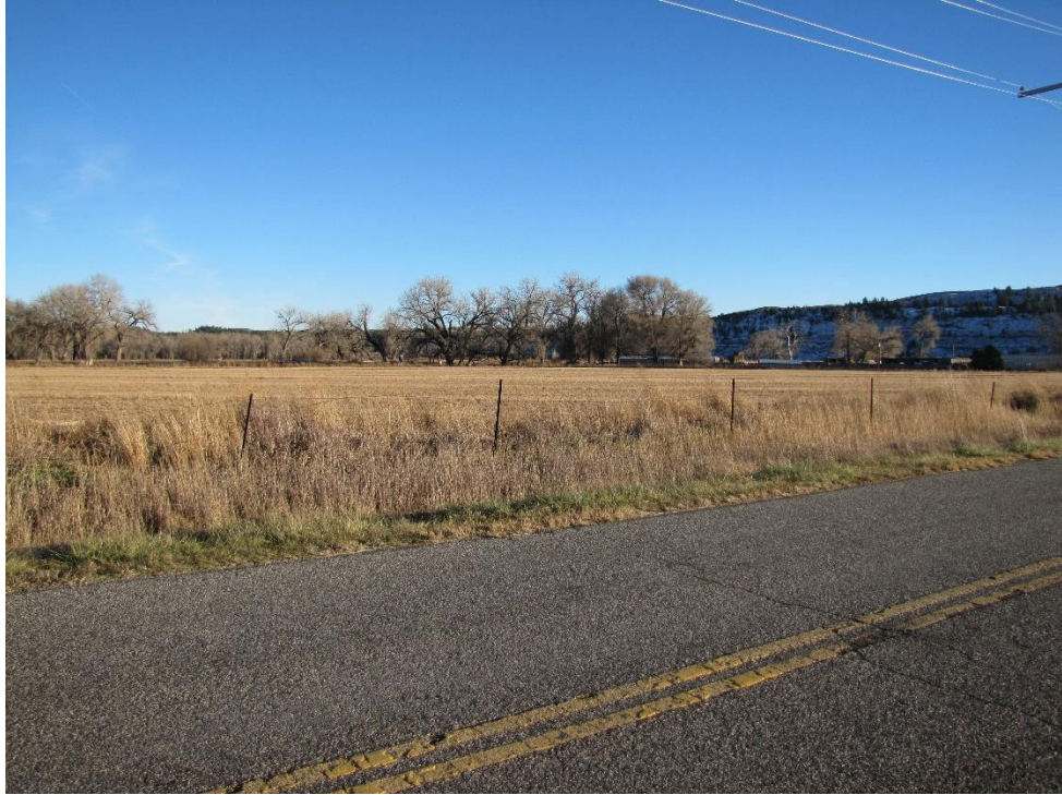
View south east across Wise Lane