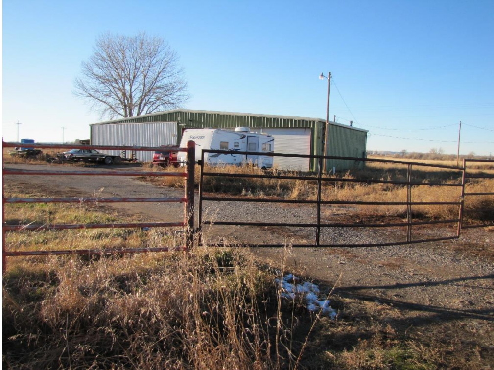
Warehouse to remain (not part of gravel operation)