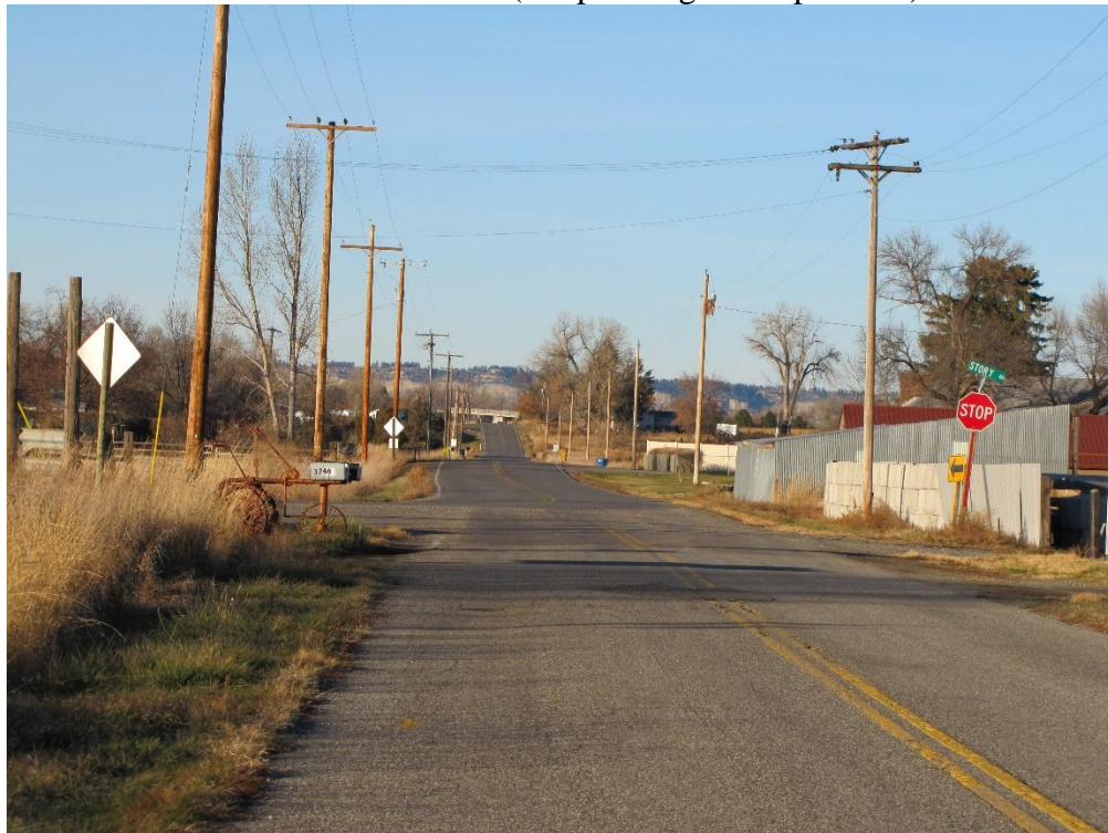
View north along Wise Lane from south of intersection with Story Road