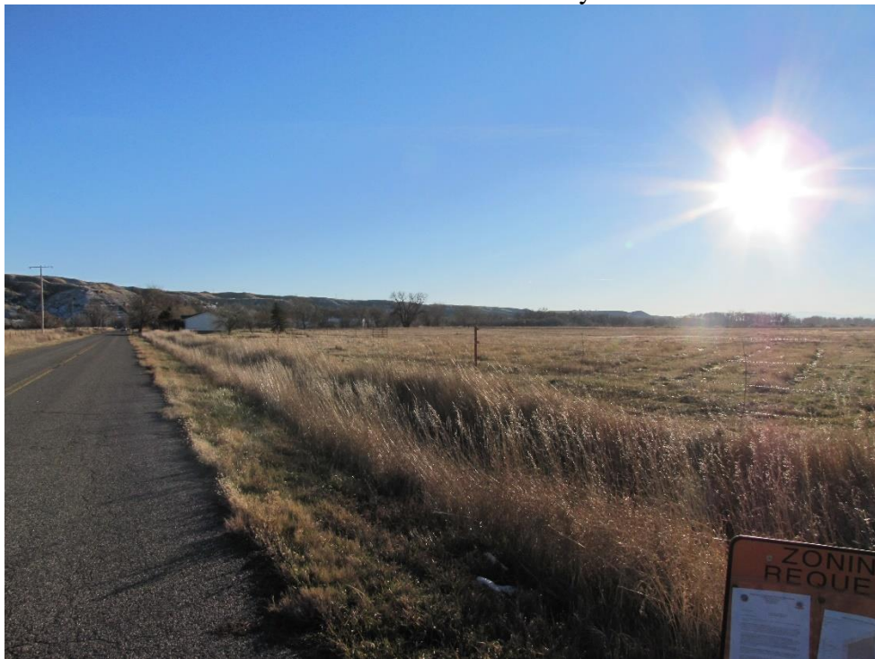
View south along Wise Lane