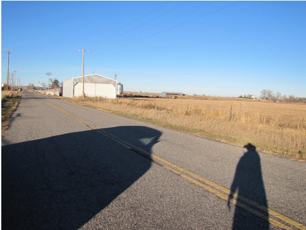
View north east across Wise Lane