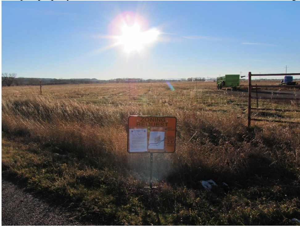
View south west from Wise Lane & Story Rd intersection

Subject property from S 48 th Street West – Greenhouse & Office building