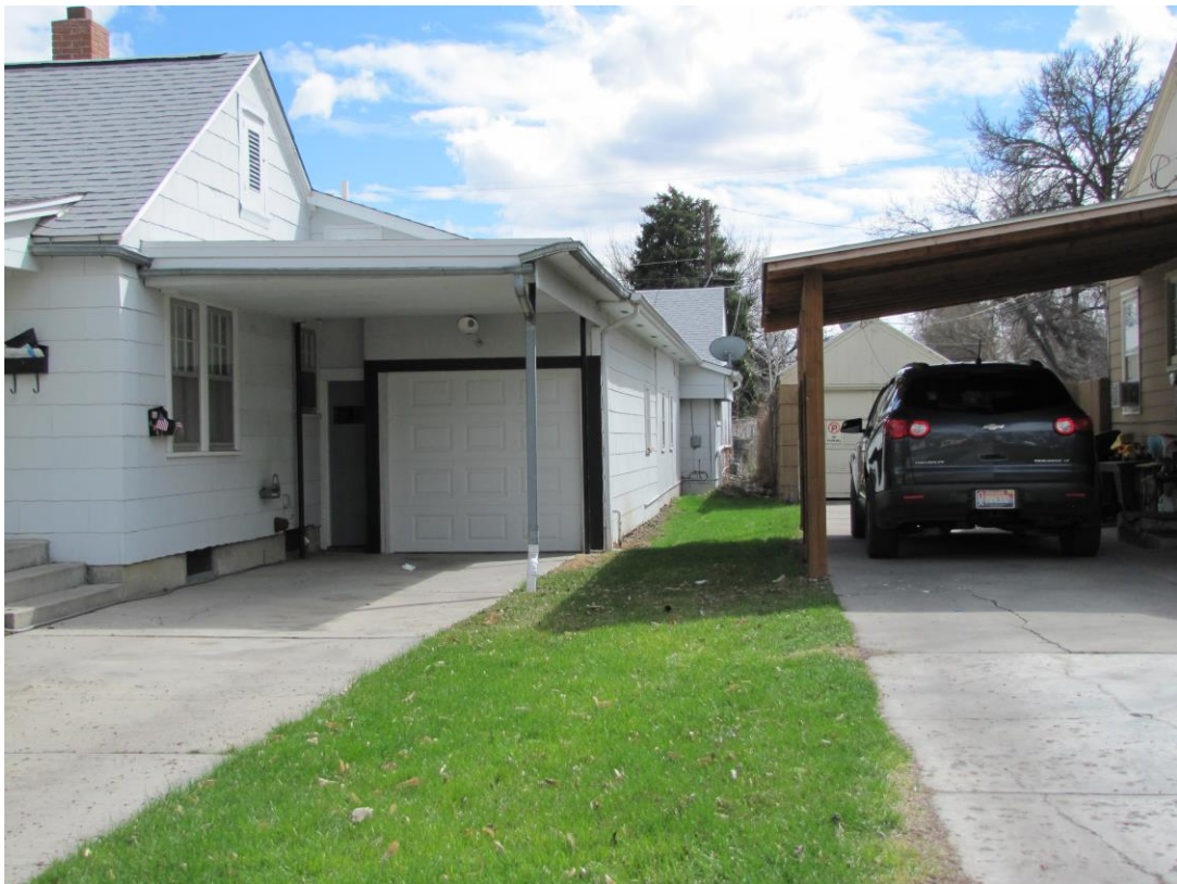
Looking South down the west side of the parcel