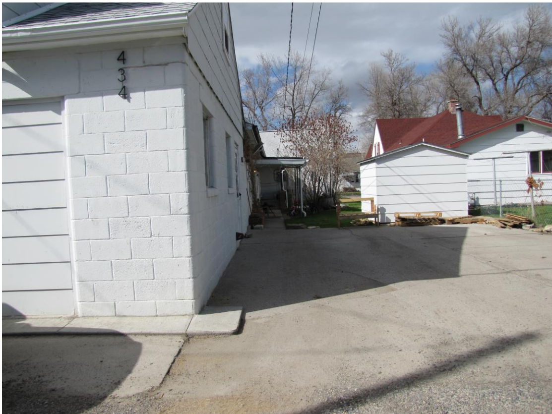
East Side looking north from alley