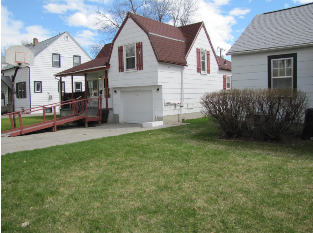
Property to the east