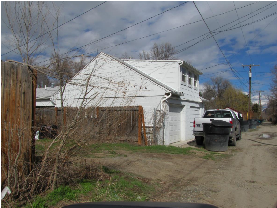
Property from the alley