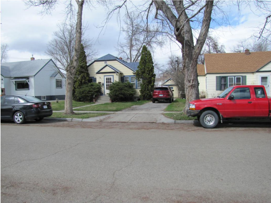
Looking North across Alderson