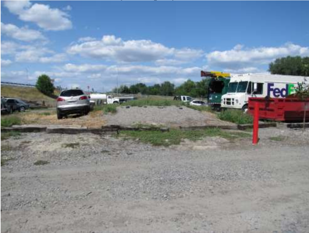
View north across Kimble to Jim & Tracy's Alignment – interstate frontage