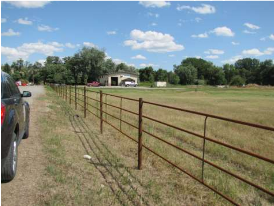
View east along Kimble Drive