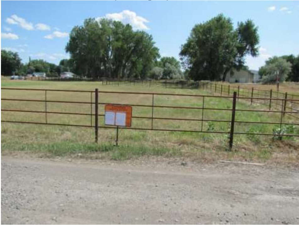
Subject Property – north west corner of subject property