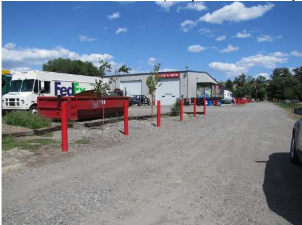
View north and east across Kimble Drive