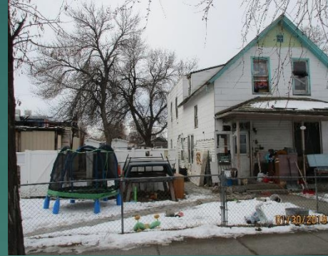
114 S 29 th St Jan 2019