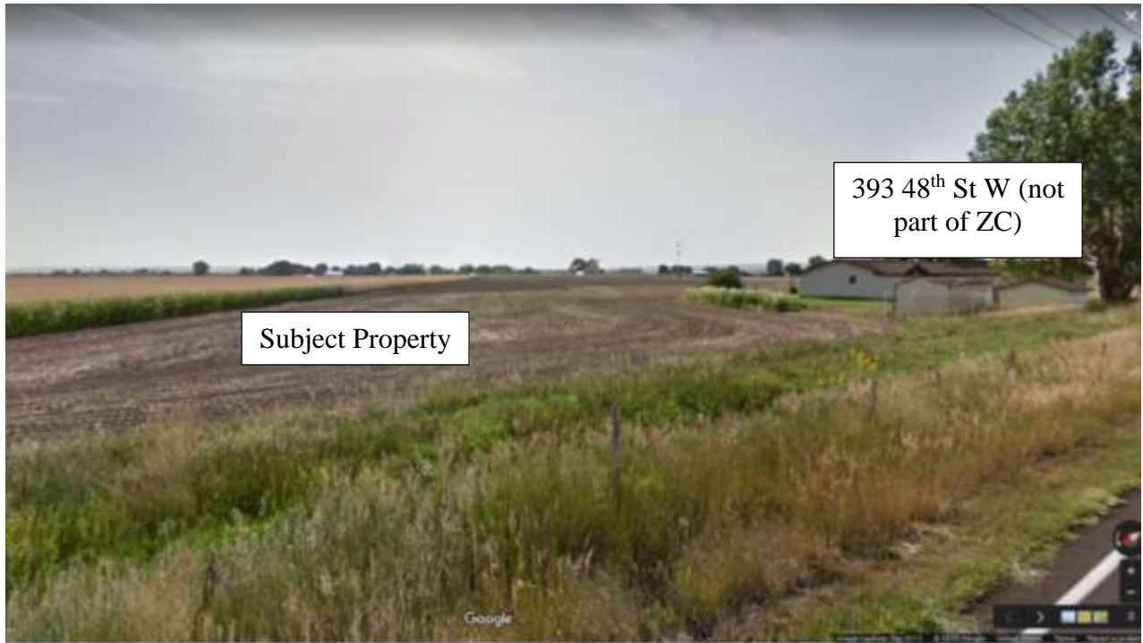
View south and east across subject property from 48 th St West