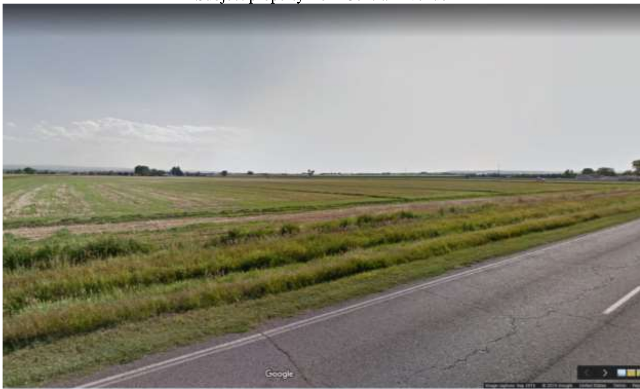
View south and west from subject property across Central Avenue