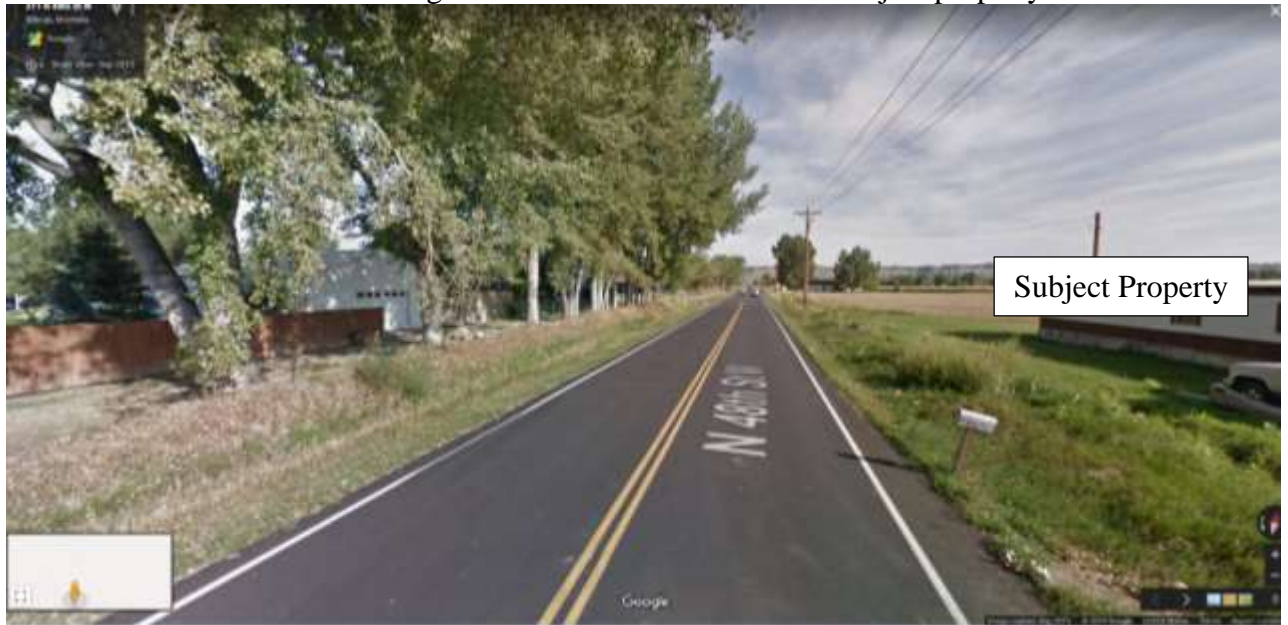
View north along 48 th St W from SW corner of subject property