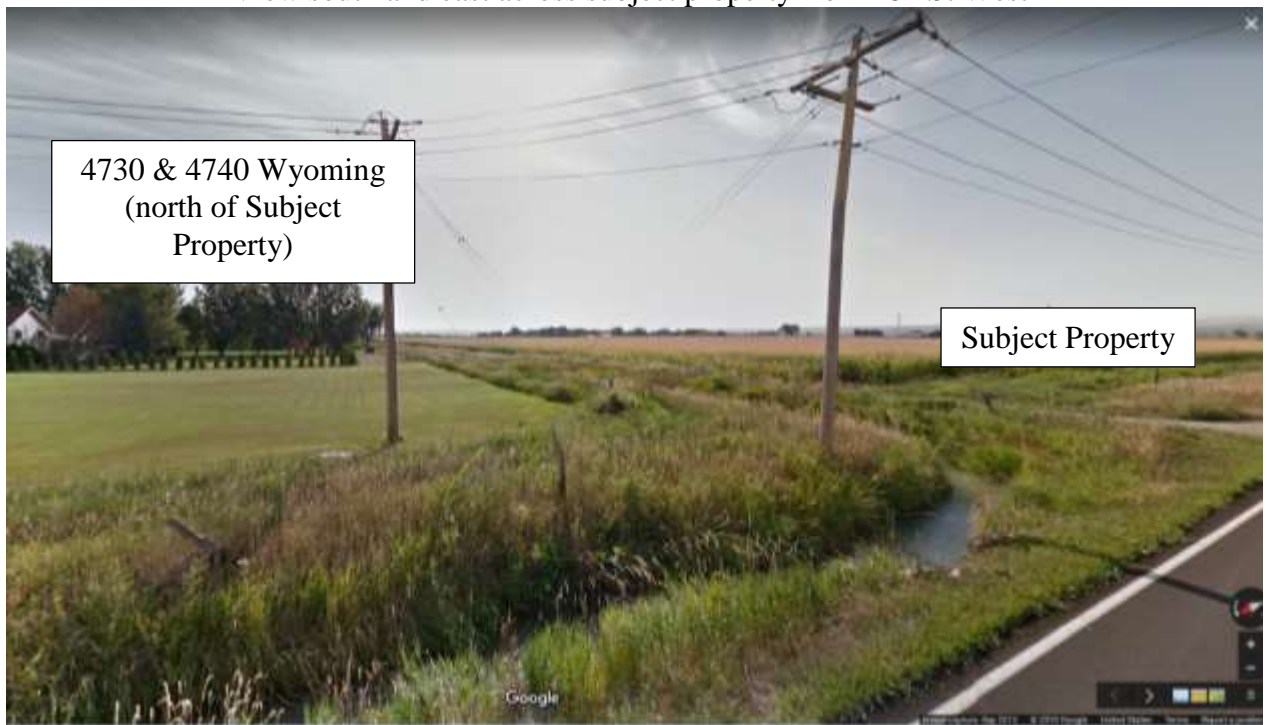
View south and east across subject property (NW corner) from 48 th St West