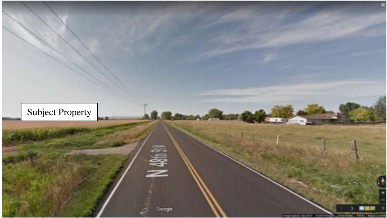
View south along 48 th St W from NW corner of subject property