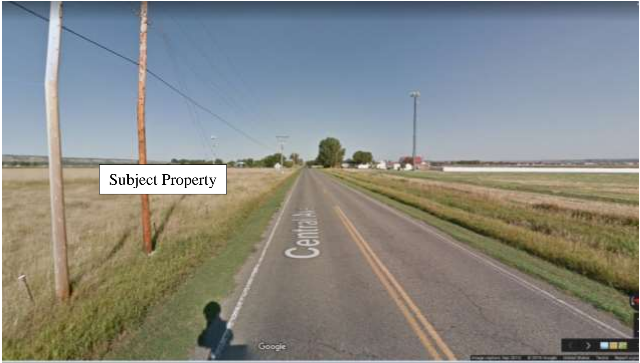
View east along Central Avenue