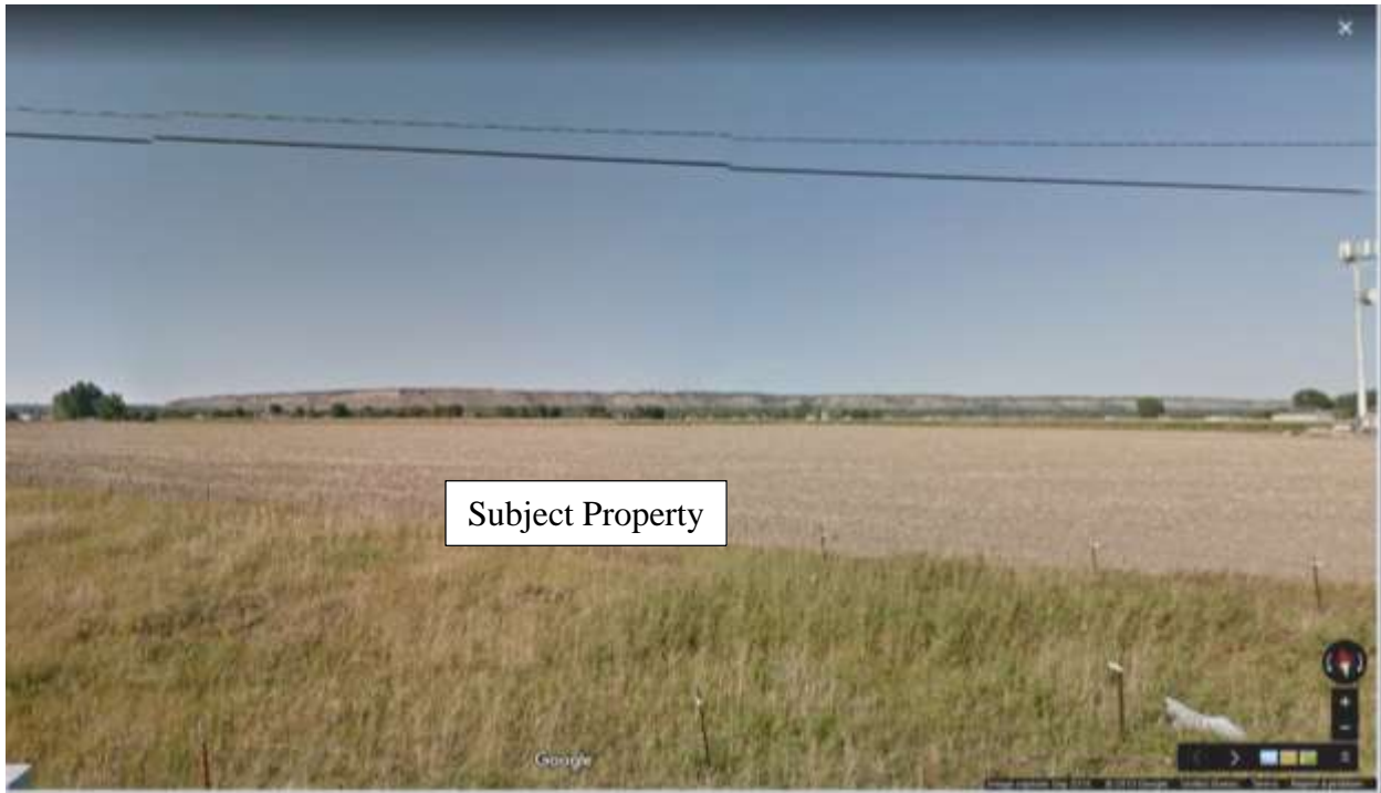
Subject property from Central Avenue