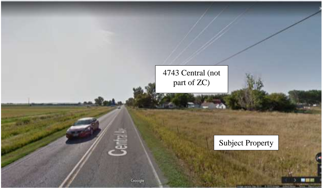
View west along Central Avenue